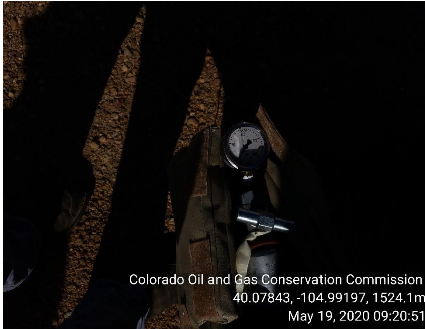
Photo 1 Casing pressure Opsi