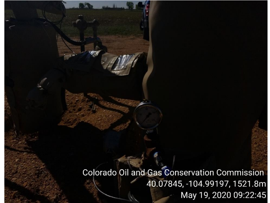
Photo 2 Braden head pressure Opsi