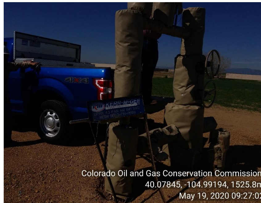
Colorado Oil and Gas Conservation Commission 40.07845, -104.99194, 1525.8m May 19, 2020 09:27:02