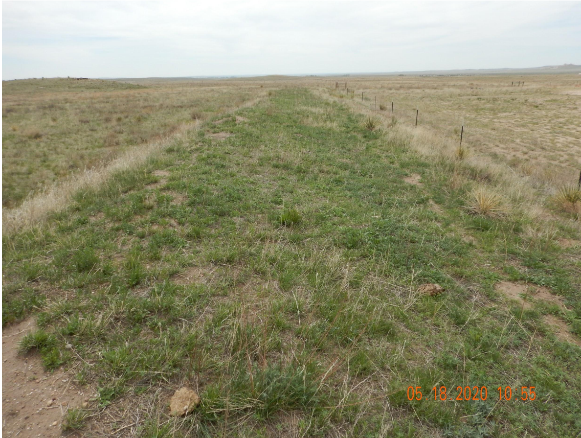
Photo 3. Photo taken from the northeastern perimeter of location, facing South. Photo illustrates a stockpile that is likely topsoil that should be incorporated to facilitate final reclamation activities.