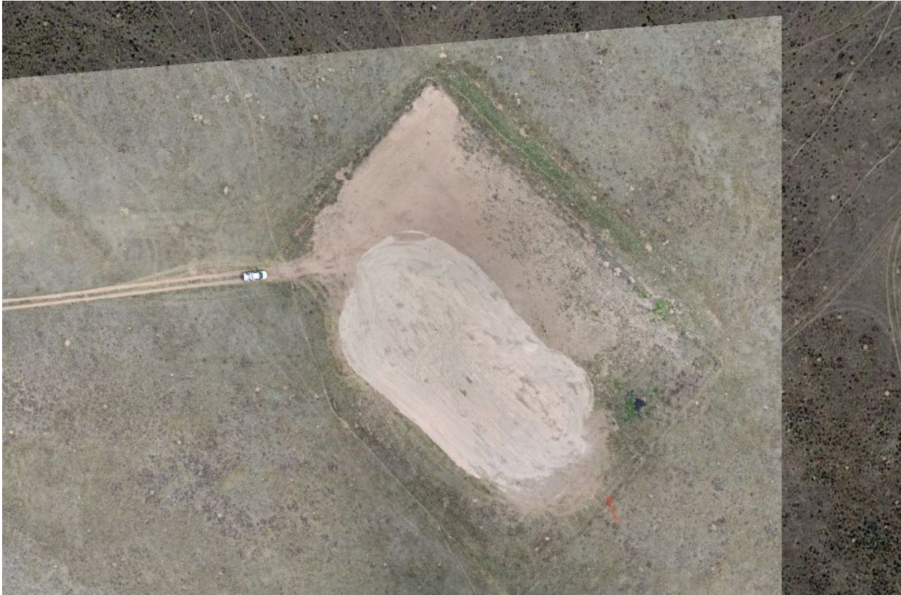
Photo 1. Drone aerial imagery taken May 18, 2020. Aerial imagery illustrates a total well location disturbance of 1.7 acres, a well location access road of ~600' and a stockpile totalling ~250 cy.

Operator has removed the 2 tanks and in-process of cleaning up the spill.