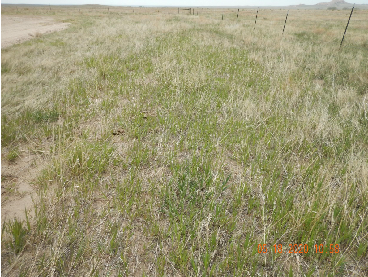
Photo 7. Photo taken from the western interim area, facing South. Photo illustrates an introduced grass species, Smooth brome, has been planted.