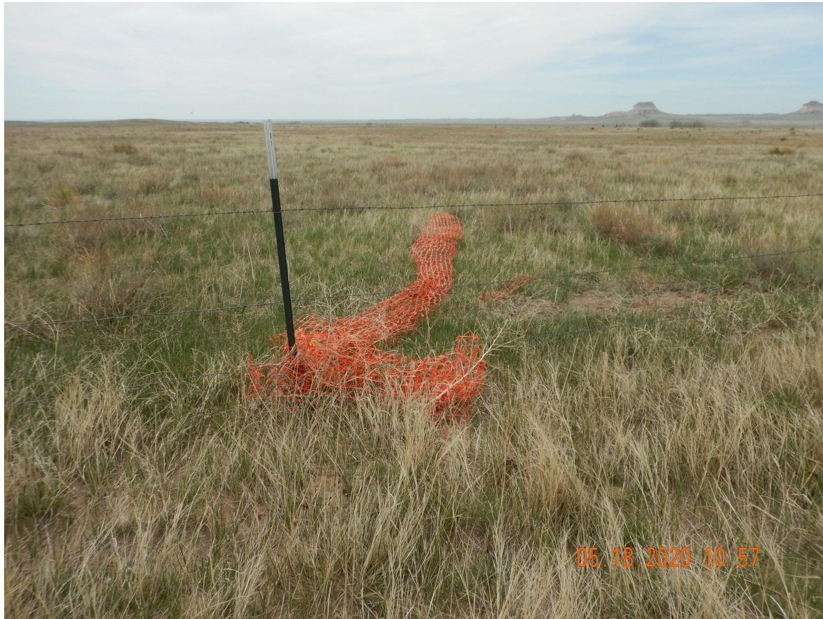
Photo 6. Photo taken from the southern location, facing South. Photo illustrates trash/debris left behind.