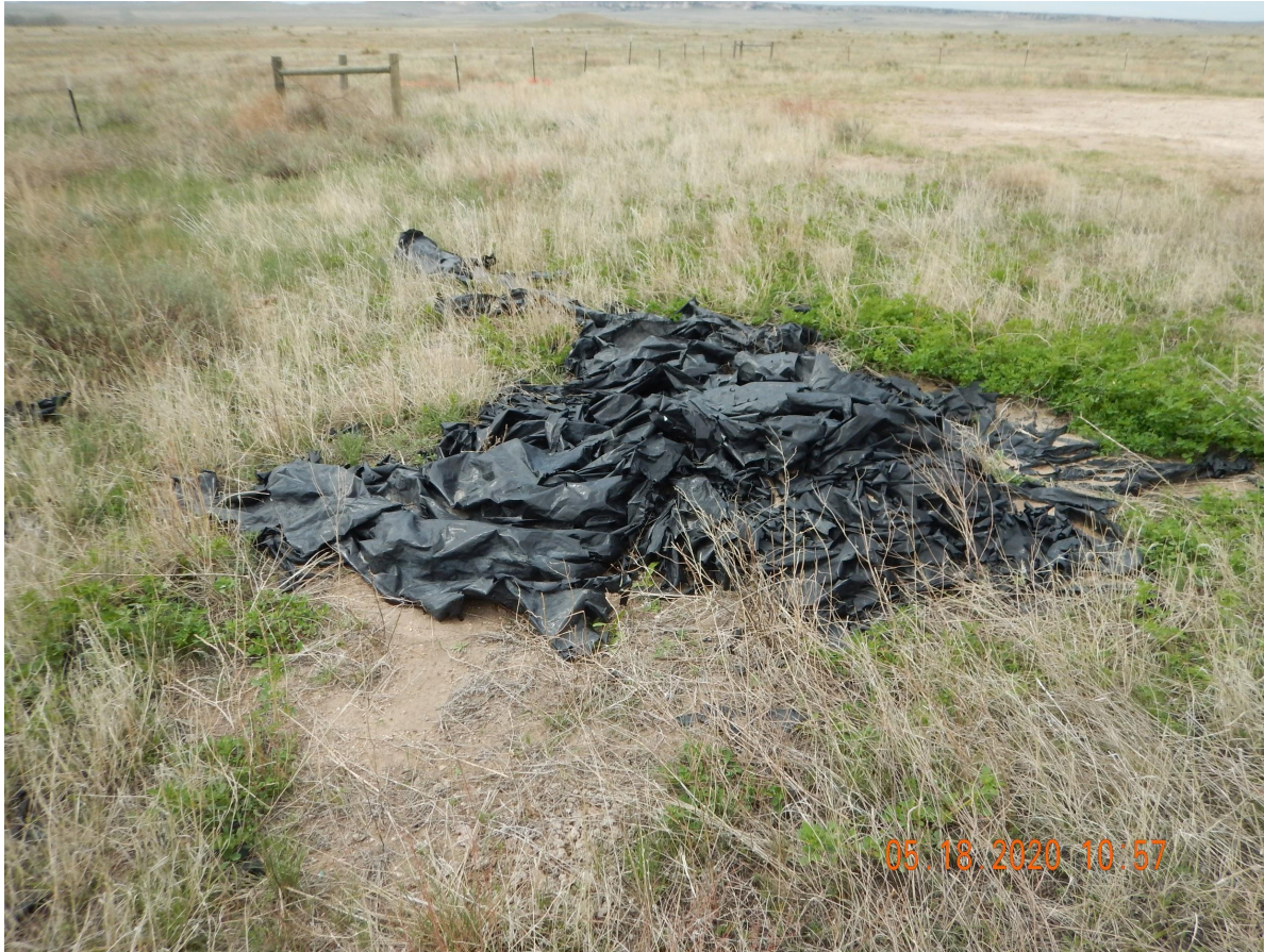
Photo 5. Photo taken from the southern location, facing West. Photo illustrates trash left behind.