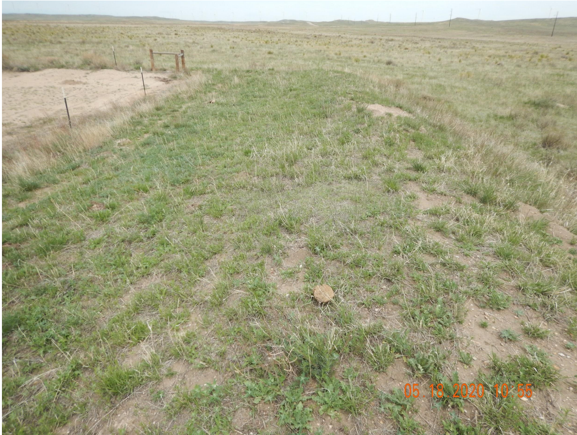
Photo 4. Photo taken from the northeastern perimeter of location, facing North. See comments under Photo 3.