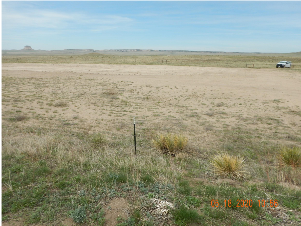
Photo 2. Photo taken from the northeastern perimeter of location, facing Southwest. Photo illustrates Operator has removed the tanks and in-process of cleaning up the spill.