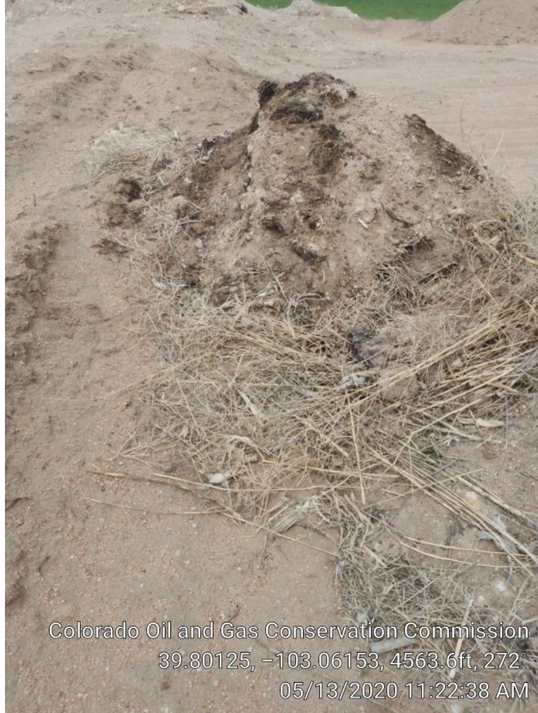
Oily waste pile on NE corner of pit.

Colorado Oil and Gas Conservation Commission 39.80125, -103.06153, 4563.6ft, 272° 05/13/2020 11:22:38 AM