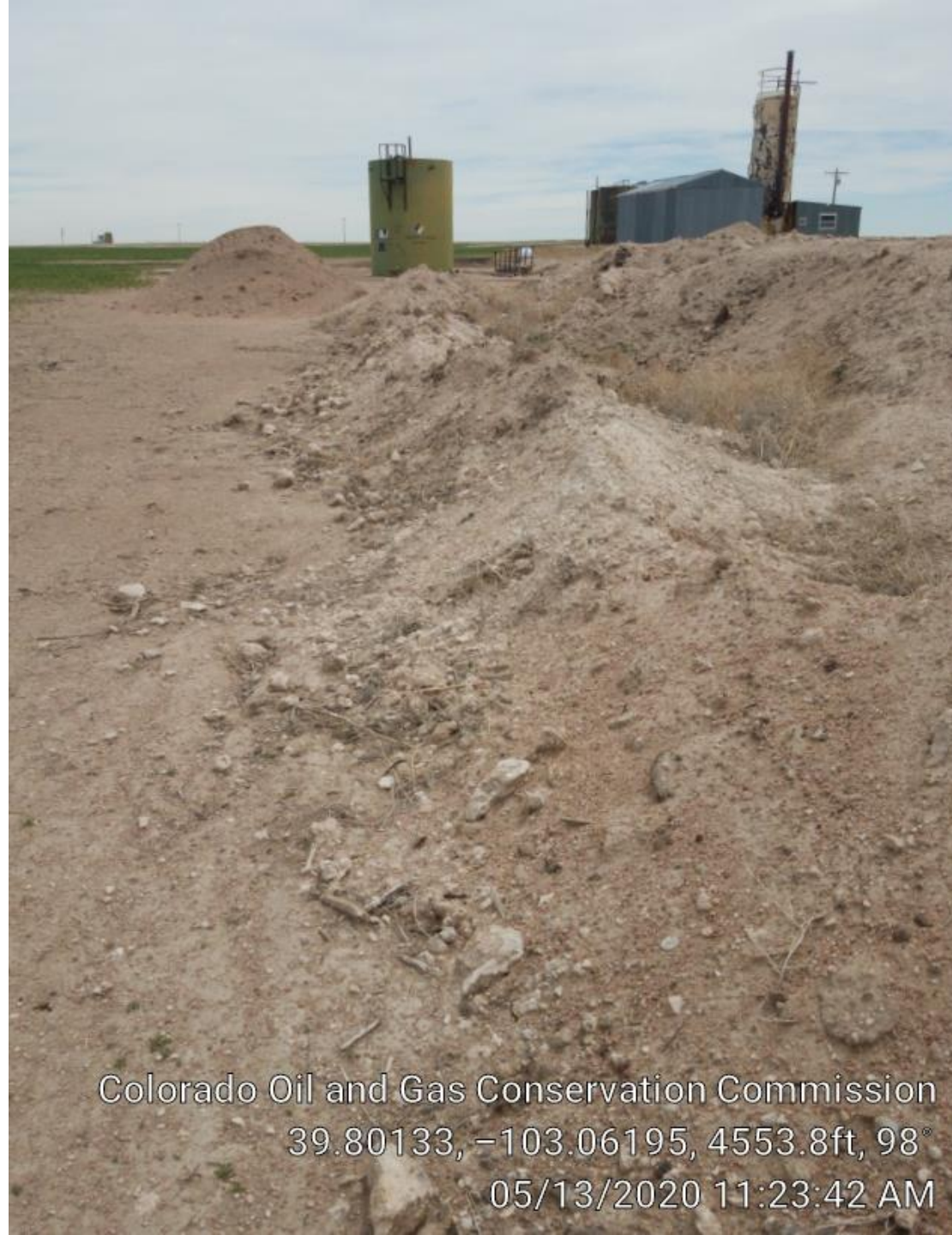
Waste piles on north side of pit.

Colorado Oil and Gas Conservation Commission 39.80133, -103.06195, 4553.8ft, 98° 05/13/2020 11:23:42 AM