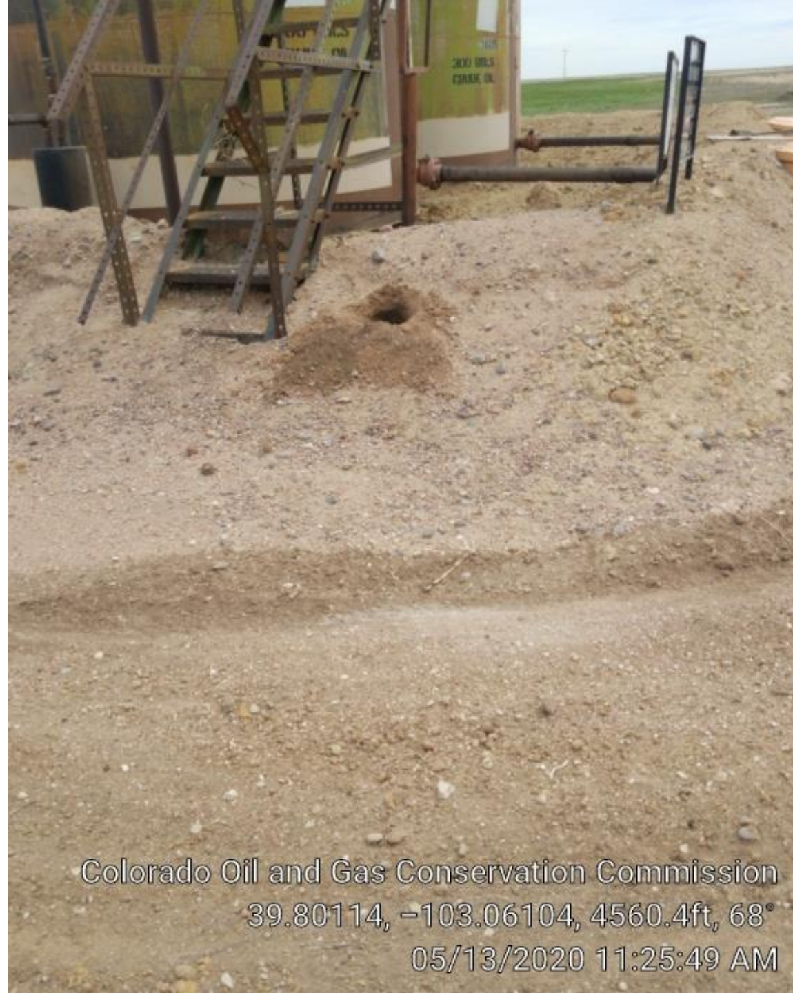
Animal hole in tank berm.

Colorado Oil and Gas Conservation Commission 39.80114, -103.06104, 4560.4ft, 68° 05/13/2020 11:25:49 AM