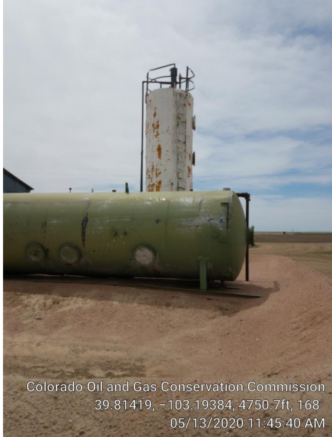
Colorado Oil and Gas Conservation Commission 39.81419, -103.19384, 4750.7ft, 168° 05/13/2020 11:45:40 AM