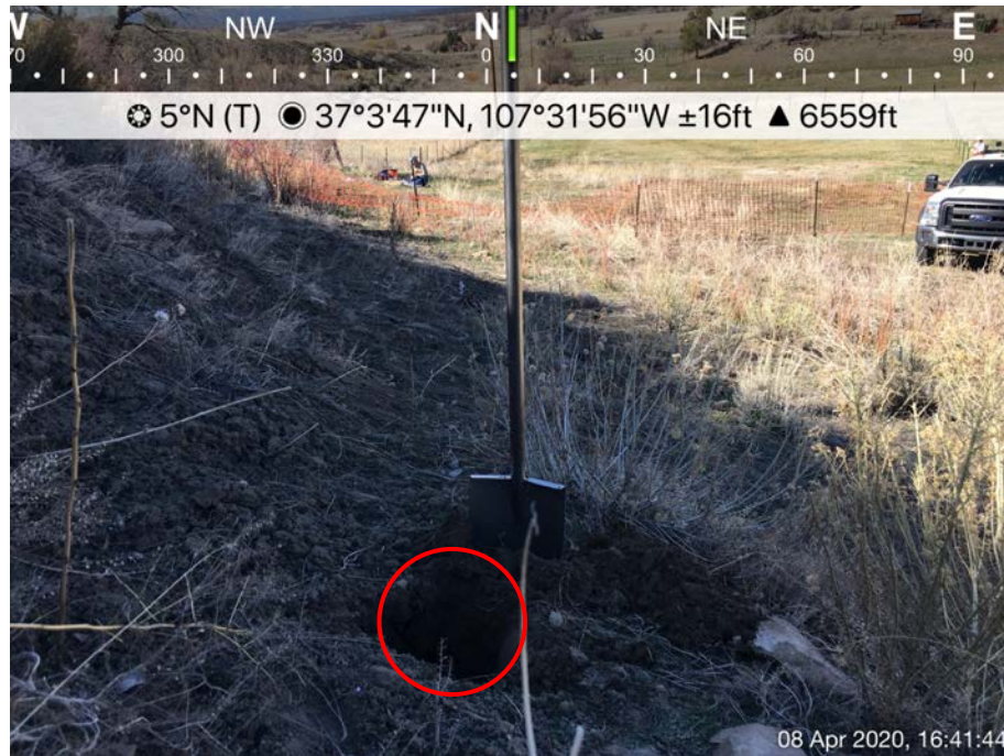
Photo 7: SS04 collected as a background sample from hillside adjacent to and upgradient of the point of release, 4/8/2020.