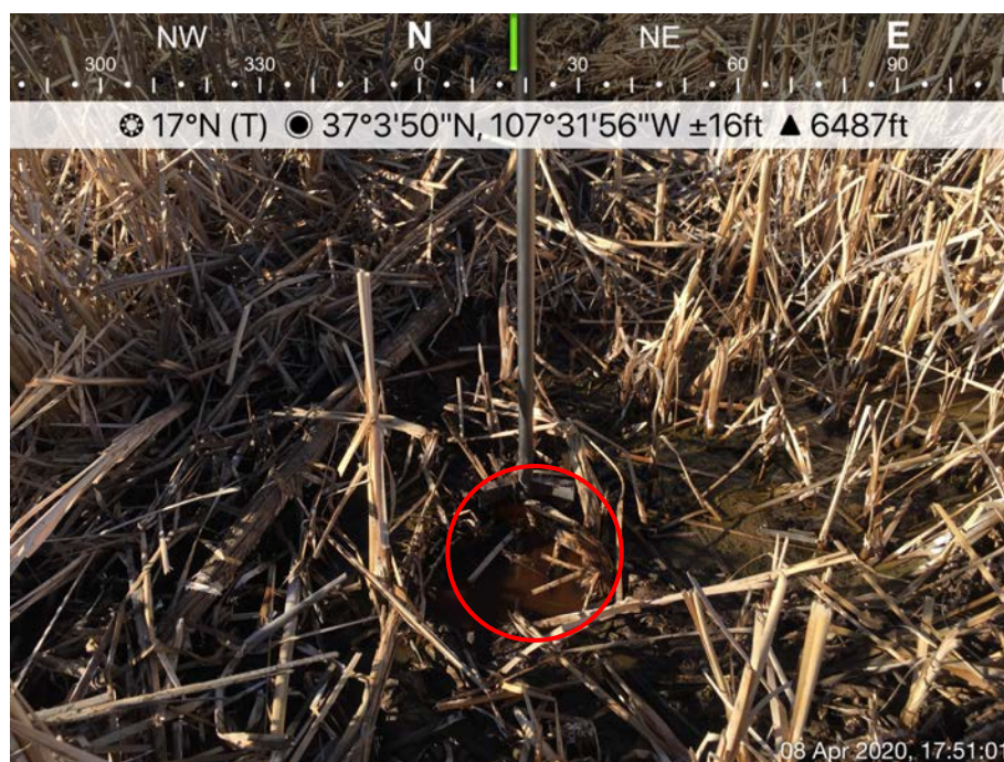
Photo 6: SS03 collected from wet area in wetland, adjacent to WS02, 4/8/2020.