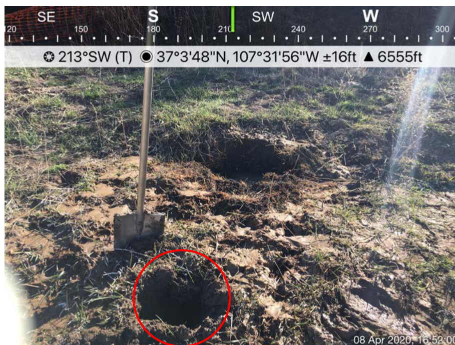
Photo 4: SS01 collected from area adjacent to the point of release, 4/8/2020.