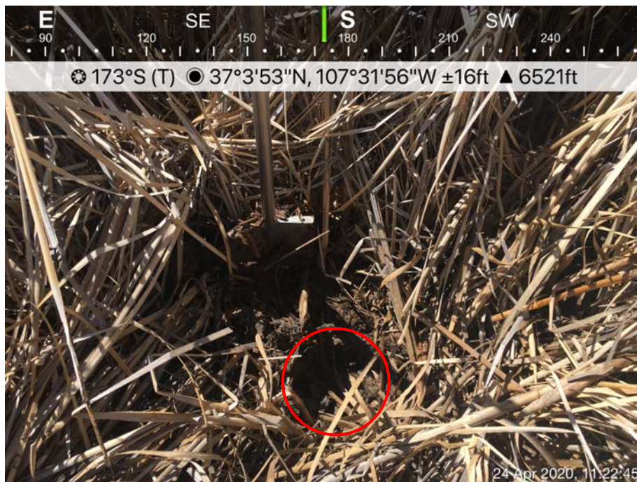
Photo 12: SS06 collected as a potential point of compliance sample downgradient of wet area in wetland, adjacent to WS03, 4/24/2020.