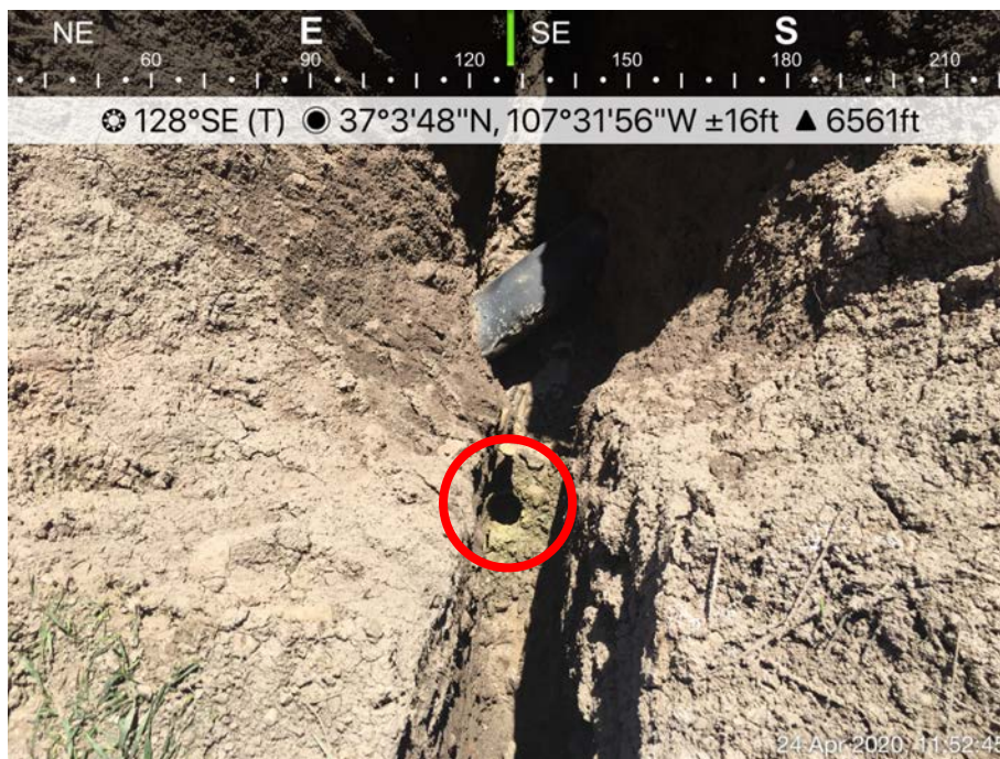
Photo 13: SS07 collected near the point of release at the base of the bell hole excavation, 4/24/2020.