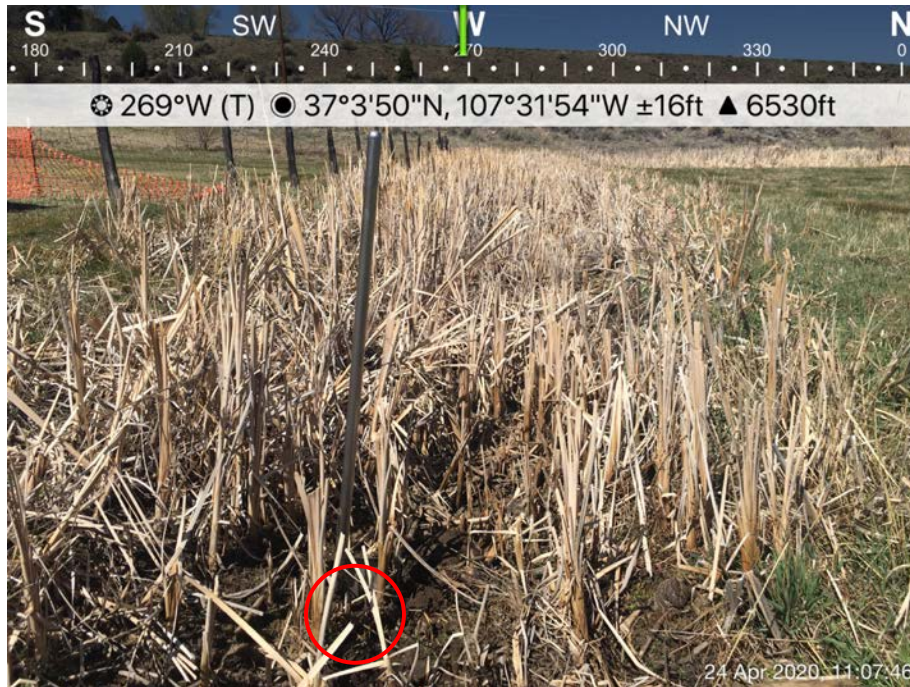
Photo 11: SS05 collected upgradient of the release area in wetland, 4/24/2020.