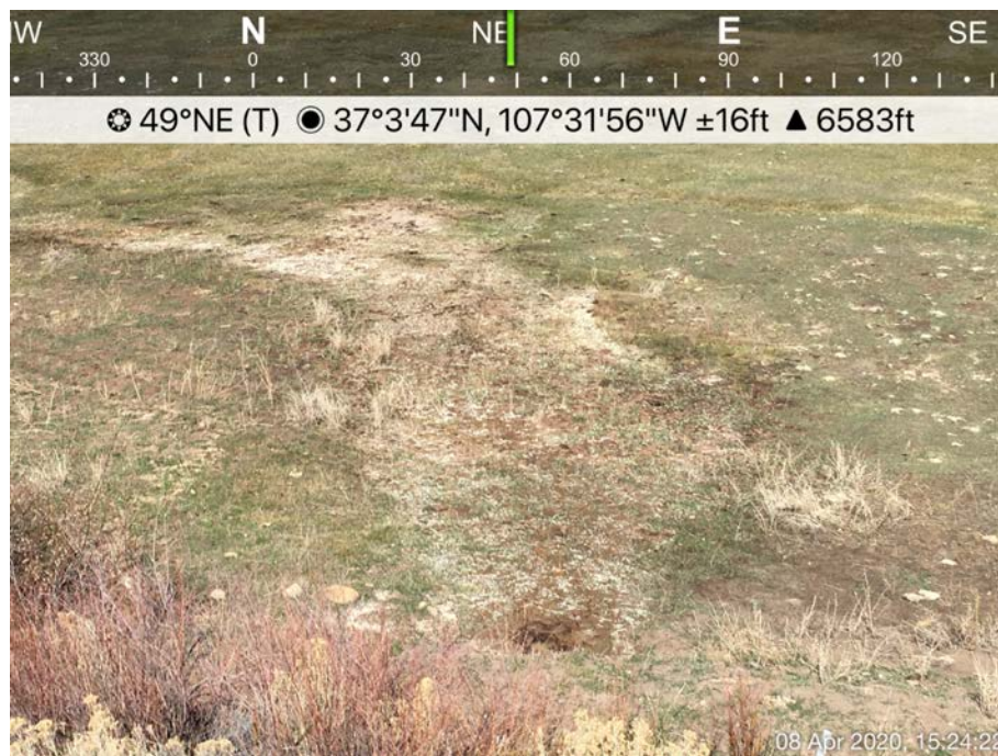
Photo 3: White residue on vegetation within wet area in field, 4/8/2020.