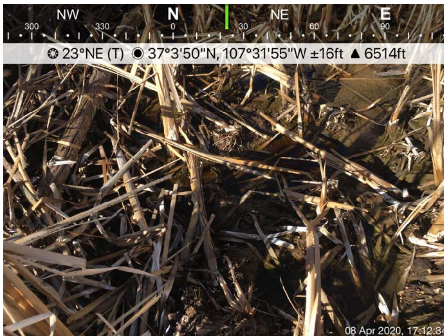
Photo 9: WS02 collected from the wet area in wetland, adjacent to SS03, 4/8/2020.