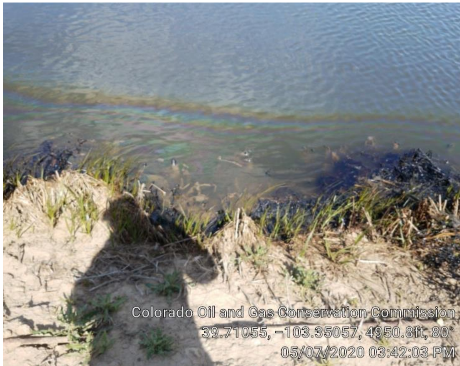
Pit after vac truck.

Colorado Oil and Gas Conservation Commission 39.71055, -103.35057, 4950.8ft, 80° 05/07/2020 03:42:03 PM