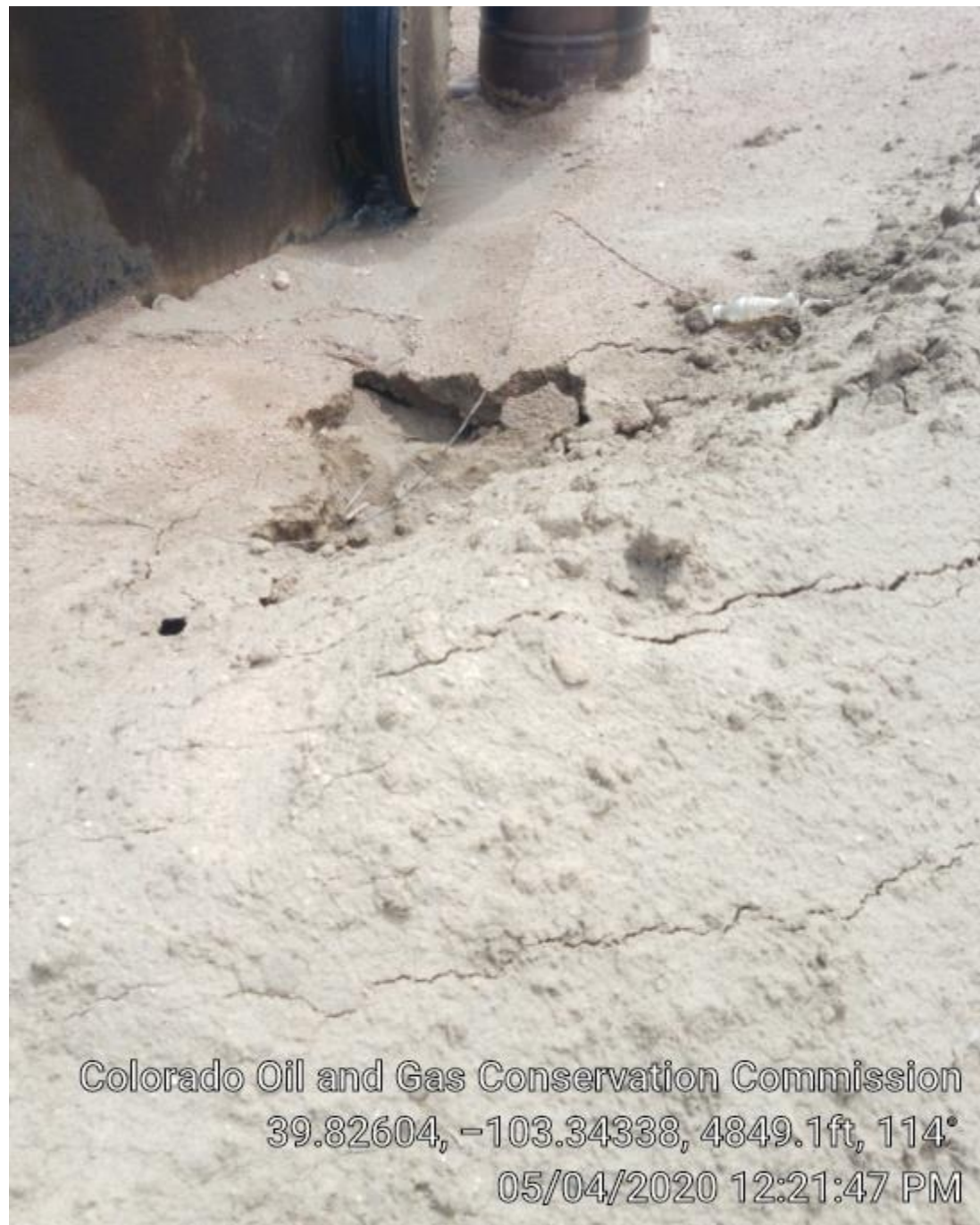
Subsidence at produced water tanks.

Colorado Oil and Gas Conservation Commission 39.82604, -103.34338, 4849.1ft, 114° 05/04/2020 12:21:47 PM