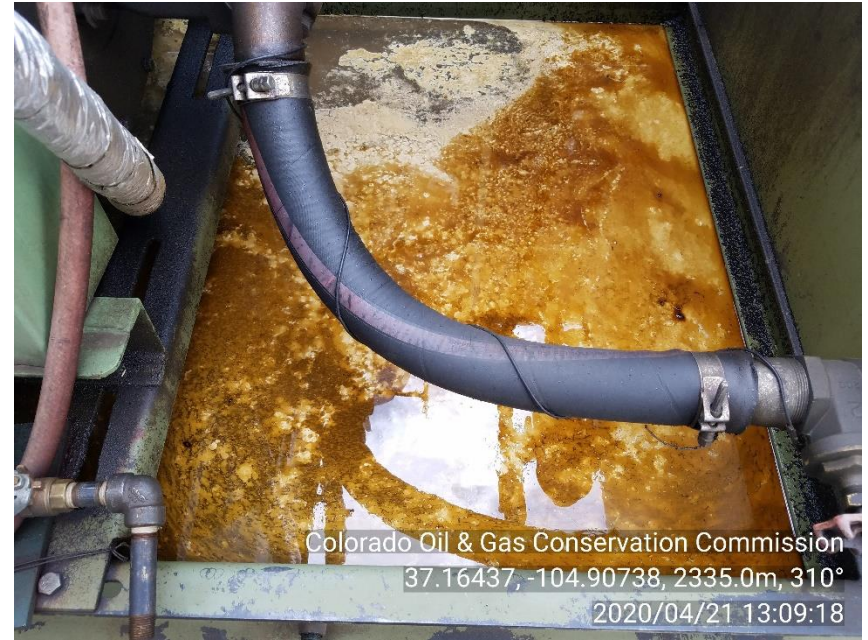
PHOTO 4: STANDING OILY WATER IN ENGINE SKID. Comply with general provisions of the oil and gas act for wildlife protection. CA DATE 5-21-20.