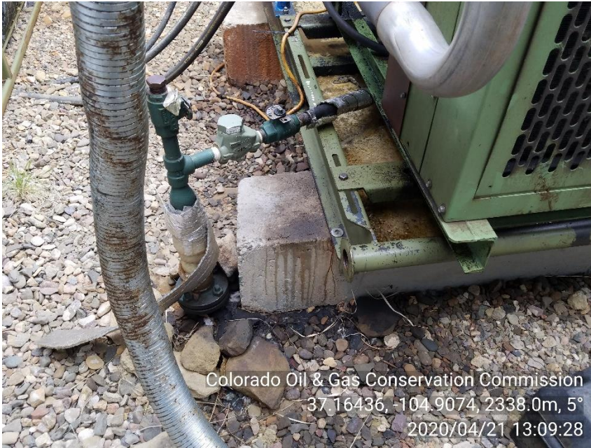
PHOTO 3: AREA OF IMPACTIED SOIL AROUND ENGINE SKID. Conduct maintenance on equipment, cleanup stained material and review self inspection processes. CA DATE 5-21-20.