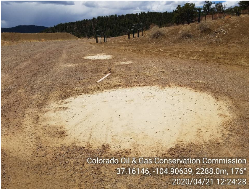
PHOTO 9: APPEARS TO BE TWO PILES OF FRAC SAND ON LOCATION. Immediately comply with material handling and guidance per MSDS or product data sheet. Submit document, procedures, and waste disposal manifest to COGCC field inspector. CA DATE 5-1-20