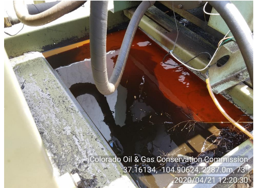
PHOTO 4: STANDING OIL IN ENGINE SKID (APPEARS THAT ENGINE OIL IS BEING DRAINED INTO ENGINE SKID). Comply with general provisions of the oil and gas act for wildlife protection. CA DATE 5-21-20.