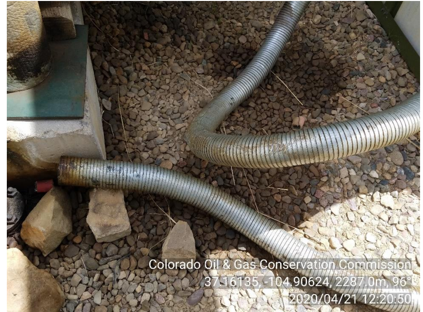
PHOTO 8: UNUSED EQUIPMENT STORED ON LOCATION. COMPLY WITH RULE 603.f. CA DATE 5-6-20