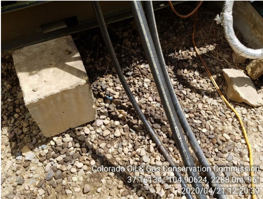
PHOTO 5: AREA OF IMPACTED SOIL NEAR ENGINE SKID. Conduct maintenance on equipment, cleanup stained material and review self inspection processes. CA DATE 4-26-20.