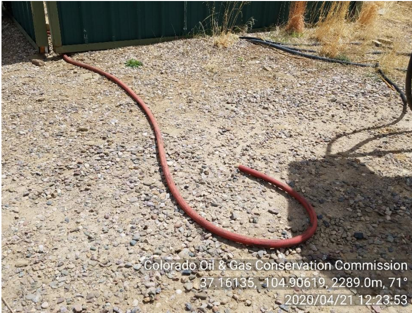
PHOTO 7: UNUSED EQUIPMENT STORED ON LOCATION. COMPLY WITH RULE 603.f. CA DATE 5-6-20