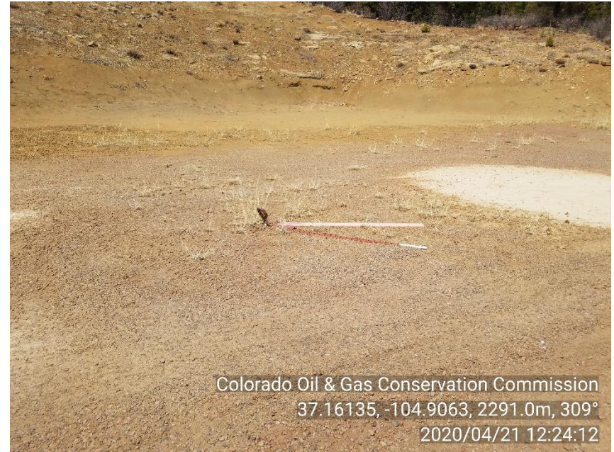
PHOTO 10: GUY LINE ACHOR MARKER IS DOWN. Install proper guy line markers per Rule 1003.a CA DATE 5-5-20

PHOTO 9: APPEARS TO BE TWO PILES OF FRAC SAND ON LOCATION. Immediately comply with material handling and guidance per MSDS or product data sheet. Submit document, procedures, and waste disposal manifest to COGCC field inspector. CA DATE 5-1-20