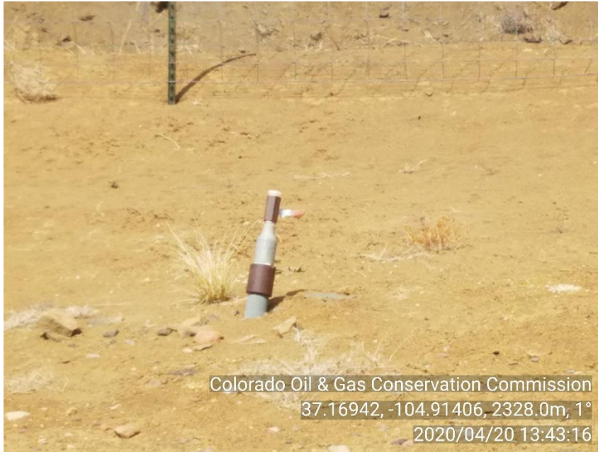
PHOTO 5: UNUSED RISER NEAR V WELL. COMPLY WITH RULE 603.f. CA DATE 5-20-20.