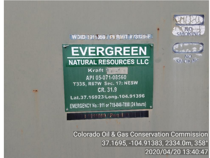
PHOTO 2: WELL SIGN/ WELL NUMBERS ON BOTH WELL SIGN ARE NOT LEGIBLE. COMPLY WITH RULE 210.b. CA DATE 7-20-20.