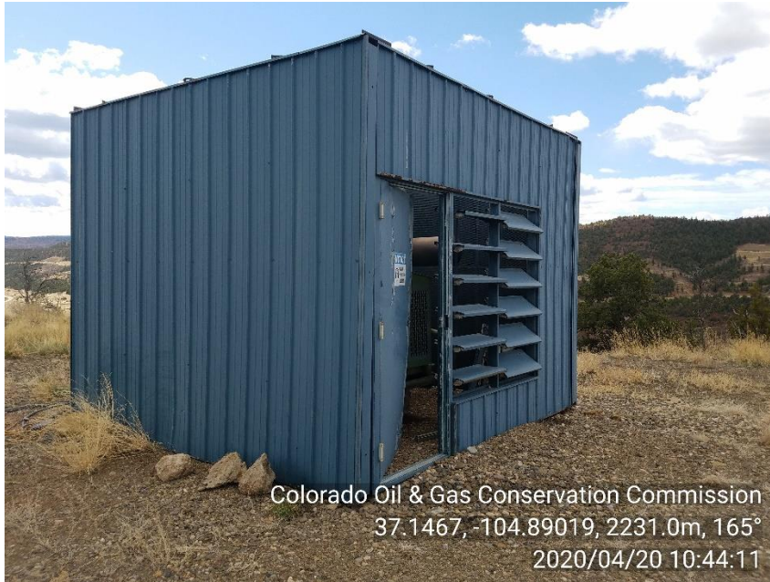
PHOTO 5: UNUSED EQUIPMENT STORED ON LOCATION (SOUND WALLS AND ALL EQUIPMENT INSIDE SOUND WALLS). COMPLY WITH RULE 603.f. (REMOVE UNUSED EQUIPMENT) CA DATE 5-20-20