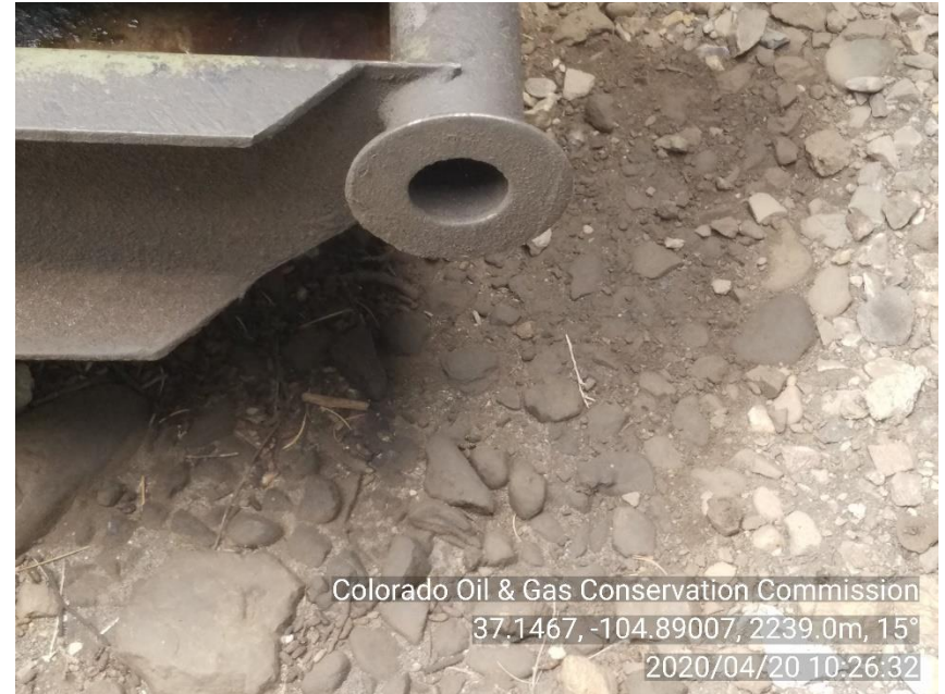
PHOTO 6: AREA OF IMPACTED SOIL NEAR ENGINE SKID INSIDE SOUND WALLS ON GE 28-07X WELL. Conduct maintenance on equipment, cleanup stained material and review self inspection processes. THIS IS SECOND NOTICE TO REMOVE IMPACTED SOIL IMMEDIATELY