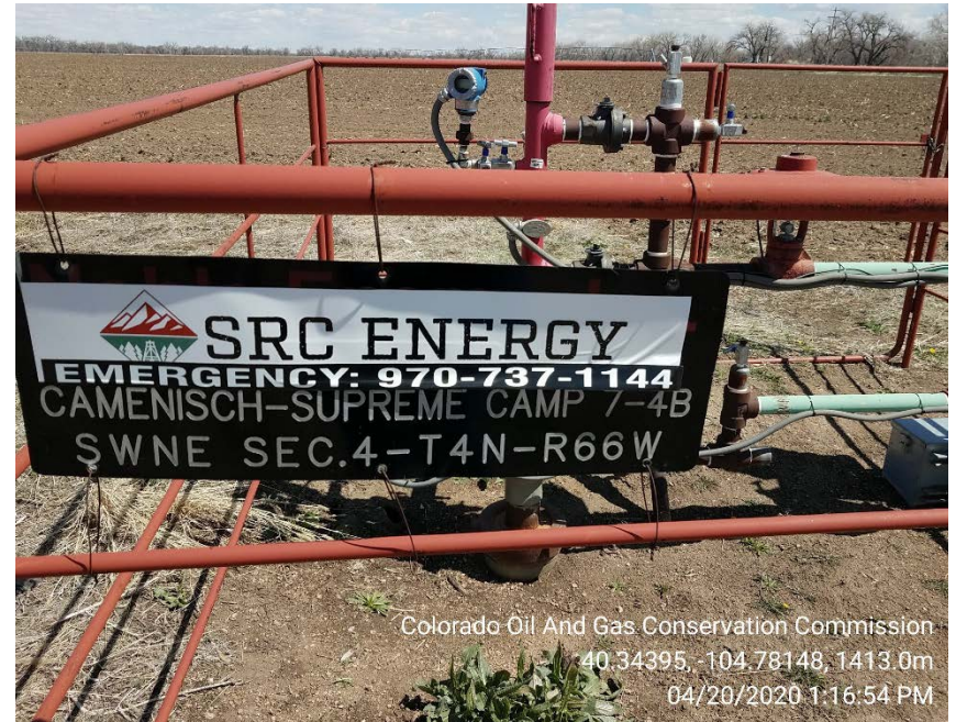
Wellhead sign and emergency contact number