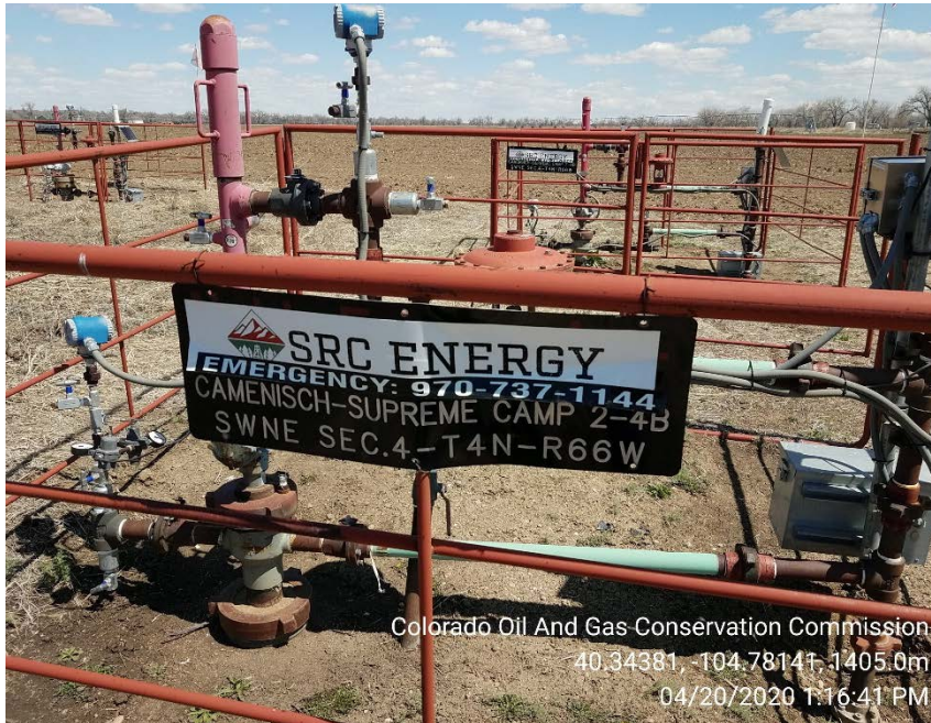
Wellhead sign and emergency contact number