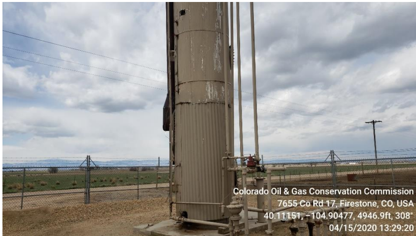
Photo 5 Vertical heated separator