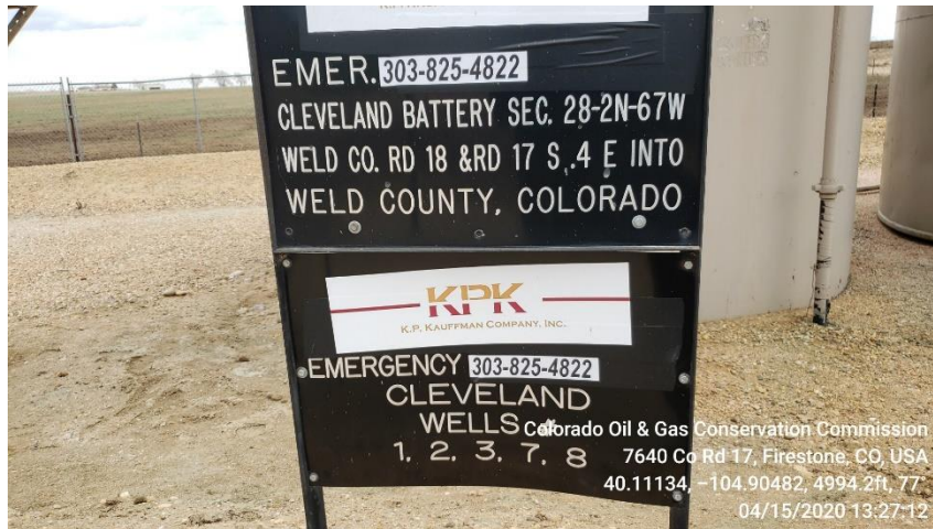
Photo 3 TB sign