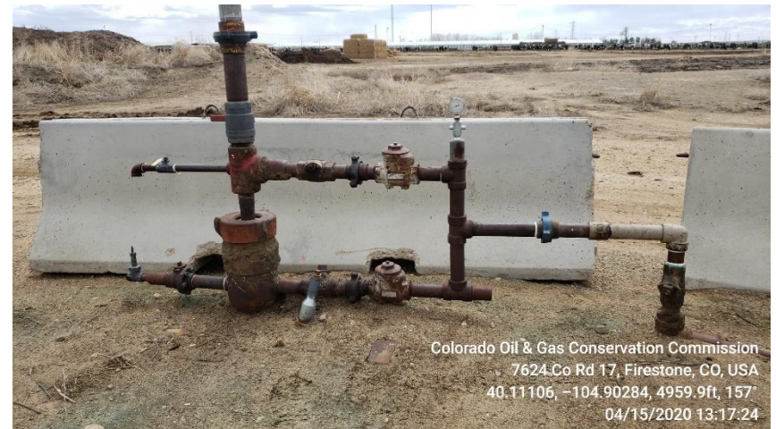
Photo 2 WH