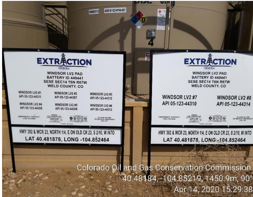
Colorado Oil and Gas Conservation Commission 40.48184, -104.85219, 1450.9m, 90° Apr 14, 2020 15:29:38