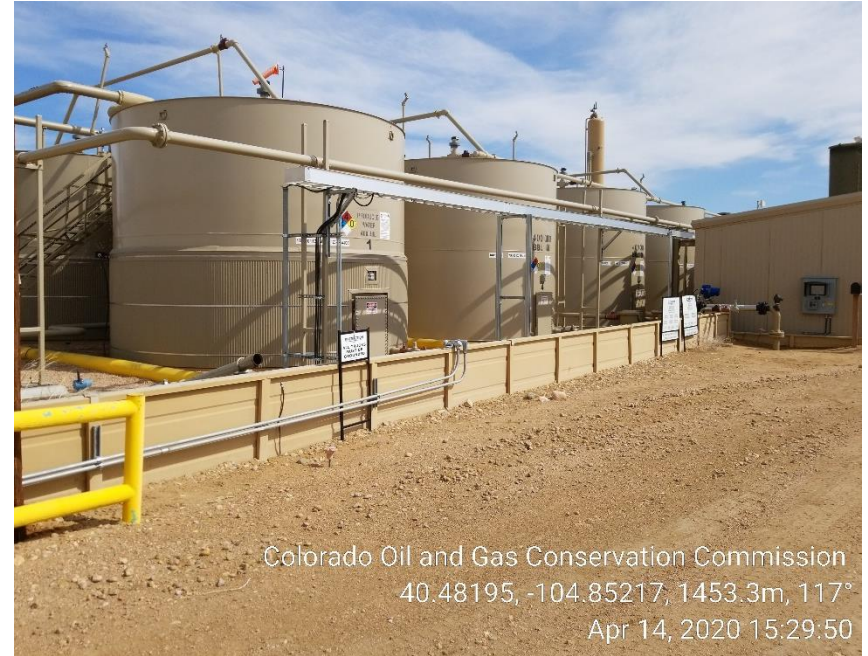
Colorado Oil and Gas Conservation Commission 40.48195, -104.85217, 1453.3m, 117° Apr 14, 2020 15:29:50