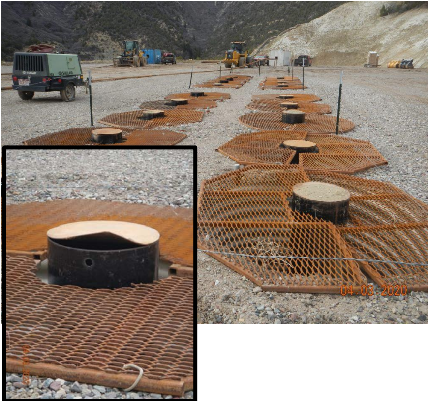
Photo#3: Cellar line up; metal cover plate on one conductor pried up/open.