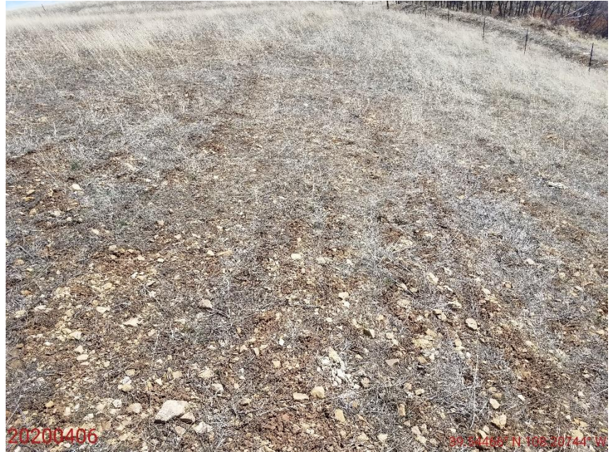
Photo 6: Photo taken from the slopes on the southern portion of the Location, facing east. See comments under photo 5.