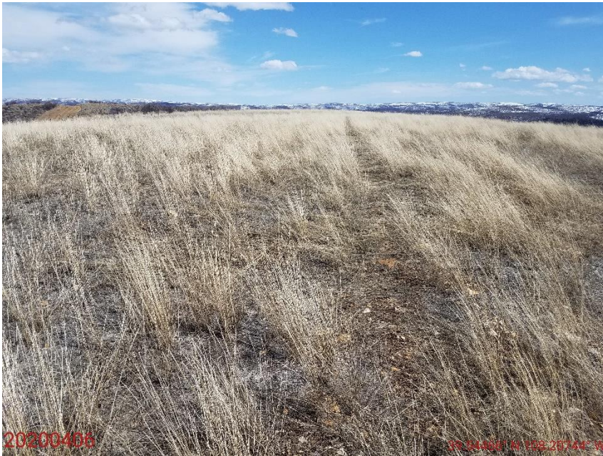
Photo 1: Photo taken from the northwestern areas of the Location, facing north. Photos 1-4 provide an overview of the Location facing north, east, south and west. Photos show vegetative establishment on the upland portions of the Location appears to be progressing towards reclamation requirements. However, vegetation on adjacent reference areas are predominantly sage brush and scrub oak; little shrub germination/establishment was observed.