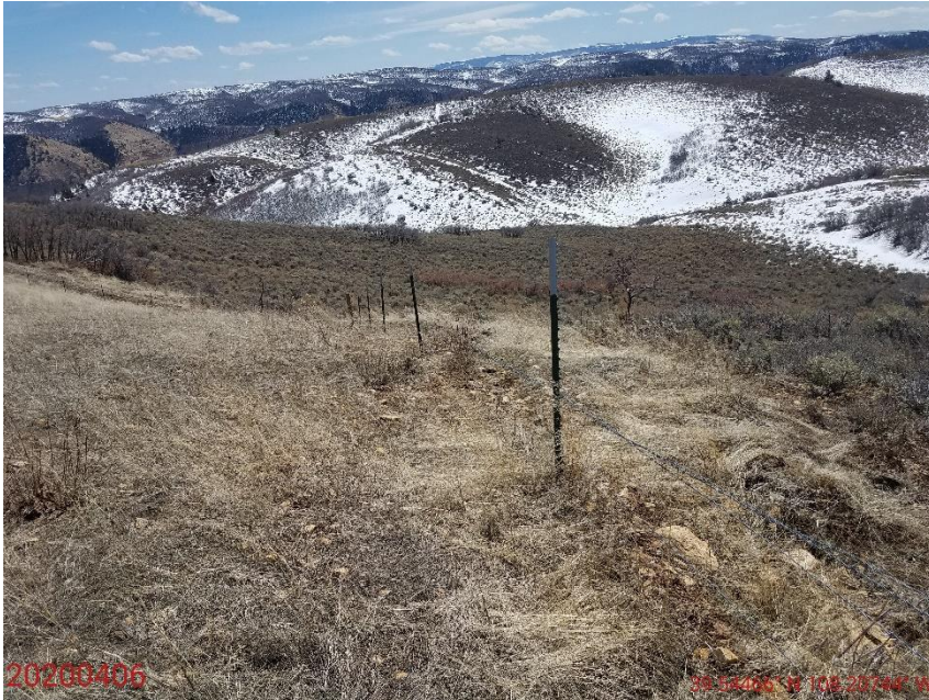
Photo 7: Photo taken from the fence on the south end of the Location. Photo shows fence is in disrepair.