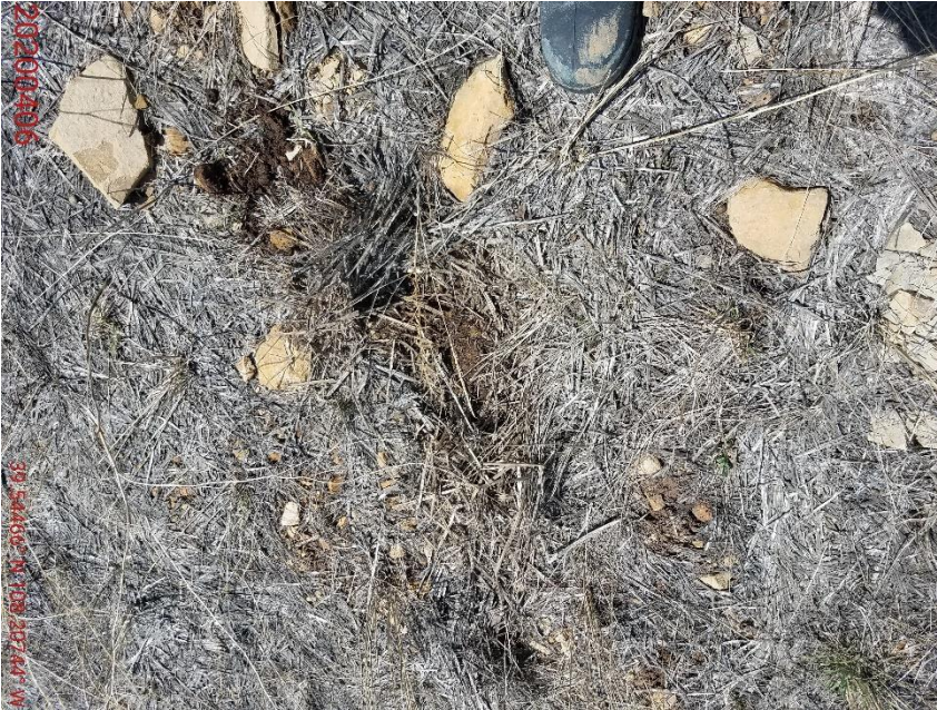
Photo 5: Photo taken from the slopes on the southern portion of the Location. Vegetation establishment is not as uniform as observed on the northern areas. Photo shows straw mulch appears to have been over-applied and may be hindering reclamation.