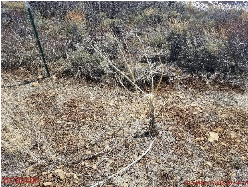
Photo 9: Photo taken from the west end of the Location; Photo shows noxious weeds ( Verbascum Thapsus , Carduus nutans ) are evident on the Location.