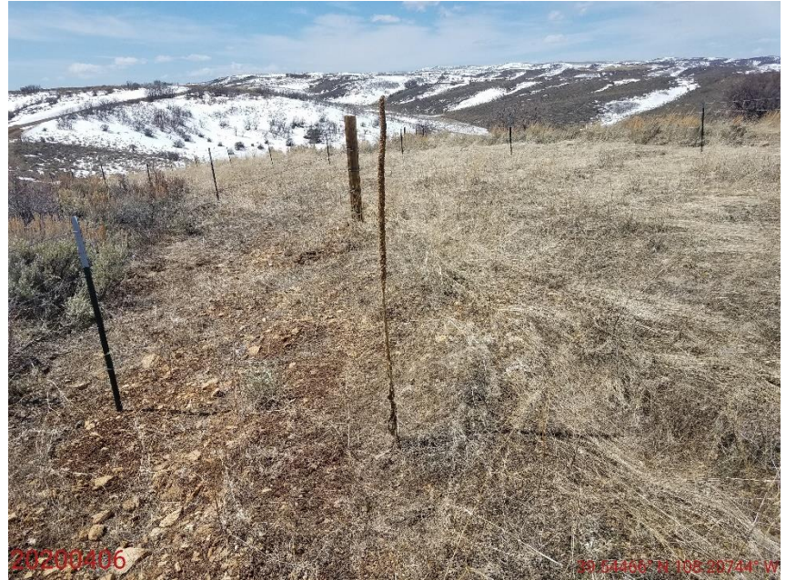
Photo 8: Photo taken from the west end of the Location; Photo shows noxious weeds ( Verbascum Thapsus , Carduus nutans ) are evident on the Location.