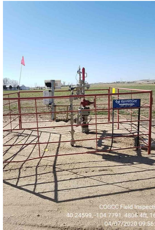
Photo 2 05-123-30832 HUNT 33-4