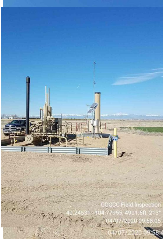
Photo 4 Production Equipment