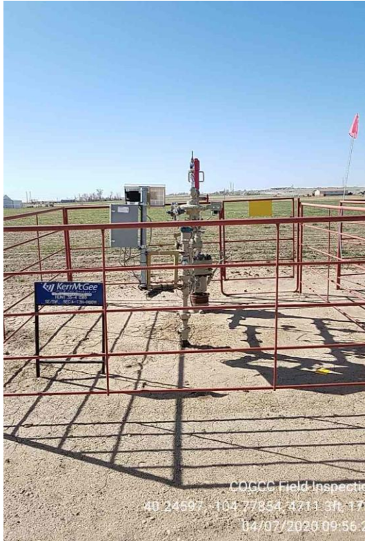
Photo 1 05-123-30838 HUNT 35-4