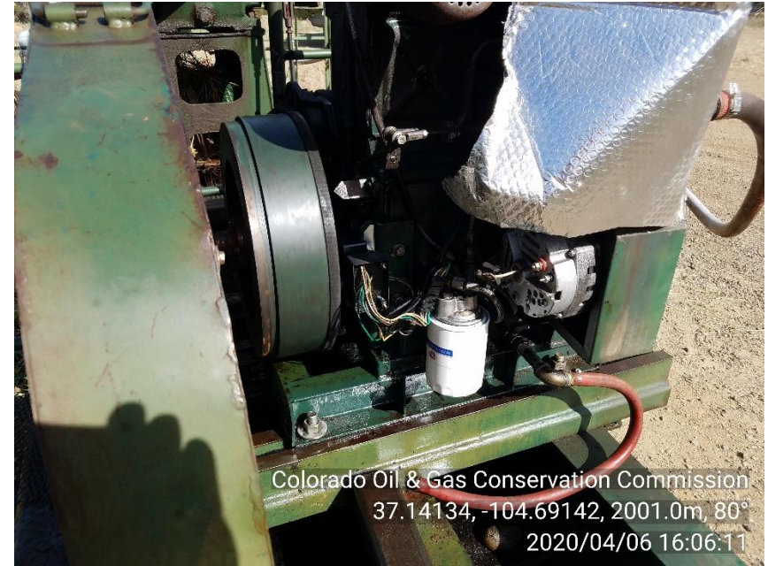
PHOTO 8: PUMPJACK PRIME MOVER IS SATURATED WITH WHAT APPEARS TO BE OIL. Securely fasten all valves, pipes, and fittings to ensure good mechanical condition, inspect at regular intervals and maintain in good mechanical condition per Rule 605.d. CA DATE 5-6-20