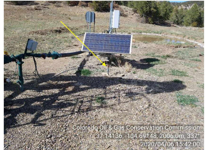
PHOTO 4: UNUSED 1" RISER NOT LO/TO. 24 HOURS TO LO/TO 30 DAYS TO REMOVE RISER PER RULE 603.f. CA DATE 4-7-20.