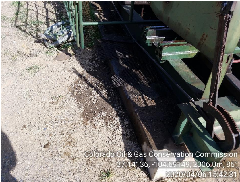
PHOTO 7: AREA OF IMPACTED SOIL NEAR PUMPJACK PRIME MOVER ON THE OPPOSITE SIDE FROM PREVIOUS PHOTOS APPEARS TO BE COMING FROM OIL PUMPJACK PRIME MOVER LEAKS. Conduct maintenance on equipment, cleanup stained material and review self inspection processes. PER RULE 1002.f.(2).D CA DATE 5-6-20.