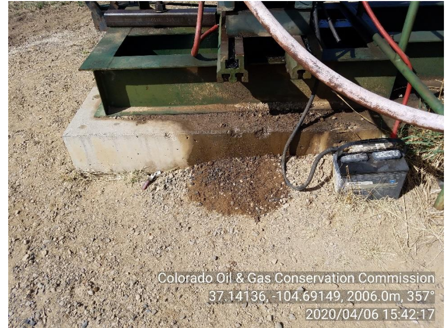
PHOTO 6: AREA OF IMPACTED SOIL NEAR PUMPJACK PRIME MOVER APPEARS TO BE COMING FROM OIL PUMPJACK PRIME MOVER LEAKS. Conduct maintenance on equipment, cleanup stained material and review self inspection processes. PER RULE 1002.f.(2).D CA DATE 5-6-20.