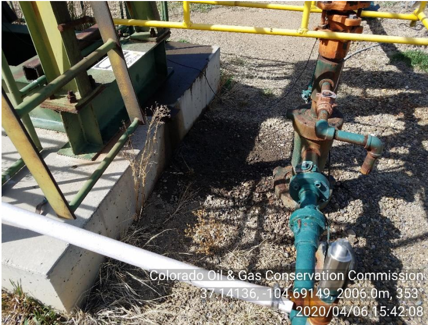
PHOTO 5: AREA OF IMPACTED SOIL NEAR WELLHEAD APPEARS TO BE COMING FROM OIL RUNNING OFF PUMPJACK BASE. Conduct maintenance on equipment, cleanup stained material and review self inspection processes. PER RULE 1002.f.(2).D CA DATE 5-6-20.