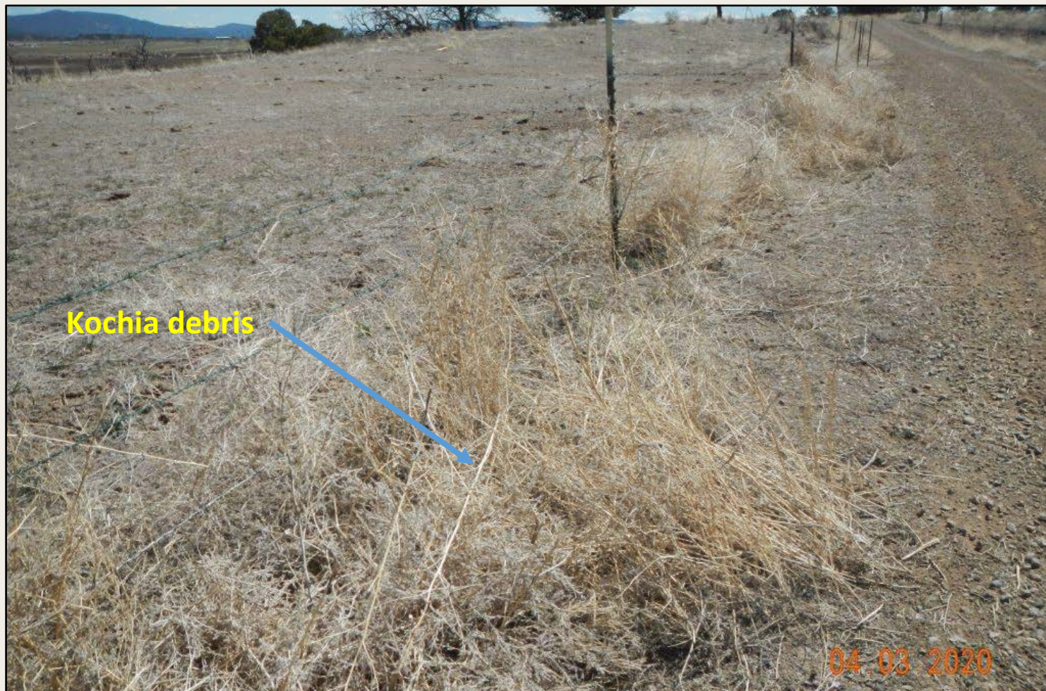
Photo 3. View of dense kochia weed debris along the access road.