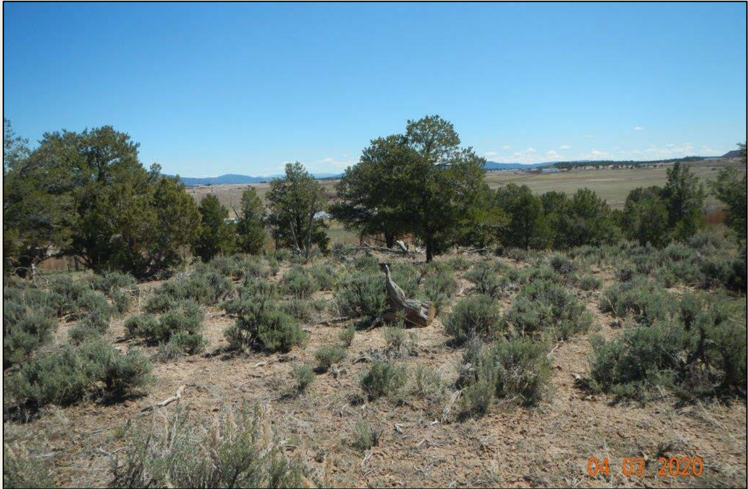
Photo 5. View of reference area vegetation comprised of sagebrush shrubland and pinyon juniper woodland.