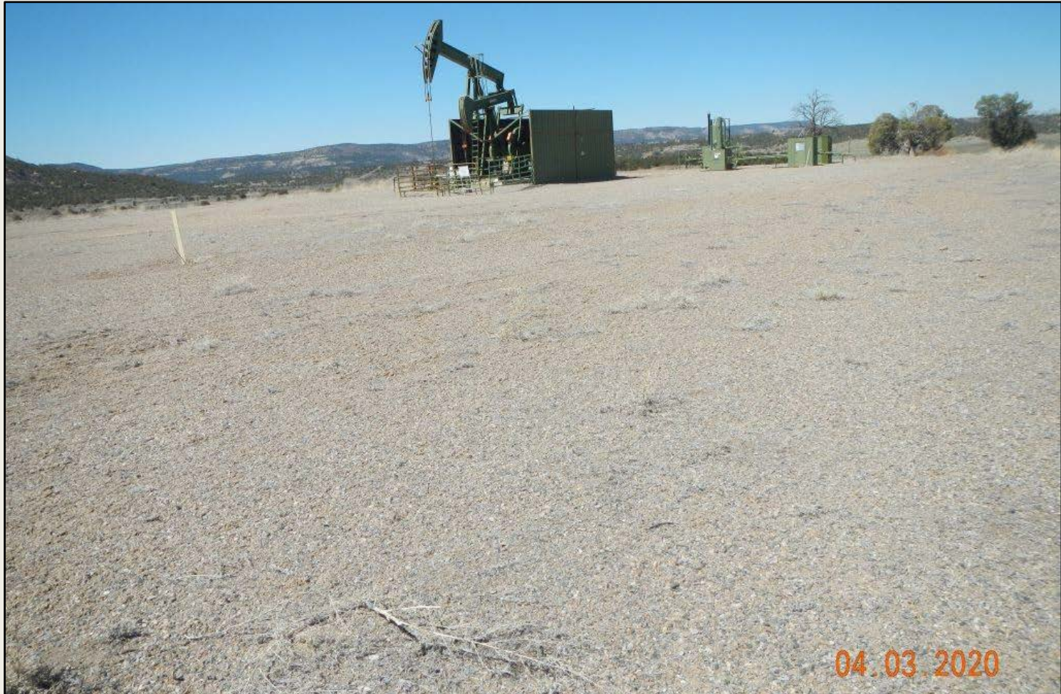
Photo 1. View of the project area from the southeastern corner facing center.