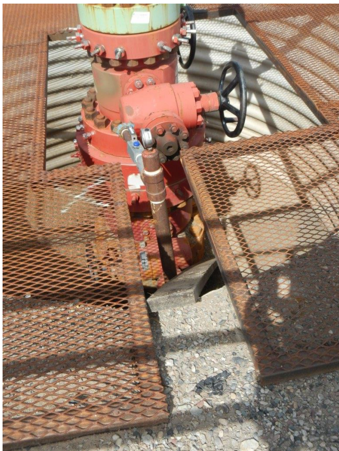
Photo#4: Wildlife Escape Boards in Well cellars are not in position to allow means of Wildlife egress.