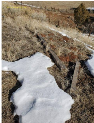
Photo of first corrective action completed

Completed work description Corrective Action 1