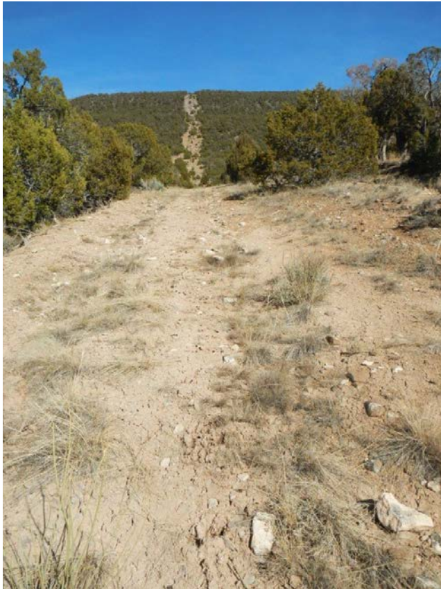
Photo#7: View up main Access road to NE (which may also be pipeline right of way).