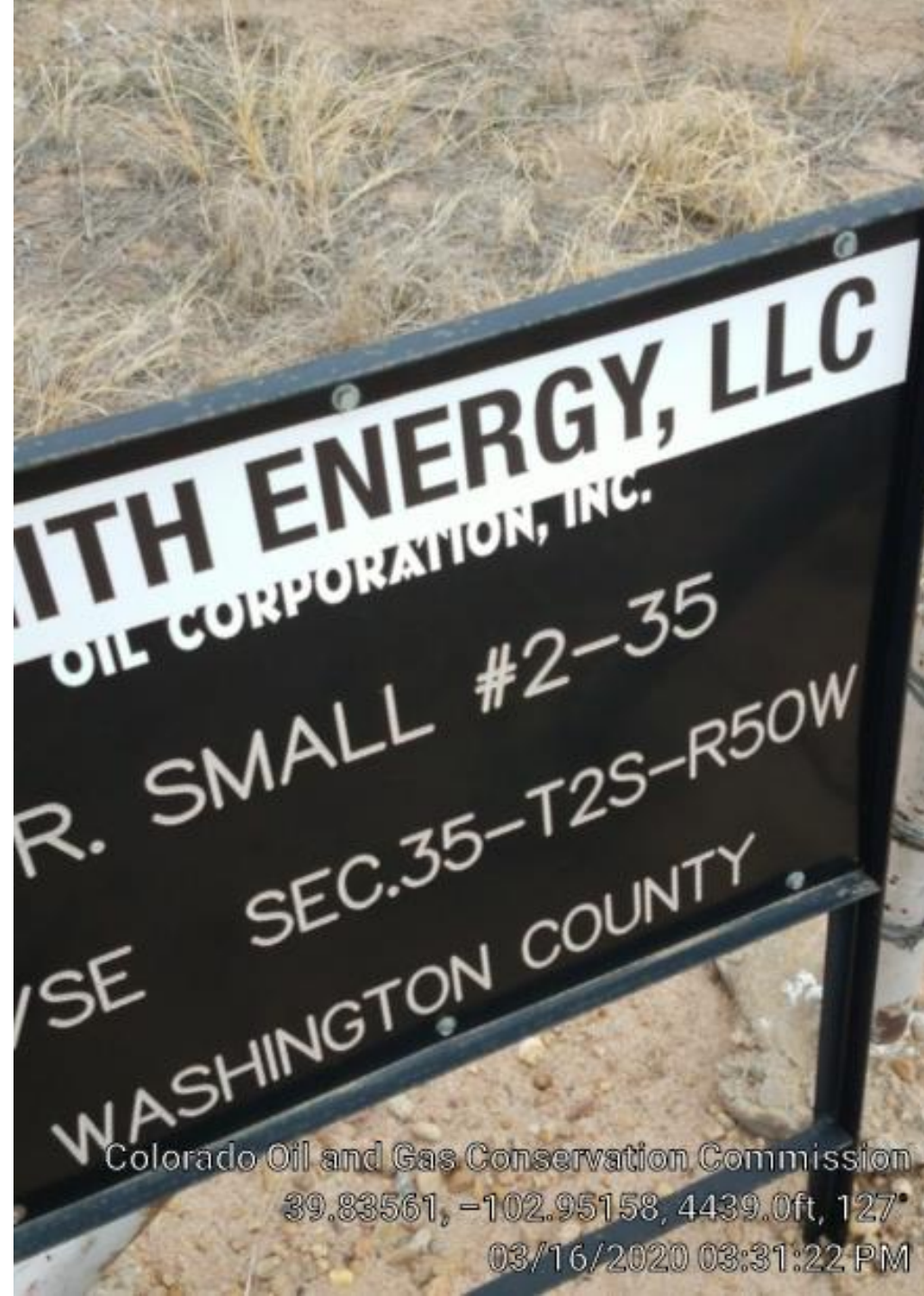
Meter shed sign.

Colorado Oil and Gas Conservation Commission 39.83561, -102.95158, 4439.0ft, 127° 03/16/2020 03:31:22 PM