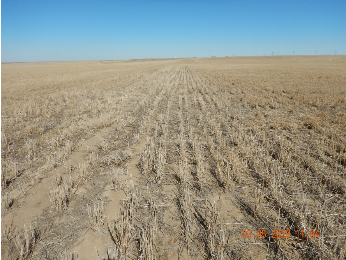
Photo 1. Photo taken from the southern well location access road, facing North. Photo illustrates the establishment of crops within the access road that appears reflective of reference crop areas.