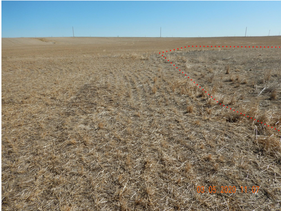
Photo 4. Photo taken from the northern well location, facing East. See comments under Photo 2.