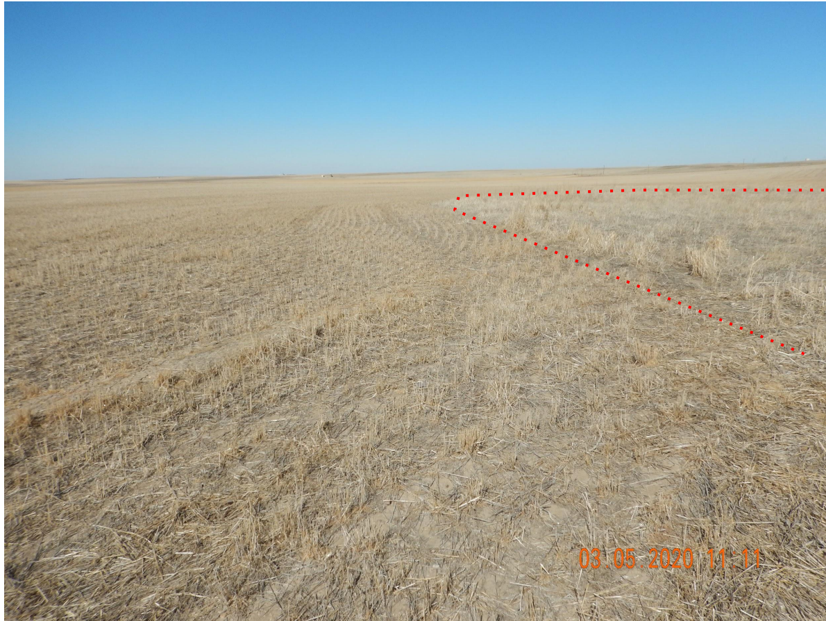
Photo 2. Photo taken from the southern well location, facing Northwest. Photo illustrates crop rows circling the well location indicating the well location was not seeded.