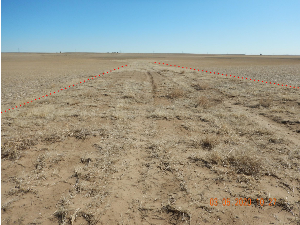
Photo 1. Photo taken from the western well location access road, facing East. Photo illustrates the access road has not been properly contoured to match the surrounding landscape. Refer to Photo #2 regarding contouring.

Also, it is unclear whether the access road/well location has been properly cross-ripped and whether it was seeded. Currently, there is no establishment of crop species observed throughout the access road and well location. Staff will have to make a future assessment during the active growing season to make a better assessment.