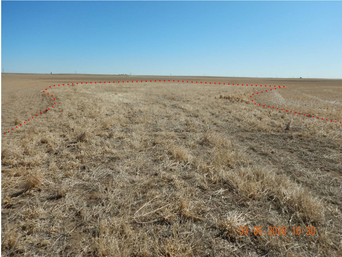
Photo 5. Photo taken from the western well location, facing East. See comments under Photo 1 and 4.