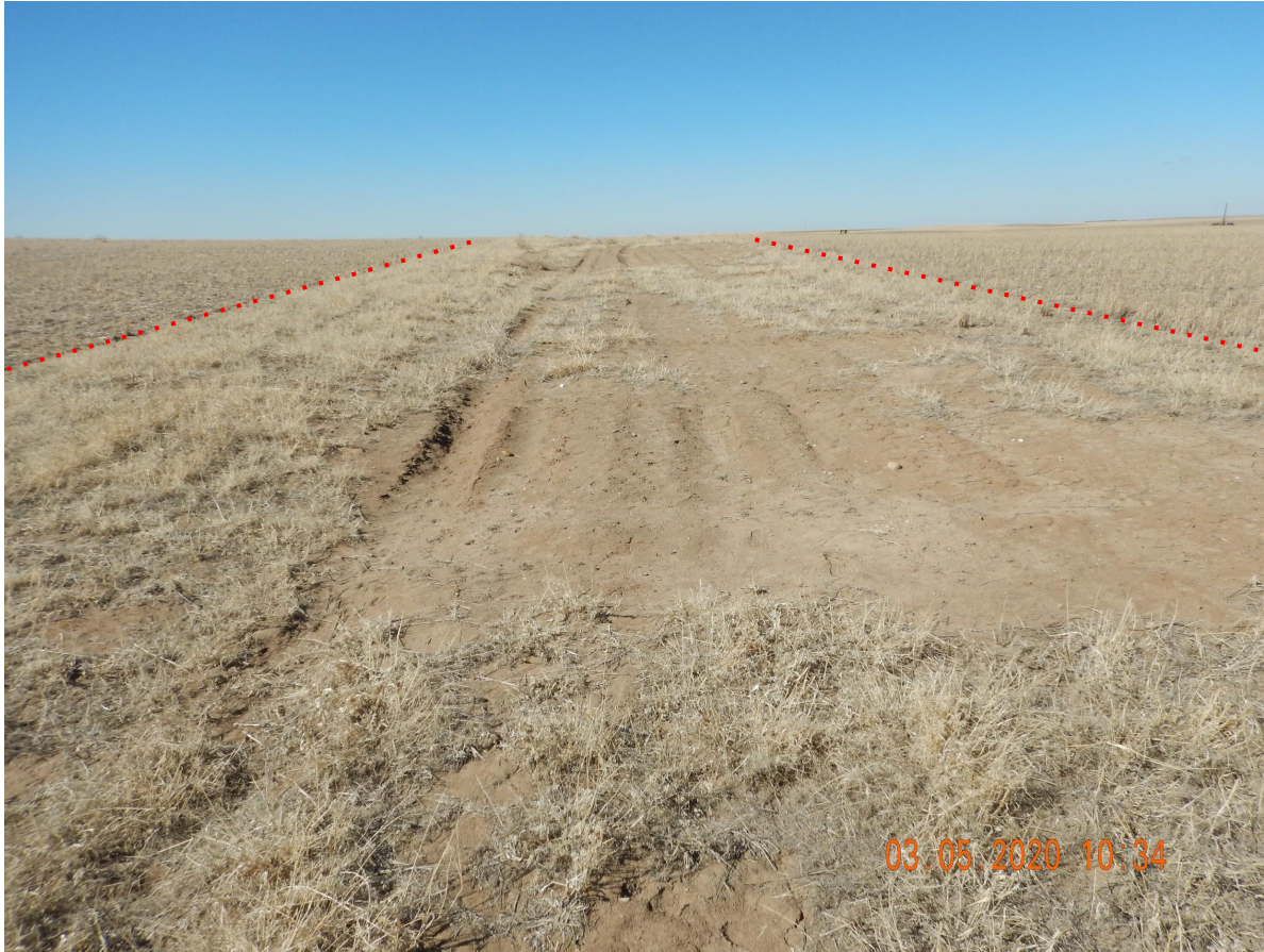
Photo 2. Photo taken from the central well location access road, facing West. Photo illustrates the access road has not been properly contoured. The access road is in the shape of a “v”.