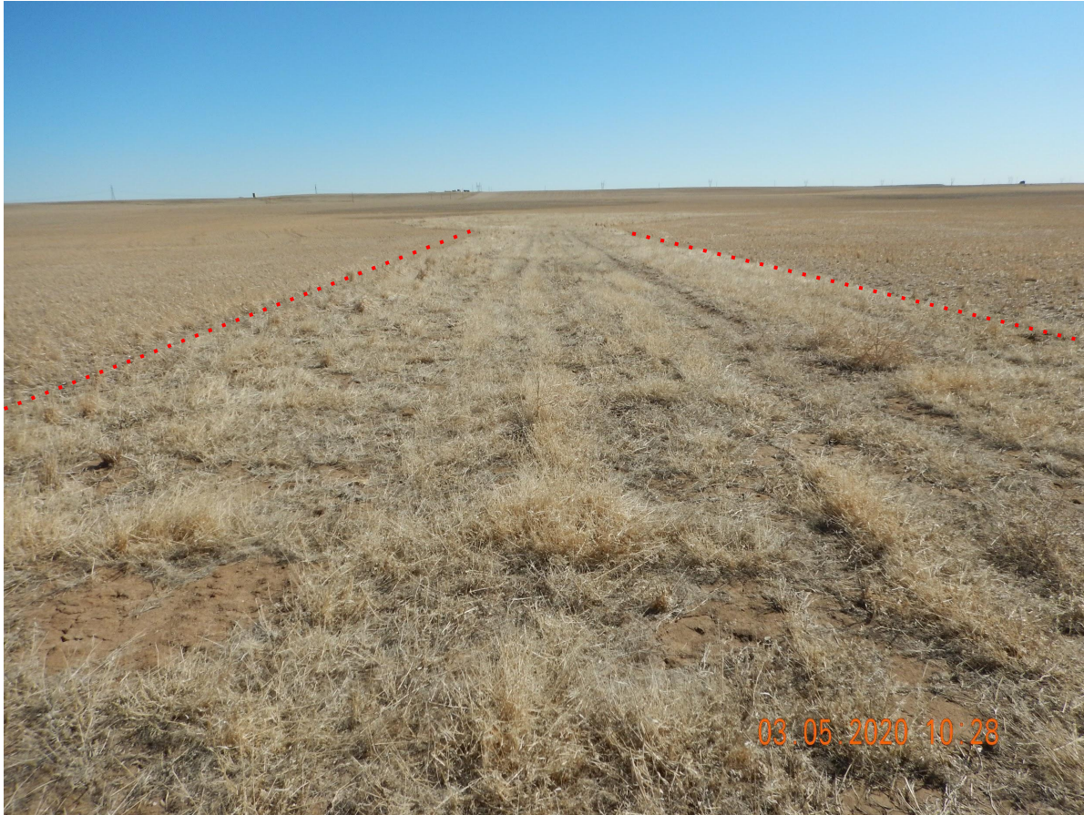
Photo 4. Photo taken from the eastern well location access road, facing East. Photo illustrates weedy, annual vegetation consisting of but not limited to: Eragrostis cilianensis (stinkgrass), Kochia and Russian thistle.