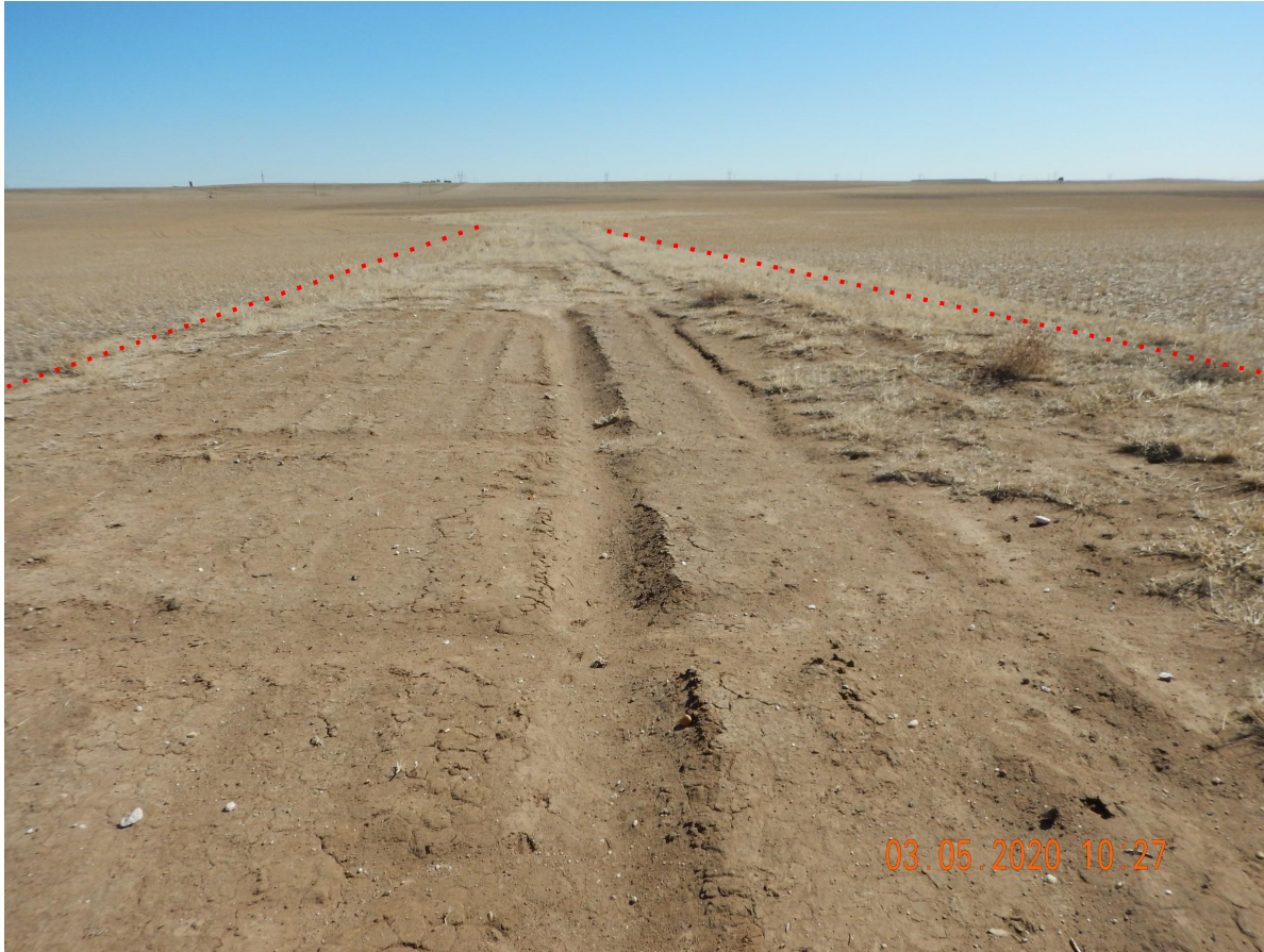
Photo 3. Photo taken from the central well location access road, facing East. See comments under Photo 1.