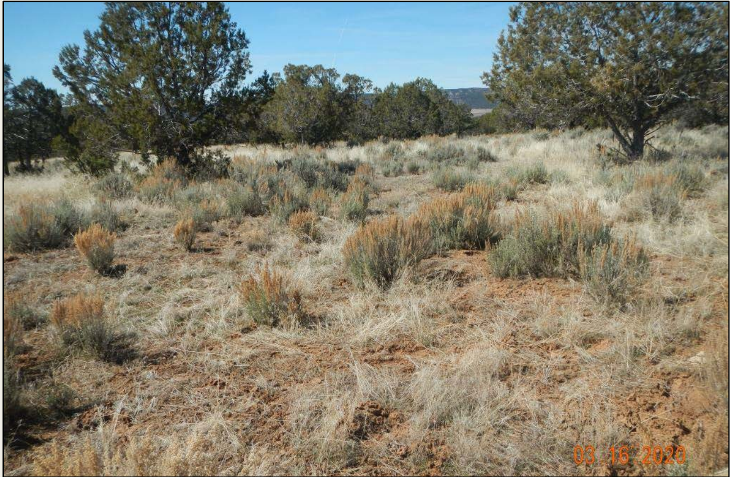
Photo 5. View of reference area vegetation, comprised of open pinyon-juniper woodland, with sagebrush and herbaceous understory.