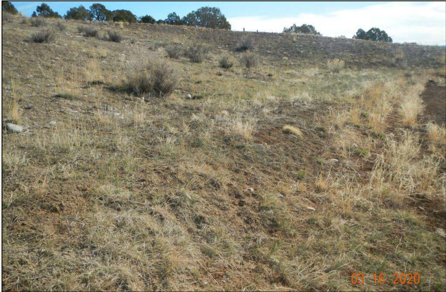
Photo 2. View of the northern project area from the southeastern corner facing northward. Revegetation is progressing with grasses and shrubs such as smooth brome and rubber rabbitbrush.