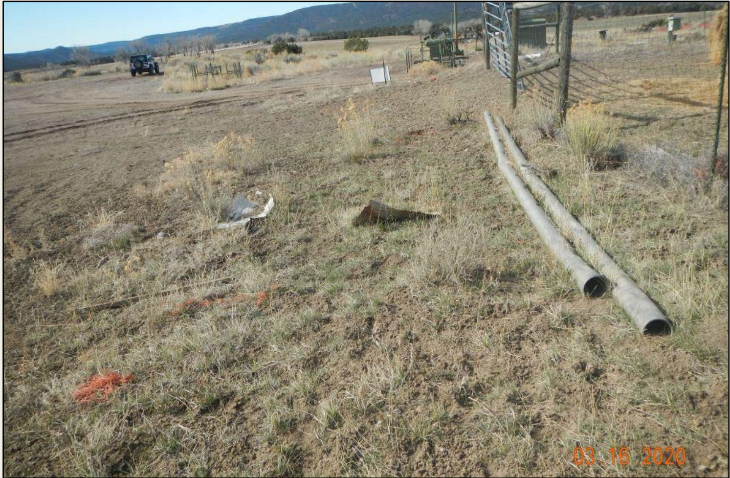
Photo 3. View of junk and debris within the northwestern project area.