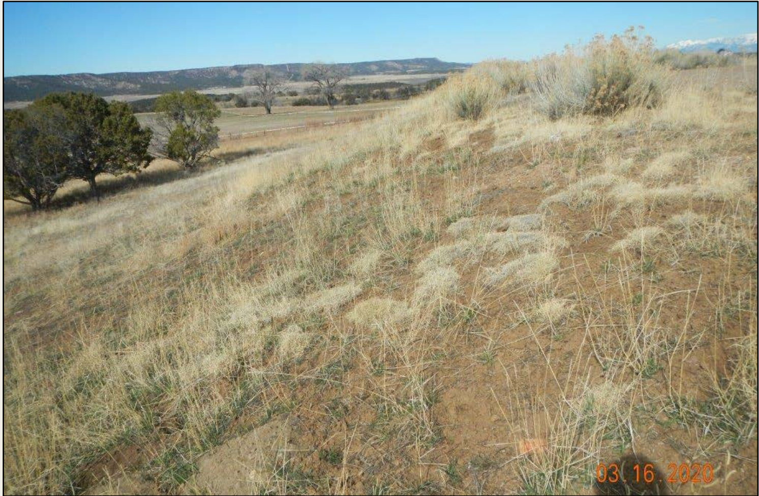
Photo 1. View of the southern project area from the southeastern corner facing westward. Revegetation is progressing with grasses such as blue grama, crested wheatgrass, and western wheatgrass, largely in a grazed condition.