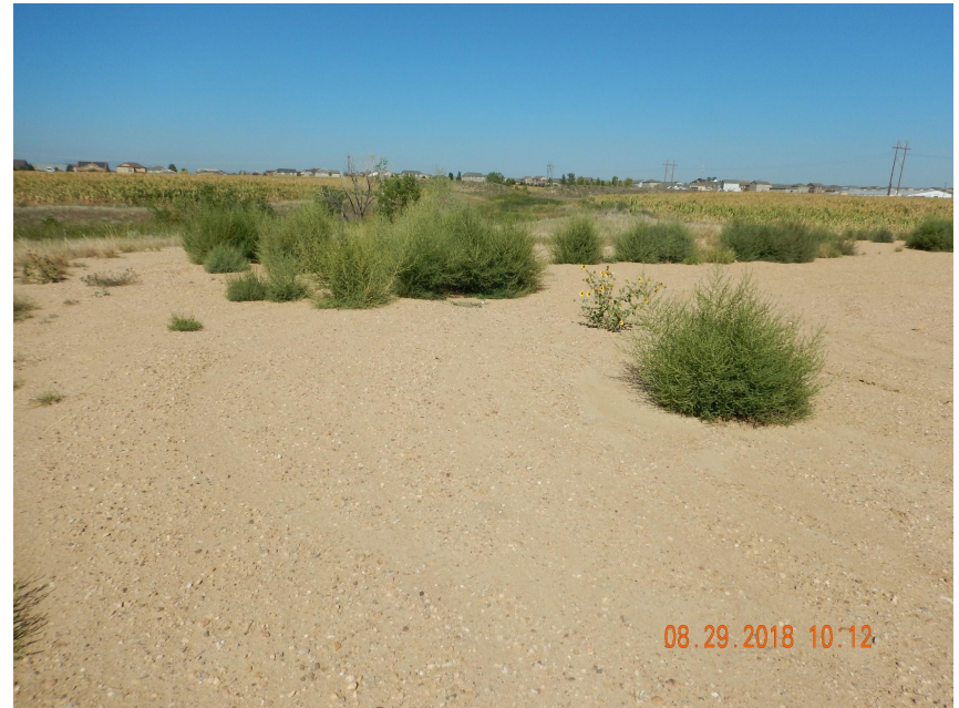
Photo 3. Photo taken from the southern well/battery location on 8/29/2018, facing Northwest. See comments under Photo 2.