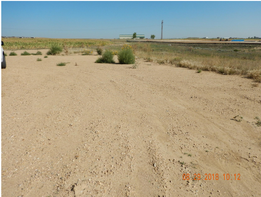
Photo 2. Photo taken from the southern well/battery location on 8/29/2018, facing North. Operator has not reclaimed the well/battery location and access road per Rule 1004 standards and failed to respond to the previous corrective action inspection. Also, weeds were observed along portions of the location.