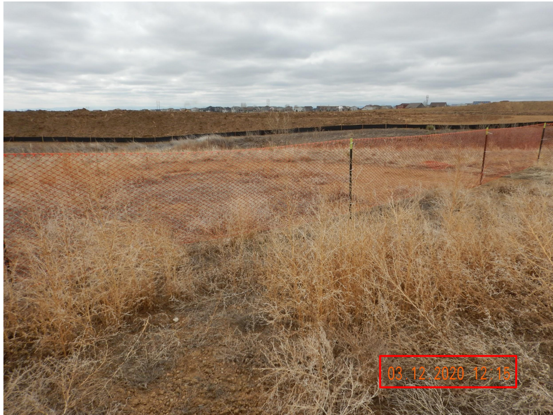
Photo 6. Photo taken from the well/battery location on 3/12/2020, facing South. See comments under Photo 5.