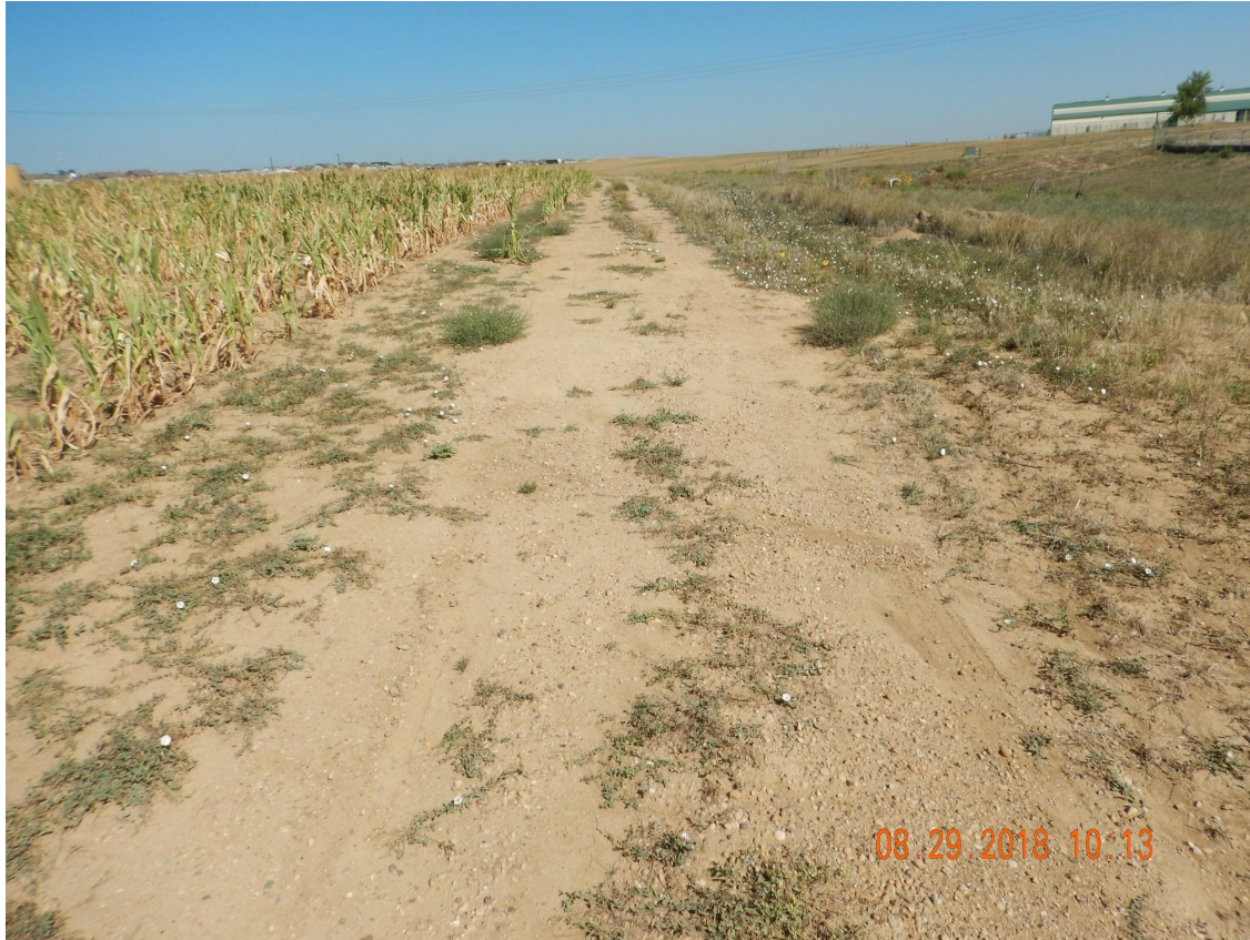
Photo 4. Photo taken along a portion of the access road on 8/29/2018, facing North. See comments under Photo 2.