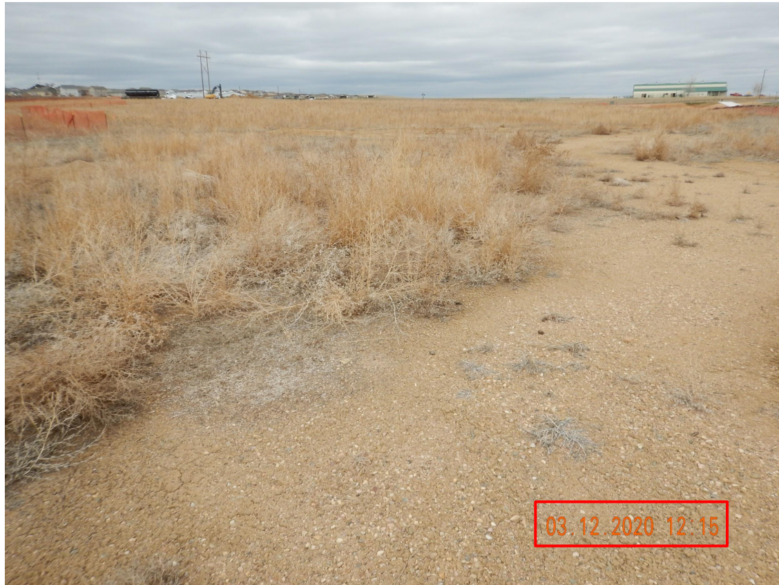
Photo 5. Photo taken from the well/battery location on 3/12/2020, facing North. Photo illustrates Operator has failed to perform final reclamation activities and control weeds.

Note: It appears the well/battery location is part of a land use change for a planned development for the Timberleaf subdivision.