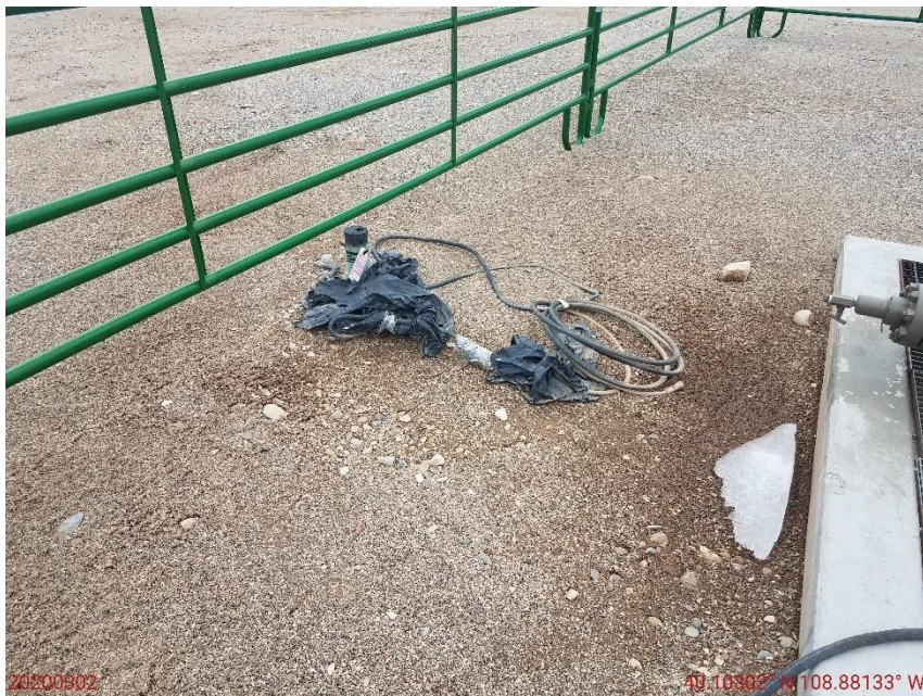
Photo 47: Additional riser/pipe adjacent to the wells. Equipment appears to be unused/unneeded.