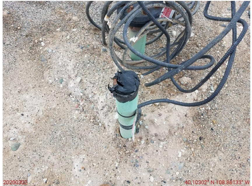
Photo 58: Continued from photo 57. Photo shows cap material degrading.