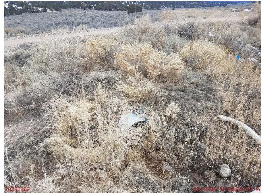
Photo 4: Continued from photo 2. Photo taken from east end of the sediment trap, facing south. Photo shows a culvert leading from the adjacent lands to the south, into the sediment trap. Based on the topography observed, it would appear as though water from the adjacent lands would travel through the culvert and into the sediment trap. Culvert inlets have not been protected/armored in accordance with good engineering practices.