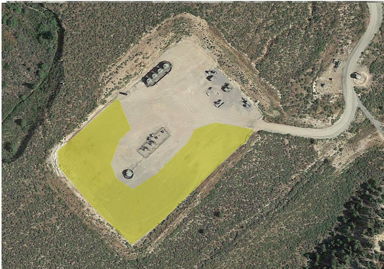
Photo 61: 2019 Google Earth Aerial imagery. 2A #400820779 states size of Location post interim reclamation to be 2.67 acres. Photo shows Reclamation Specialist measured the area of the current production area, including stormwater BMPs via a Trimble handheld GPS unit; The current production area is 4.5 acres in size. Interim reclamation has not been conducted. Photo shows areas on the west, south and eastern ends of the current pad that do not appear to be needed for production activities.