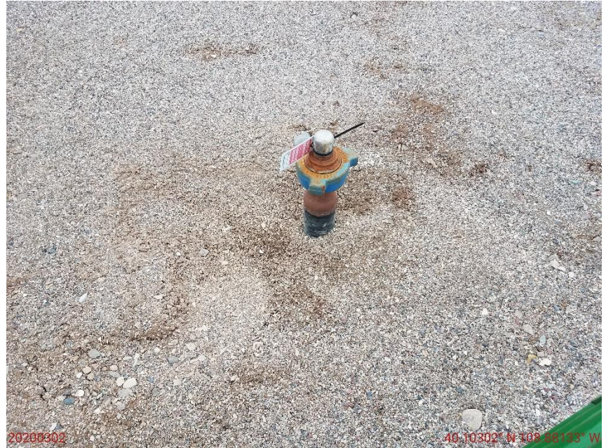
Photo 42: Photo of riser on the adjacent to well 045-22423. Equipment appears to be unused/unneeded.