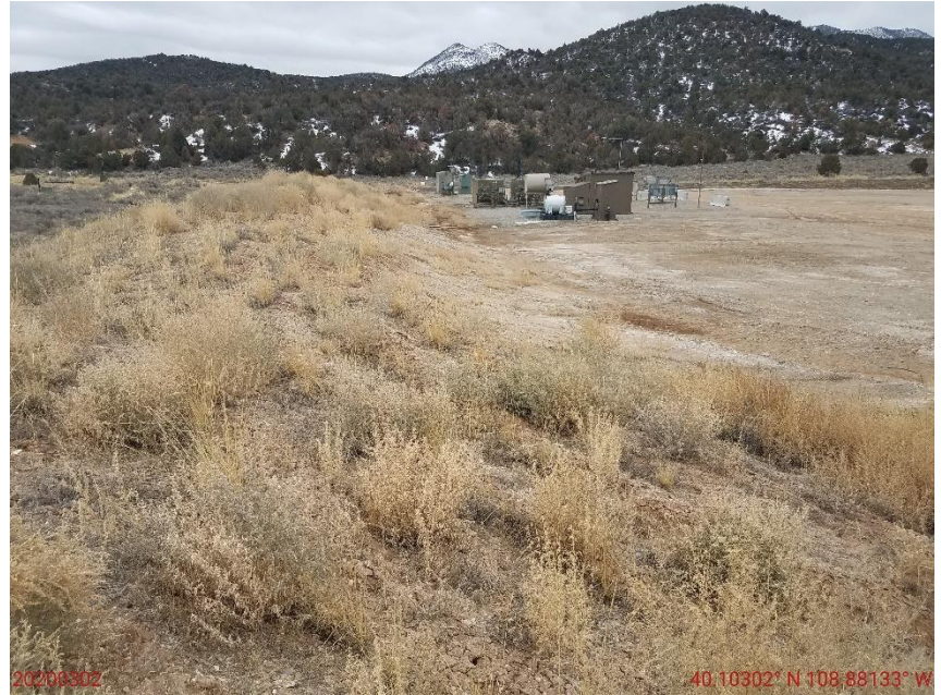
Photo 30: Photo taken from the northern end of the Location, facing southeast. Photos 30-32 provide an overview of the Location from southeast, south to southwest.