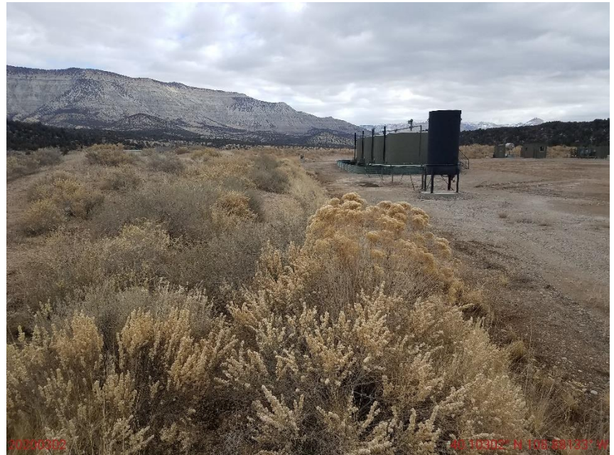
Photo 24: Photo taken from the northwest end of the Location, facing northeast. Photos 24-27 provide an overview of the Location from northeast, east, southeast to south. Photos show an overview of the Location, including areas of the Location that are not needed for production and needs to be reclaimed in accordance with 1003 rules.