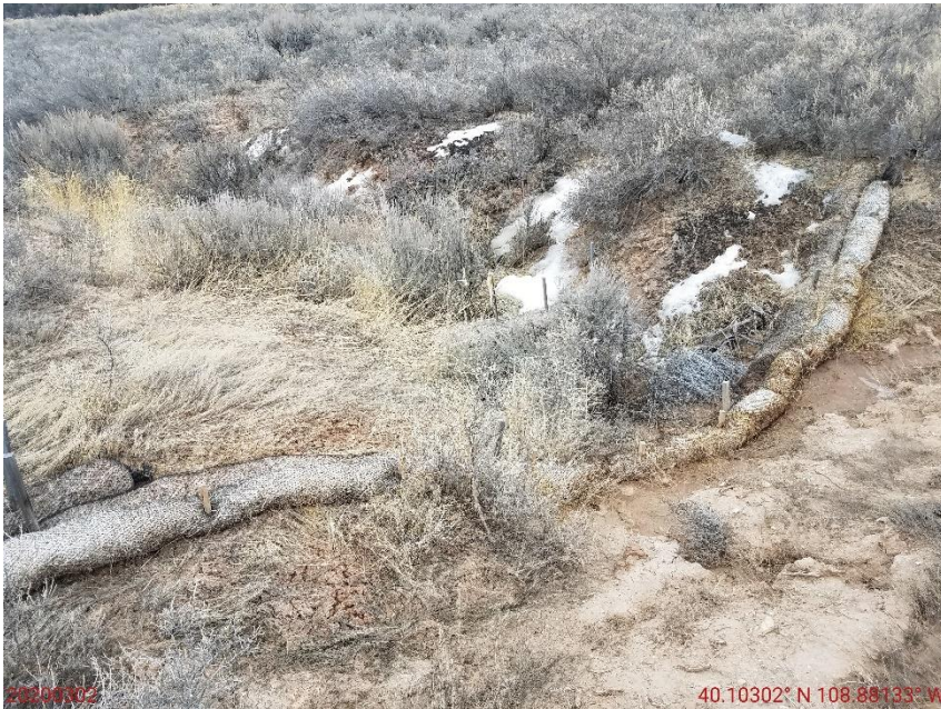
Photo 33: Photo taken from a drainage on the northeast end of the Location. Photo shows Operator has installed straw wattles and straw bales as stormwater BMPs. BMPs appear to have remained intact but also show signs of degradation; maintenance advised.