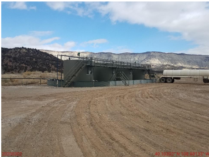
Photo 49: Photo of the tank battery on the north end of the Location.