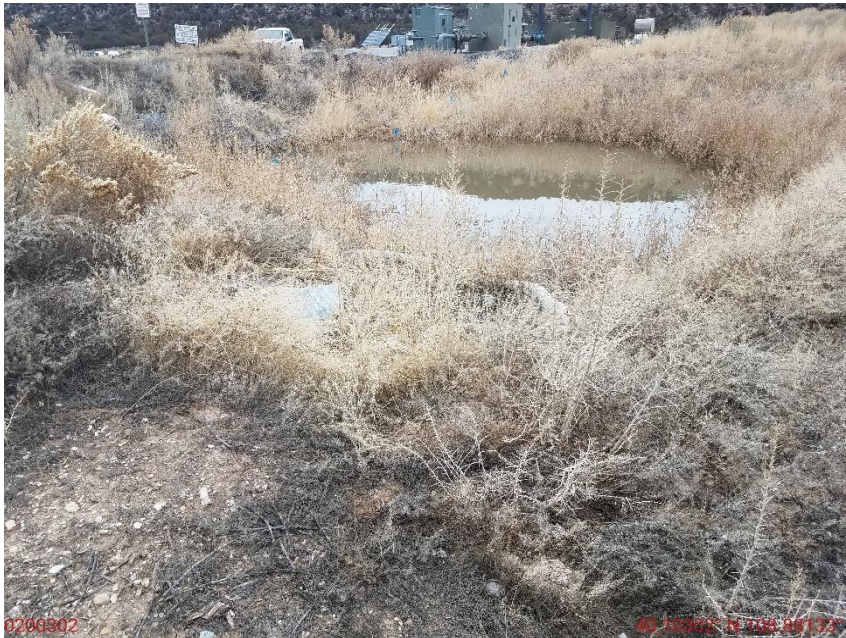
Photo 3: Continued from photo 2. Photo taken from east end of the sediment trap, facing west. Photo shows BMP has not been constructed in accordance with good engineering practices; BMP missing an adequate outlet to allow for sediment laden-free stormwater discharge from the Location.