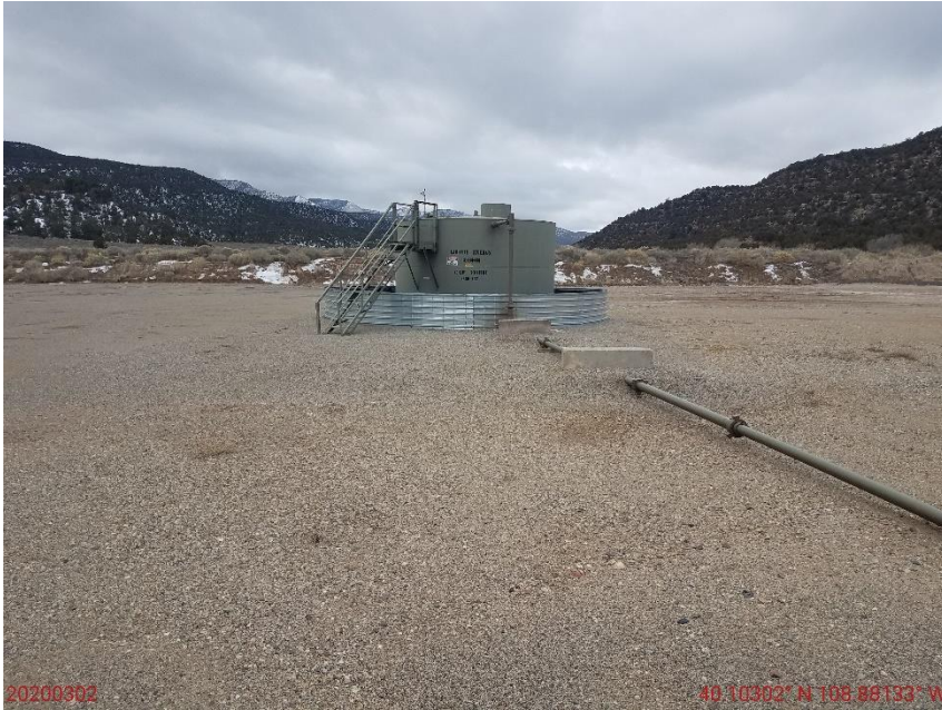
Photo 41: Photo of a 300 bbl sand AST towards the southwest end of the Location.