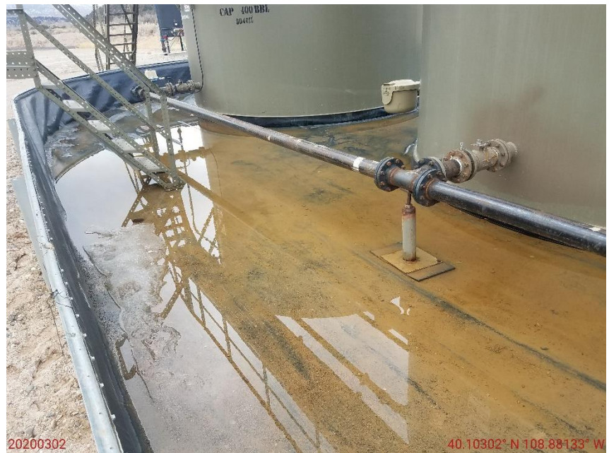
Photo 52: Photo shows fluids within secondary containment. Fluids like stormwater from snowmelt within berms.