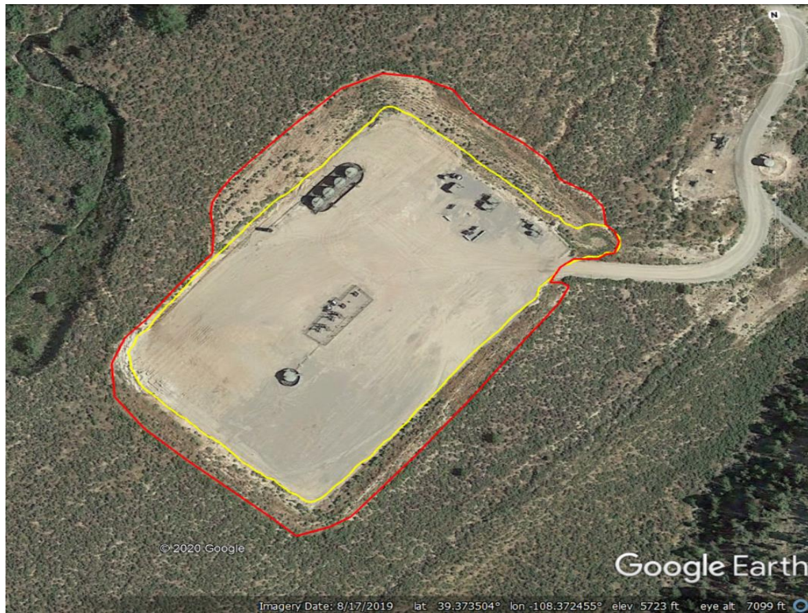
Photo 62: 2019 Google Earth Aerial imagery. Photo shows total disturbance area of the Location (red) to be 6.32 acres in size. Current area of the pad (including sediment trap) is ~4.5 acres.