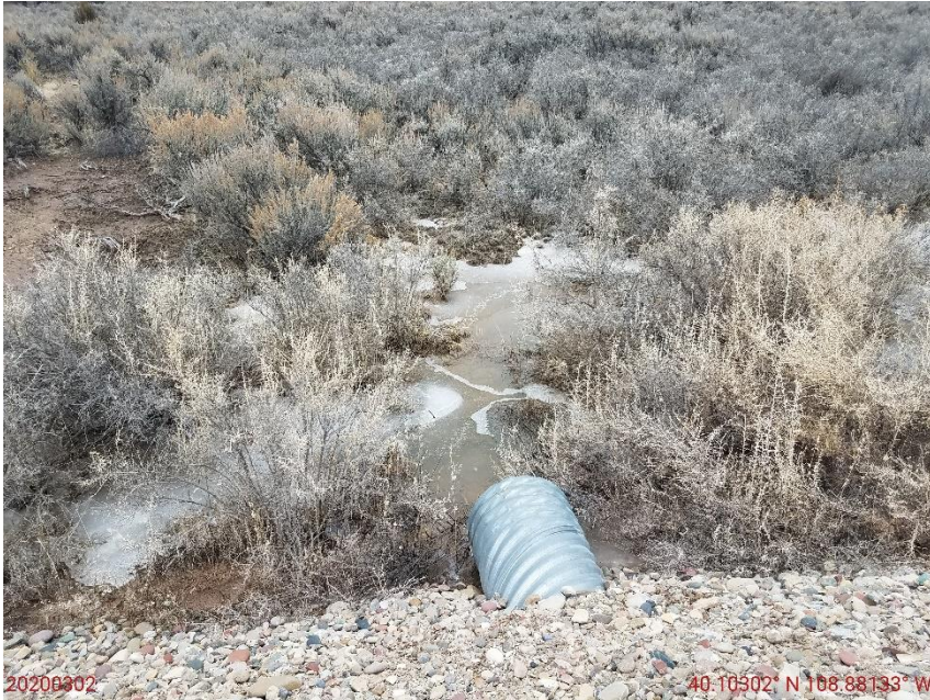
Photo 5: Continued from photo 4, photo shows culvert leading to sediment trap on the south end of the access road. See comments under photo 4.