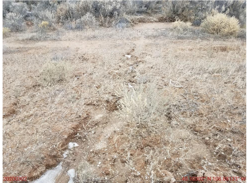
Photo 28: Photo taken from the soil stockpile on the northwest end of the Location. Photo shows erosion degradation evident on slopes.