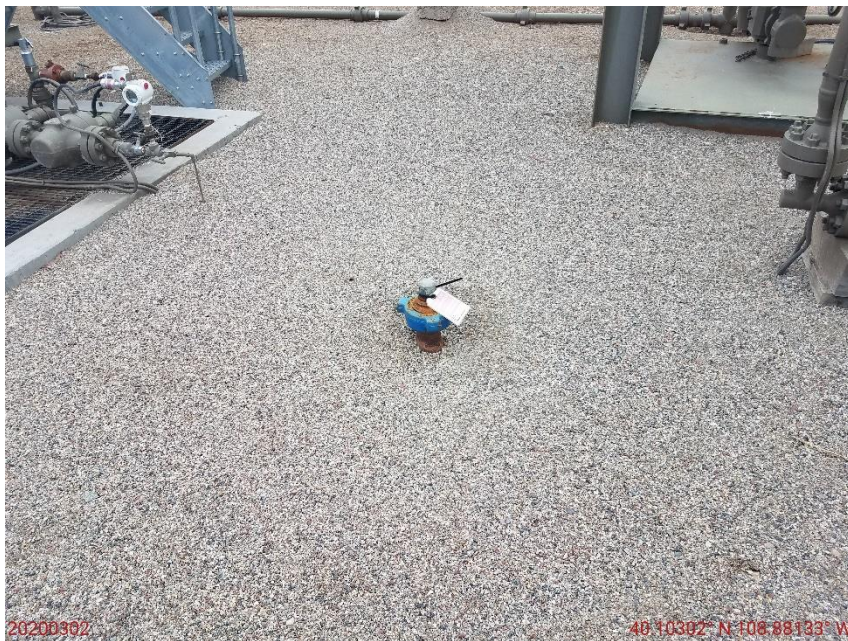
Photo 43: Additional riser adjacent to the wells. Equipment appears to be unused/unneeded.