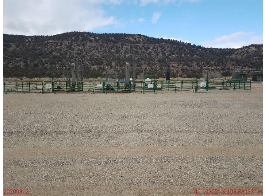
Photo 40: Photo taken from the Location, facing northwest. Photo shows the four (4) active wells on the Location.