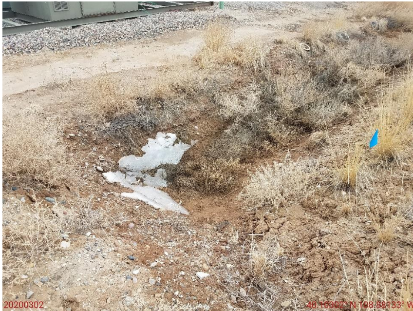
Photo 35: Photo taken from the stormwater ditch on the northeast end of the pad. Stormwater ditch has not been constructed with a proper outlet to allow for stormwater discharge; A berm has been constructed across the ditch damming the ditch.