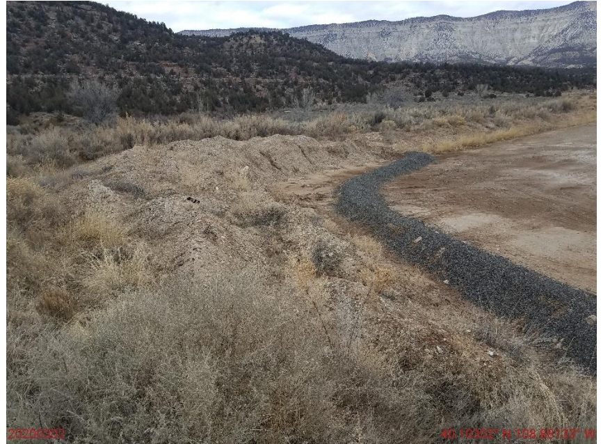
Photo 18: Photo taken from the western corner of the Location, facing west. Photo shows slopes of the Location have not been stabilized; erosion degradation evident.