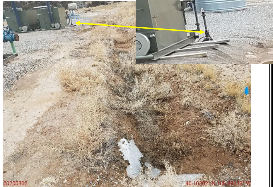
Photo 36: Continued from photo 35. Photo also shows riser identified in FIR 698100016 remaining on the Location; Corrective actions required Operator to remove riser.