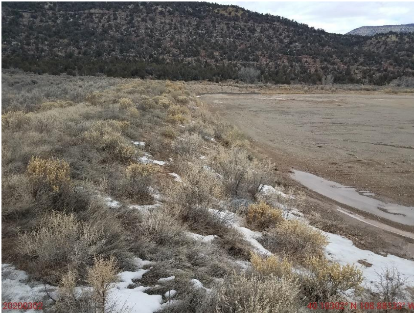
Photo 11: Photo taken from the south corner of the Location facing northwest. Photos 11-13 provide an overview of the Location from northwest, north to northeast. Photos show areas of the Location that are not needed for production and needs to be reclaimed in accordance with 1003 rules.