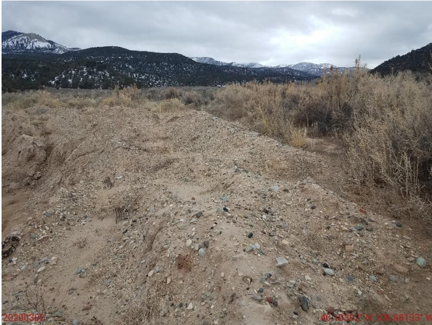
Photo 19: Photo taken from the western corner of the Location, facing southwest. Photo shows slopes of the Location have not been stabilized; erosion degradation evident.