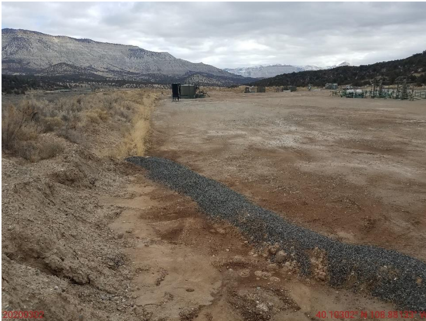
Photo 21: Photo taken from the western corner of the Location facing northeast. Photos 21-23 provide an overview of the Location from northeast, east to southeast. Photos show areas of the Location that are not needed for production and needs to be reclaimed in accordance with 1003 rules.