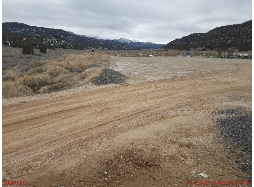
Photo 6: Photo taken from the east end of the Location (Location entrance), facing southwest. Photos 6-8 provide an overview of the Location from southwest, west to northwest.