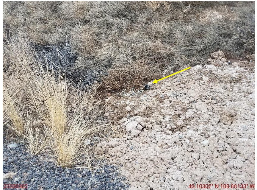
Photo 10: Continued from photo 9. Photo shows culvert outlet leading off Location. See comments under photo 9.

Photo 9: Photo taken from east end of the Location (southwest from the entrance). Photo shows area of the Location where Operator appears to have constructed stormwater diversion ditch to discharge stormwater from the pad off Location through a culvert (arrow). BMP has not been constructed in accordance with good engineering practices; BMP missing sufficient inlet/outlet protection to trap sediment and allow for sediment laden-free stormwater discharge.