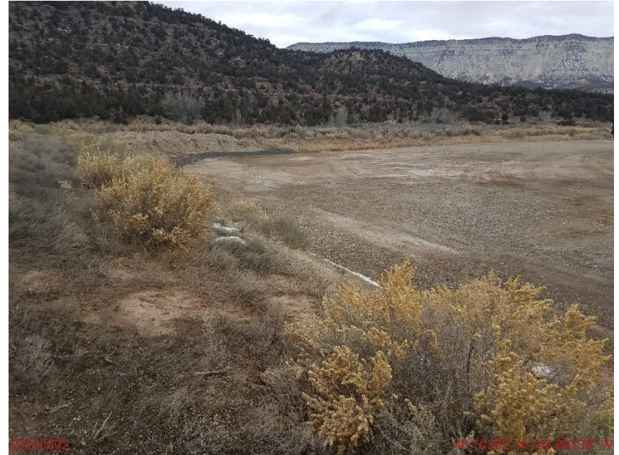
Photo 14: Photo taken from the southwest end of the Location facing northwest. Photos 14-17 provide an overview of the Location from northwest, north to northeast to east. Photos show areas of the Location that are not needed for production and needs to be reclaimed in accordance with 1003 rules.