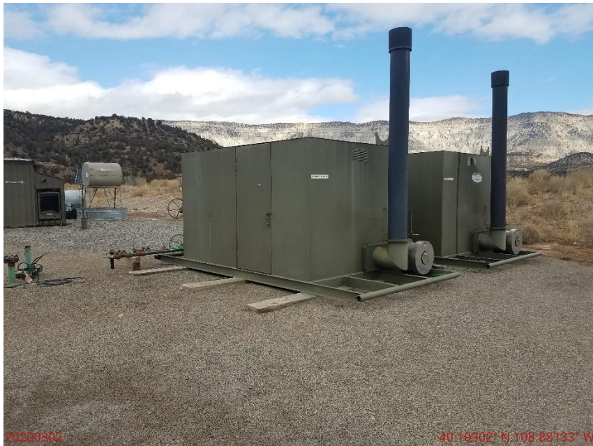
Photo 59: Photo of equipment on the northeast end of the Location.