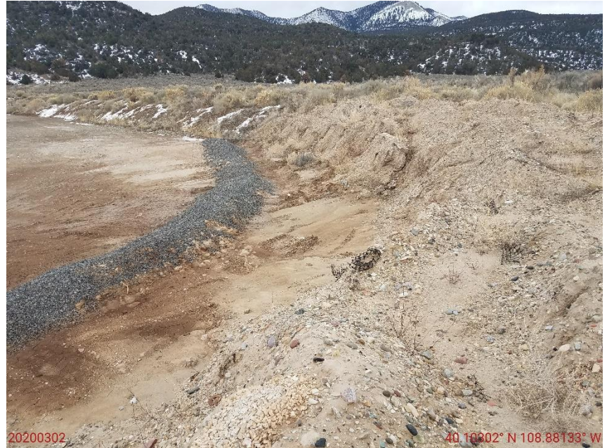
Photo 20: Photo taken from the western corner of the Location, facing southwest. Photo shows slopes of the Location have not been stabilized; erosion degradation evident.