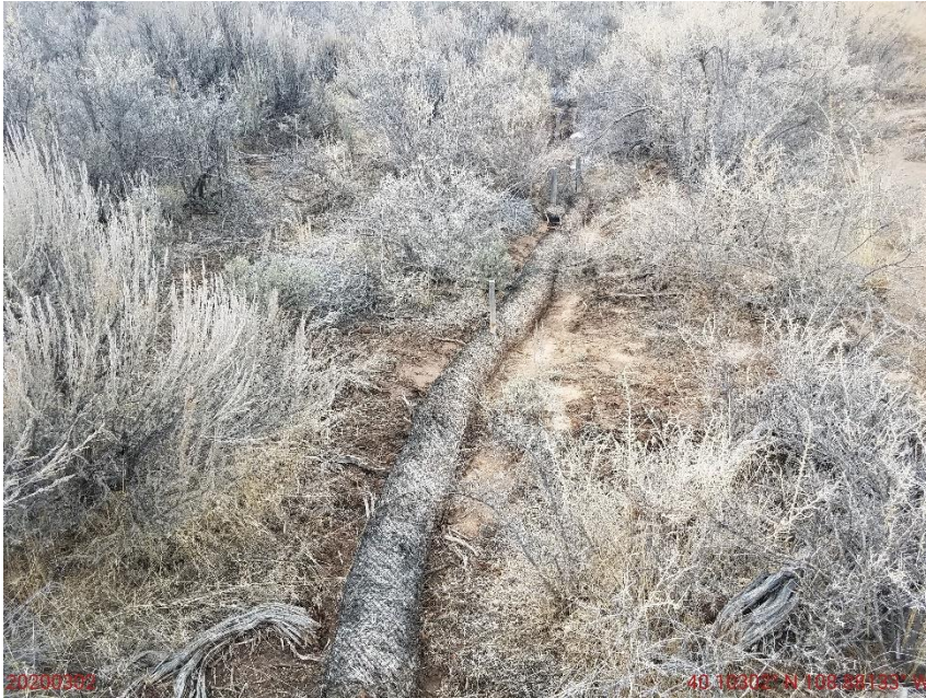
Photo 29: Photo taken from the perimeter of the Location's disturbance area. Operator appears to have installed straw wattles along the northwest/north/northeastern perimeter of the Location. BMPs appear to have remained intact but also show signs of degradation; maintenance advised.