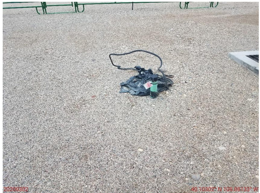
Photo 46: Additional riser/pipe adjacent to the wells. Equipment appears to be unused/unneeded.