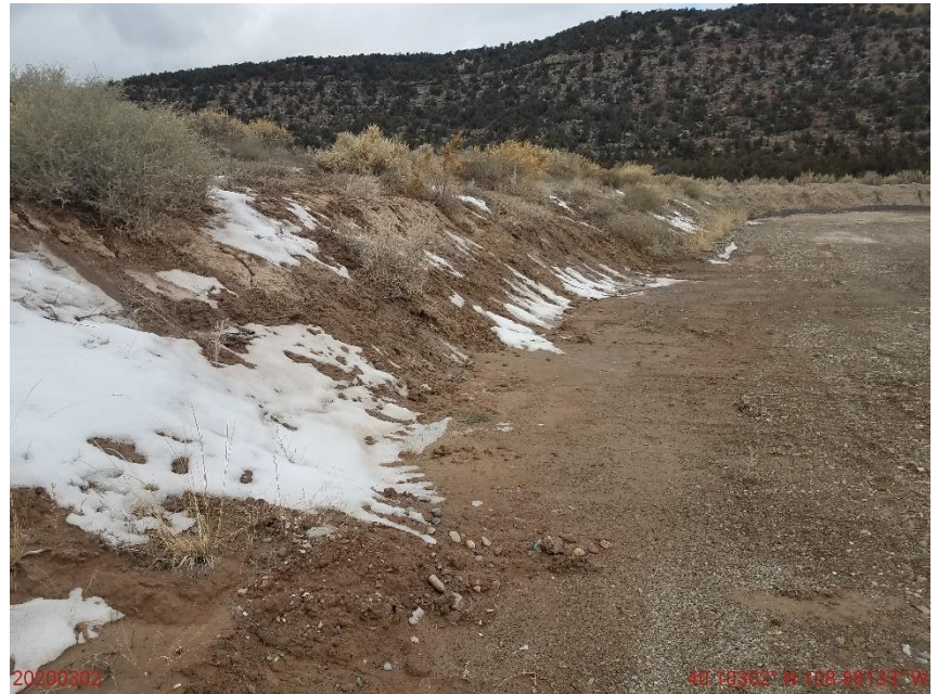
Photo 38: Photo taken from the slopes on the southwest end of the Location. Photo shows areas of the slopes that have not been sufficiently stabilized.