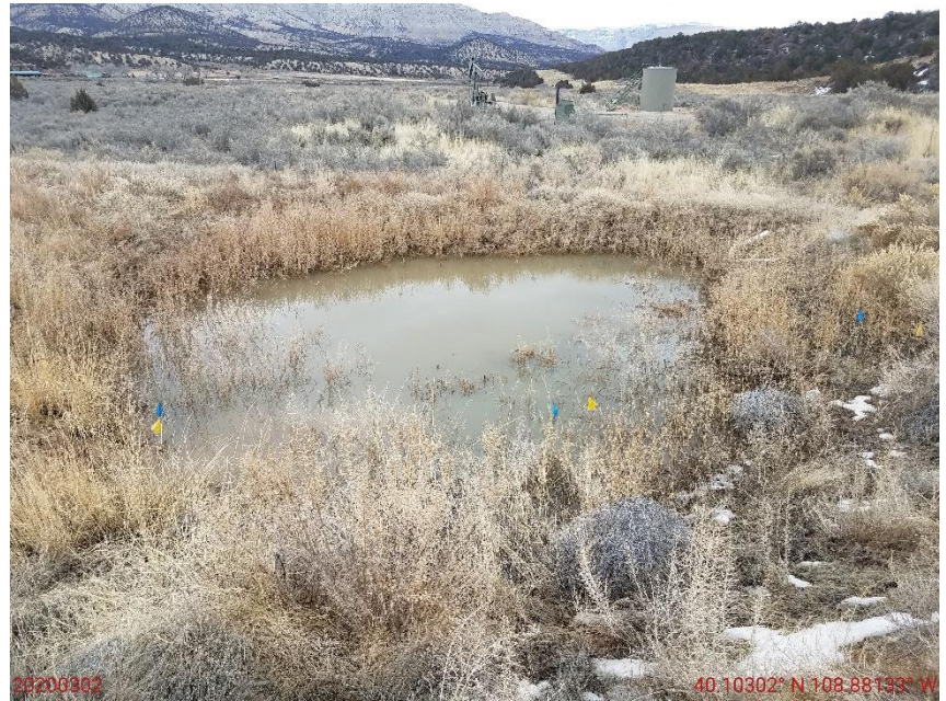
Photo 2: Photo taken from the sediment pond/trap on the east end of the Location, facing northeast. Photo shows BMP has not been constructed in accordance with good engineering practices; BMP missing an adequate outlet to allow for sediment laden-free stormwater discharge from the Location.