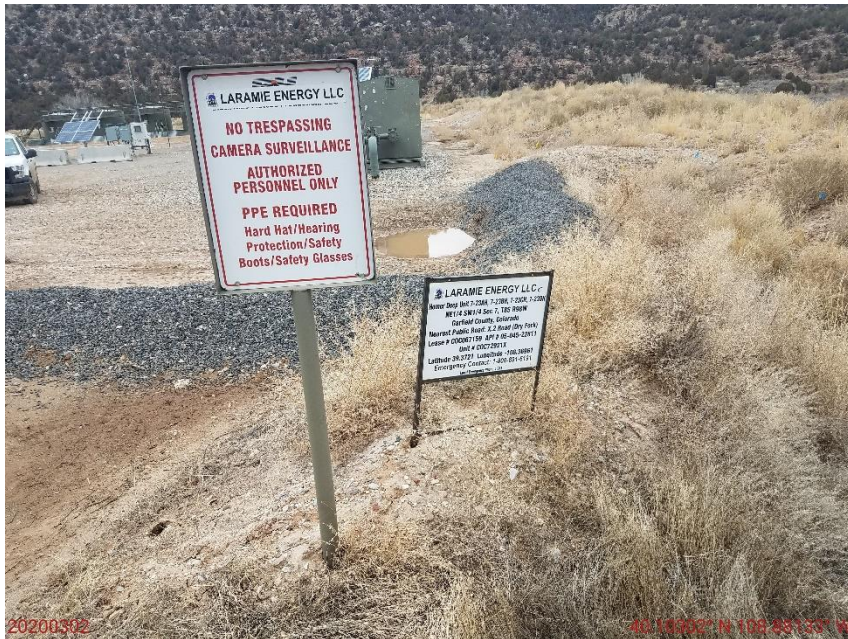
Photo 1: Photo taken from the Location entrance, facing west. Photo shows signage at Location entrance.