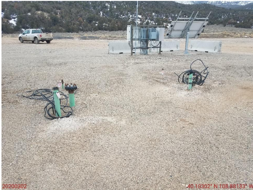
Photo 57: Photo taken from the northeast end of the Location. Photo shows 5 additional riser/pipe on Location. Equipment appears to be unused/unneeded.