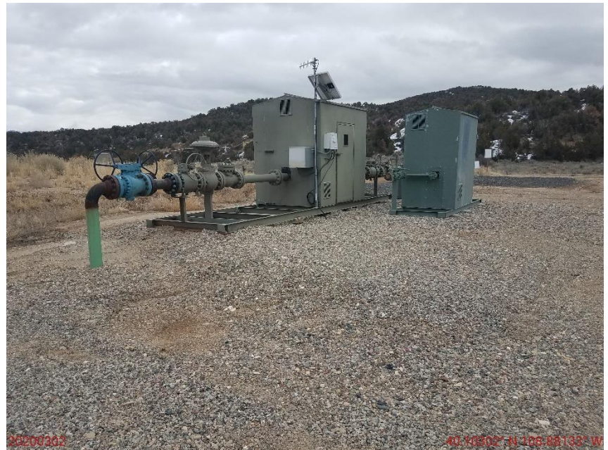
Photo 60: Photo of equipment on the northeast end of the Location.