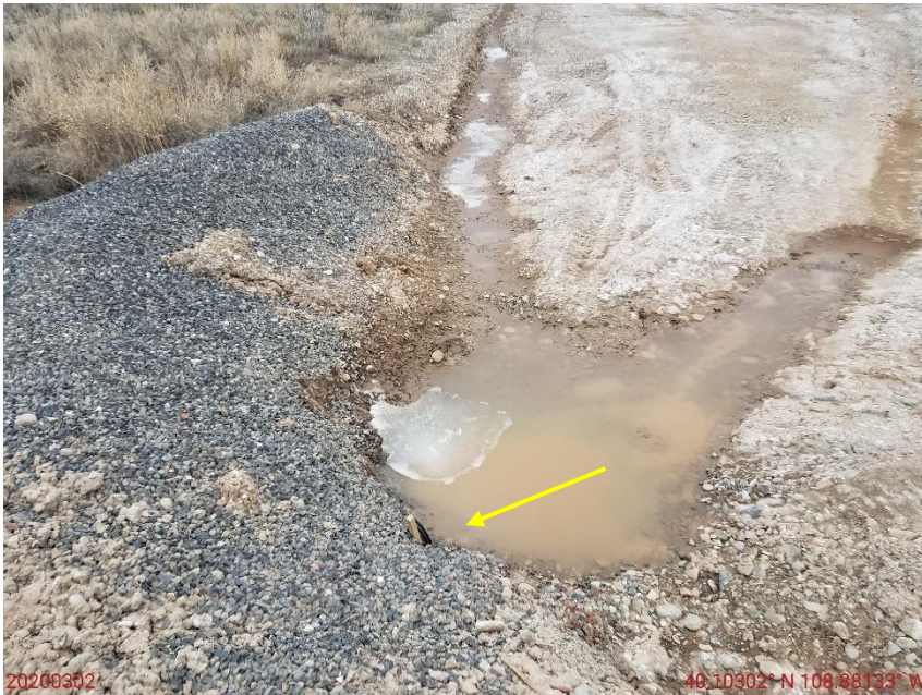
Photo 9: Photo taken from east end of the Location (southwest from the entrance). Photo shows area of the Location where Operator appears to have constructed stormwater diversion ditch to discharge stormwater from the pad off Location through a culvert (arrow). BMP has not been constructed in accordance with good engineering practices; BMP missing sufficient inlet/outlet protection to trap sediment and allow for sediment laden-free stormwater discharge.