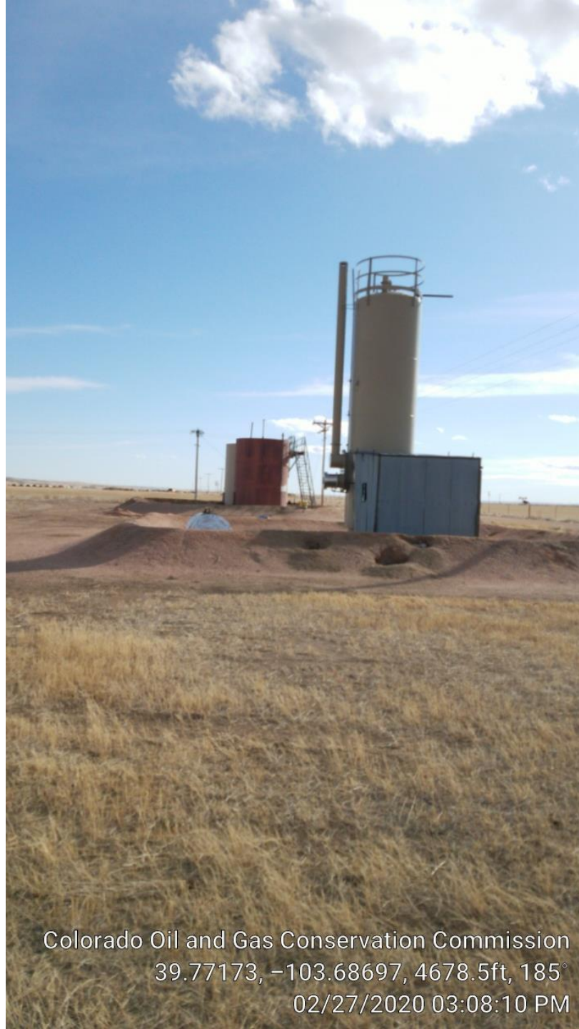
Colorado Oil and Gas Conservation Commission 39.77173, -103.68697, 4678.5ft, 185° 02/27/2020 03:08:10 PM