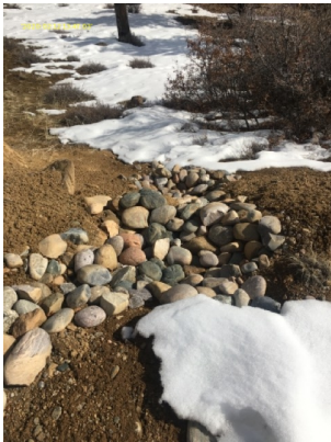
Photo of first corrective action completed

Completed work description Corrective Action 1