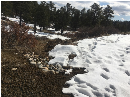
Photo of second corrective action completed