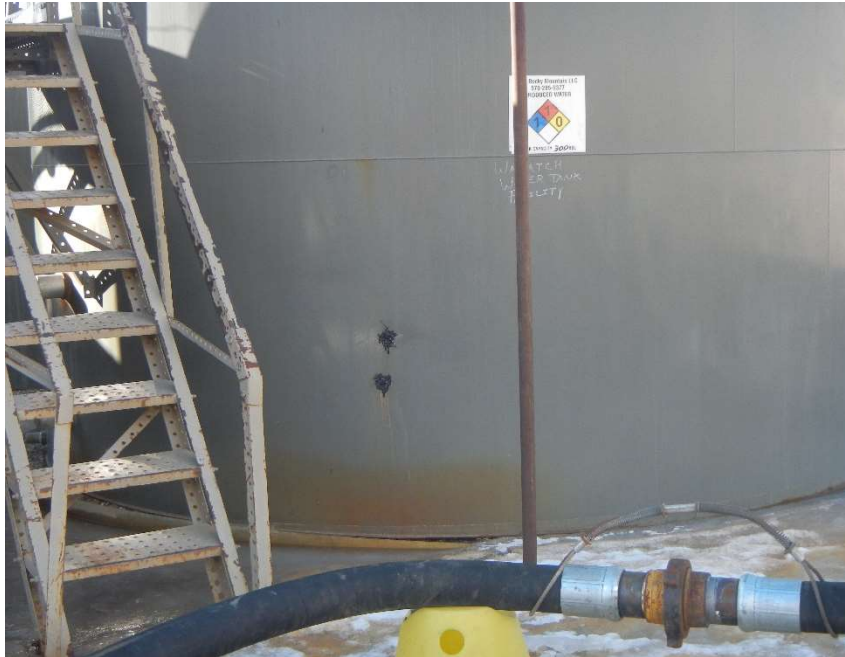
Photo #5 - Multiple repairs of the northwest Produced Water Steel AST.