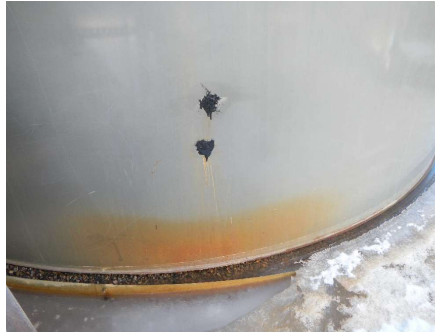
Photo #6 - Multiple repairs of the northwest Produced Water Steel AST.