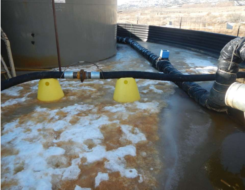
Photo #3 – Impacted snow and fluid within the tank battery secondary containment.