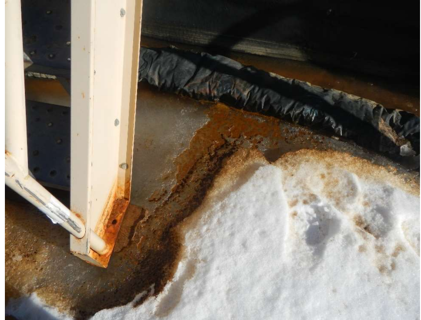
Photo #4 - Impacted snow and fluid within the tank battery secondary containment.