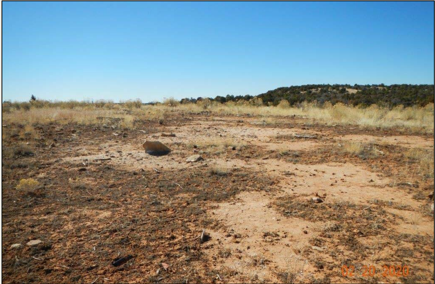
Photo 4. View of bare soils that appear to be salt impacted within the northern project area. Revegetation will likely require soil testing and amendment.