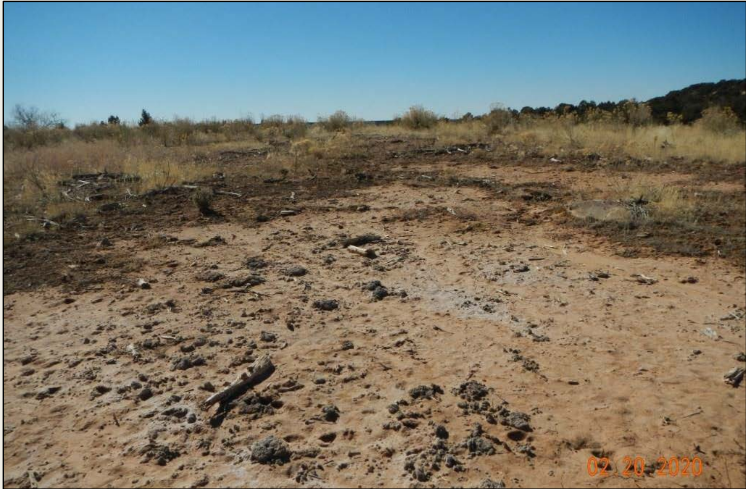
Photo 5. View of bare soils that appear to be salt impacted within the western project area. Revegetation will likely require soil testing and amendment.