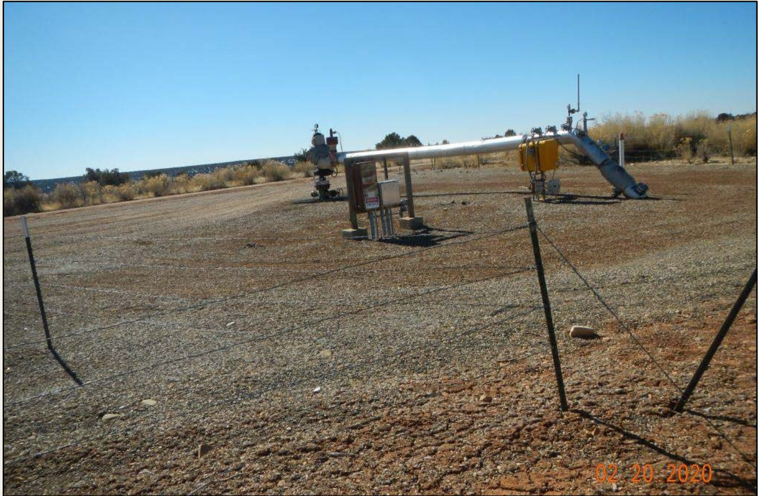
Photo 1. View of the project area from the northeastern edge of the working area facing center.