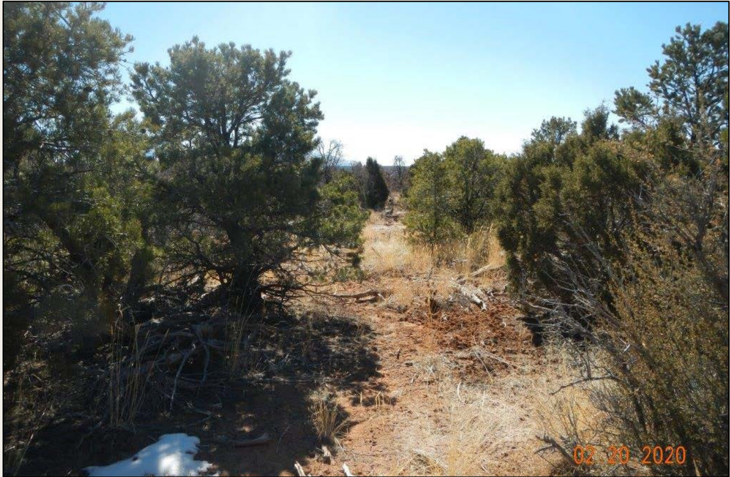
Photo 7. View of the reference area, comprised of pinyon juniper woodland, mixed cliffrose shrubland, and grasses such as Indian ricegrass and sand dropseed in the understory.