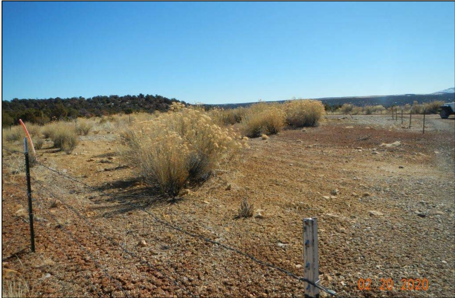
Photo 2. View of the eastern project area from the northeastern edge facing southward. Sparse revegetation within fenced areas. Additional reclamation is needed.