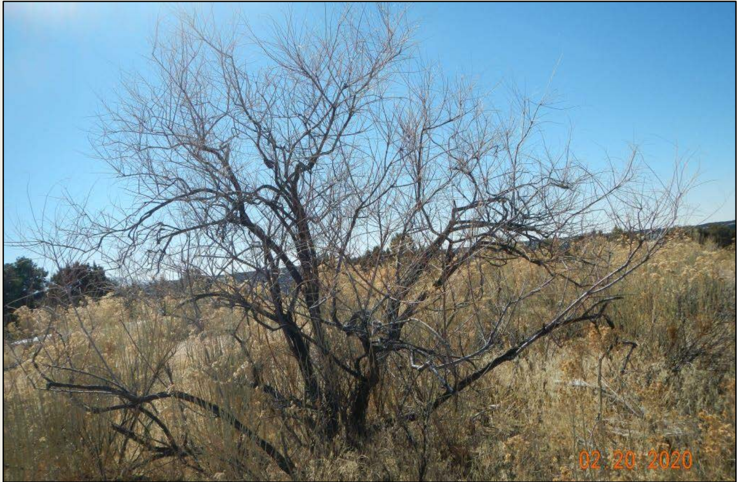
Photo 6. View of salt cedar weed within the western project area, needs to be controlled and removed.