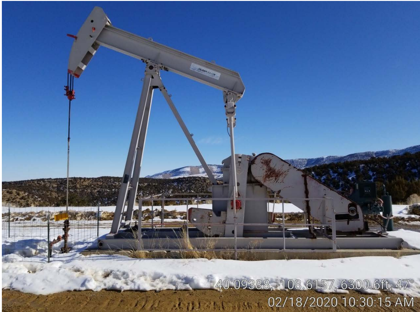
Photo 2. Pump jack.

Fletcher Gulch 33-44 API: 05-103-10889 Inspection: 700400044