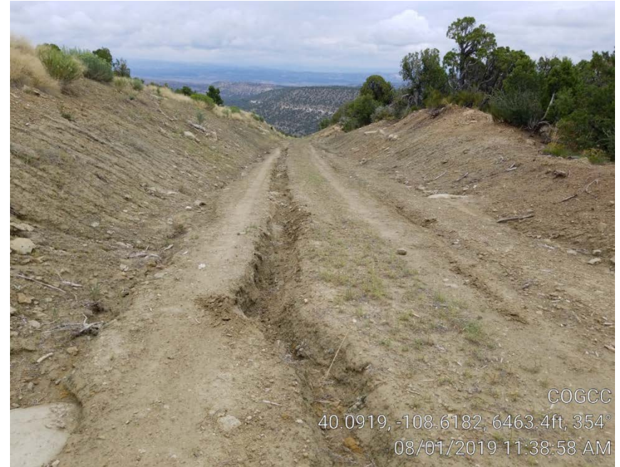
Photo 5. Lease road on 8-1-2019.