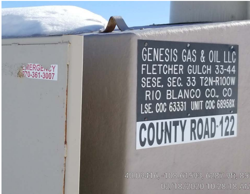
Photo 6. Battery sign on 2-18-2020.

Fletcher Gulch 33-44 API: 05-103-10889 Inspection: 700400044