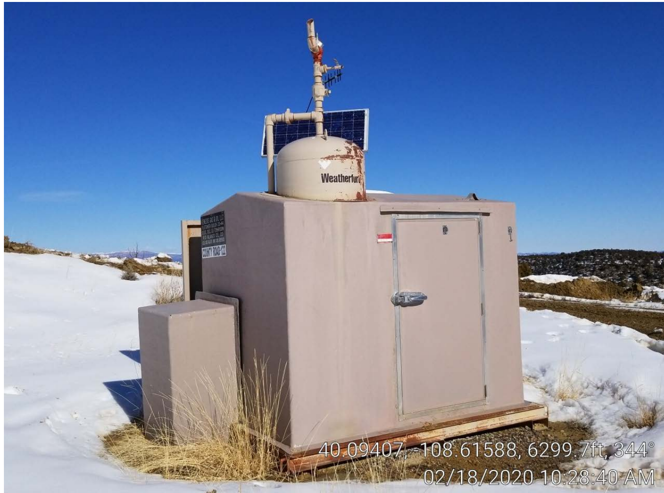
Photo 3. Meter building.

Fletcher Gulch 33-44 API: 05-103-10889 Inspection: 700400044