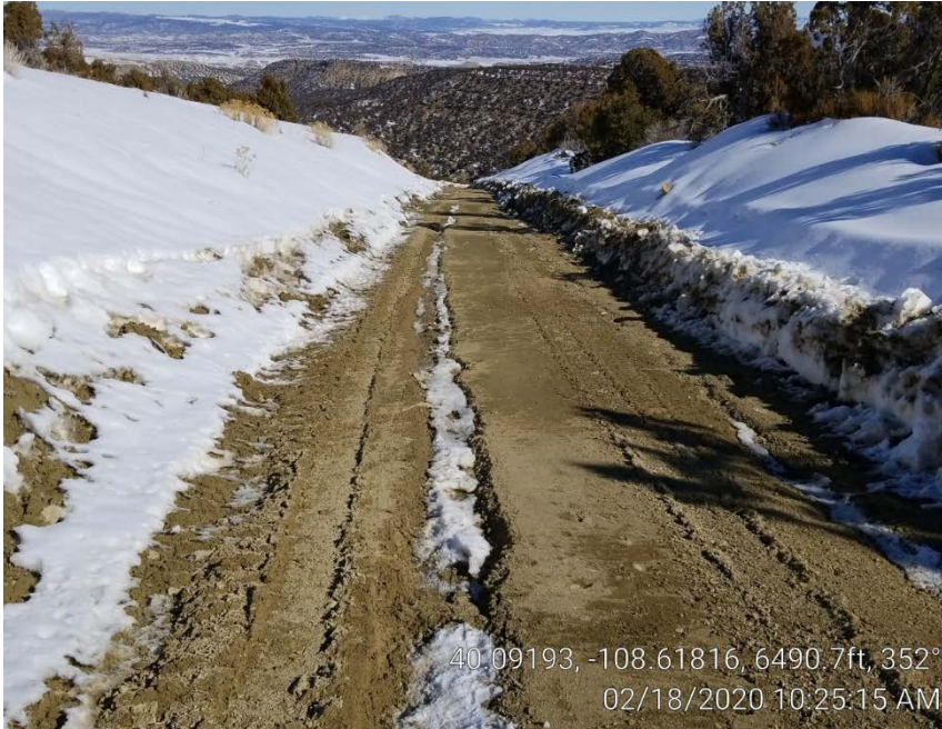
Photo 4. Lease road on 2-18-2020.

Fletcher Gulch 33-44 API: 05-103-10889 Inspection: 700400044