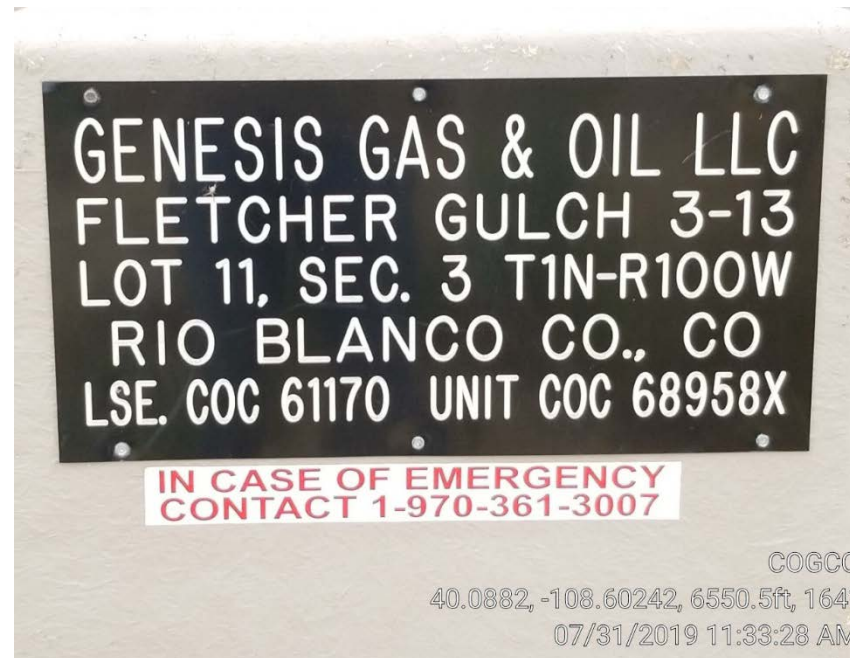
Photo 4. Battery sign on 7-13-2019.