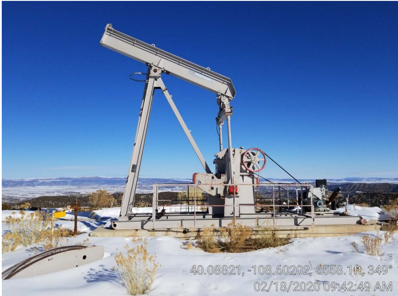
Photo 2. Pump jack.

Fletcher Gulch 3-13 API: 05-103-10892 Inspection: 700400036