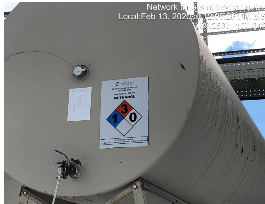
Photo #0577 1000 gallon methanol tank capacity in accurate.