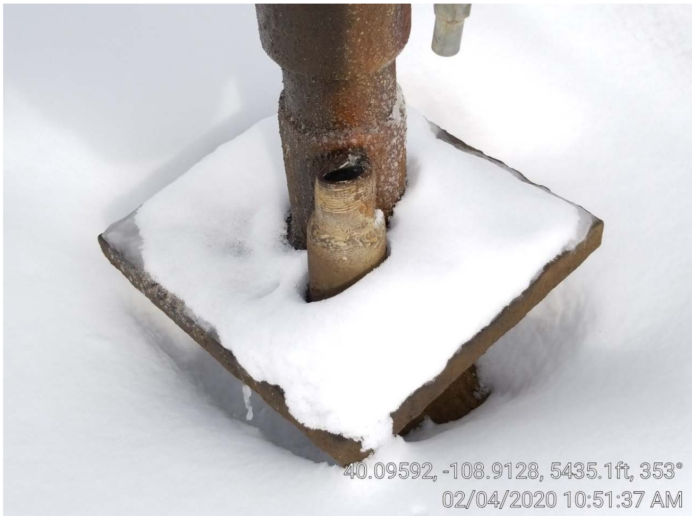
Photo 2. Well head.

Phillips S-10-36 API: 05-103-60008 Inspection: 679707228