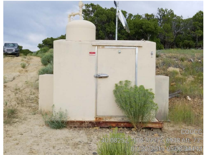
Photo 5. Vegetation next to meter building on 7-30-2019.