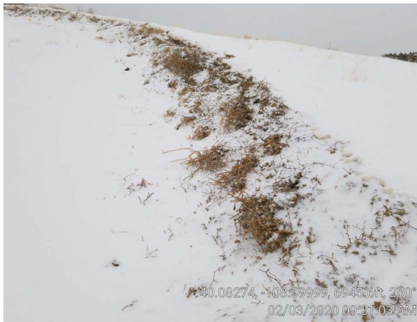
Photo 6. Weed debris.

Fletcher Gulch 3-33 API: 05-103-10891 Inspection: 679707205