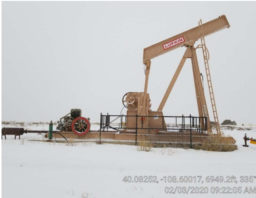
Photo 2. Vegetation next to pump jack on 2-3-2020.

Fletcher Gulch 3-33 API: 05-103-10891 Inspection: 679707205