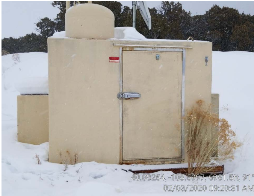
Photo 4. Vegetation next to meter building on 2-3-2020.