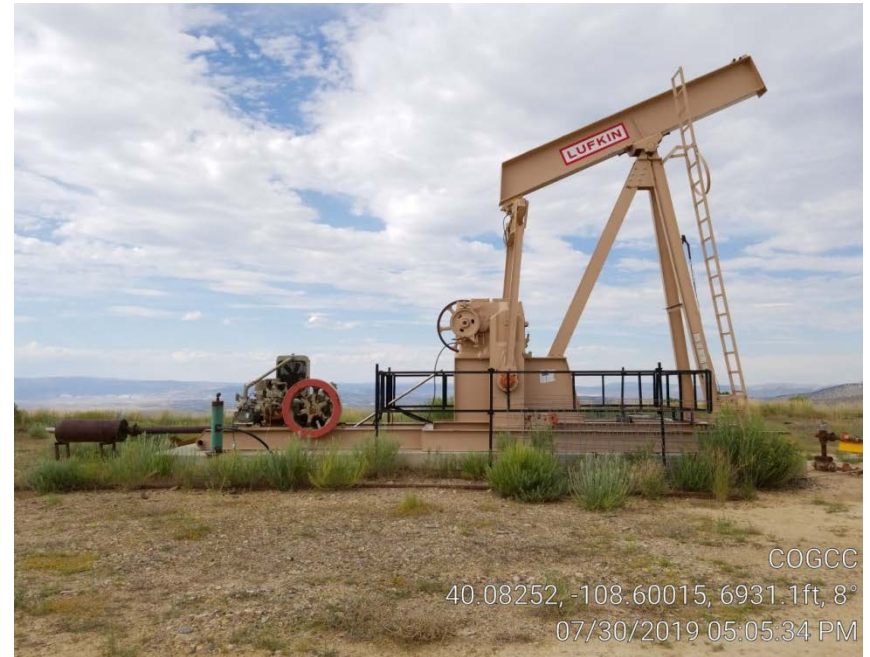
Photo 3. Vegetation next to pump jack on 7-30-2019.