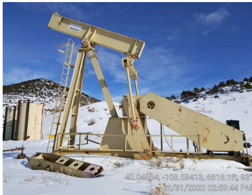
Photo 2. Pump jack weed debris on 10-31-2020.