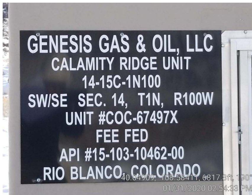
Photo 12. "911" missing on battery sign on 1-31-2020.

Calamity Ridge 14-15C-1N100 API: 05-103-11552 Inspection: 679707187