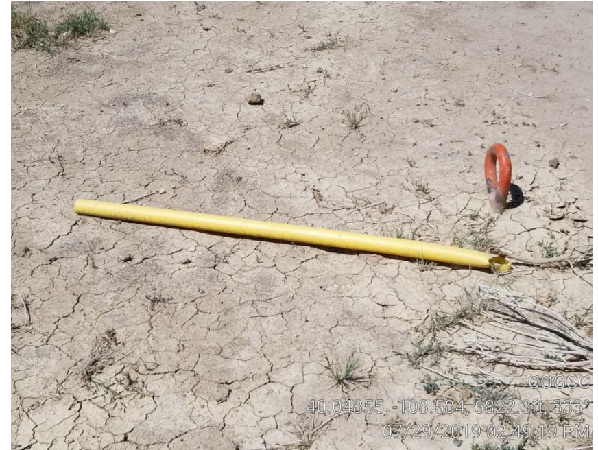
Photo 17. Fallen deadman marker on 7-29-2019.