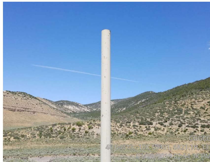
Photo 9. No apparent bird screen on tank vent on 7-29-2019.