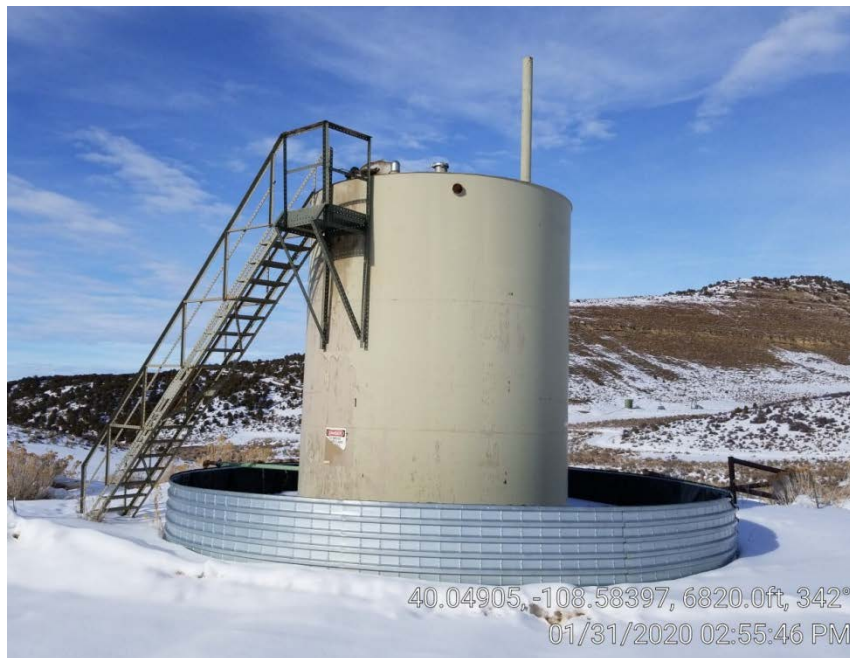
Photo 6. Tank without label on 1-31-2020.