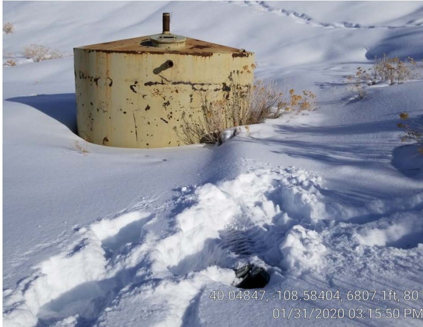
Photo 14. Damaged culvert on 1-31-2020.