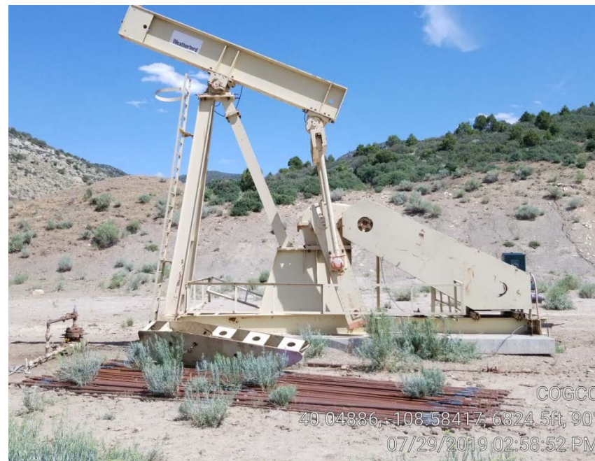
Photo 3. Pump jack weeds on 7-29-2019.