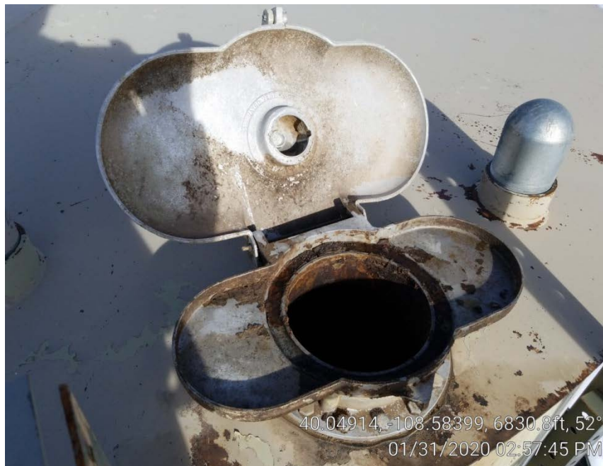
Photo 18. Open tank hatch on permanent tank.