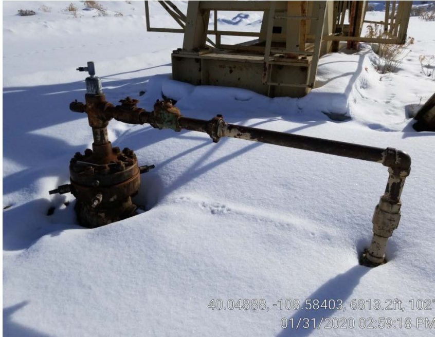
Photo 4. Well head on 1-31-2020.