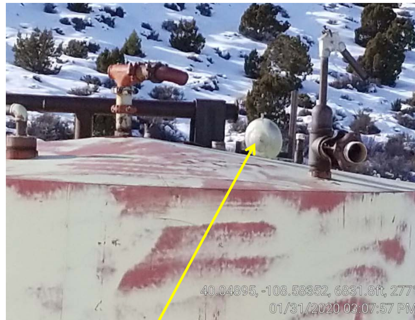
Photo 19. Open tank hatch on portable tank.