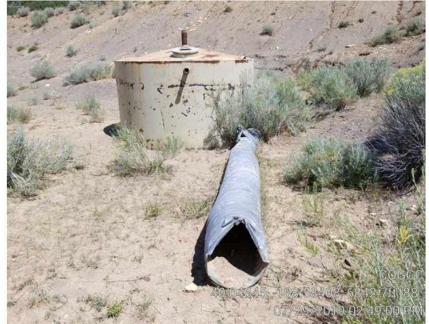
Photo 15. Damaged culver on 7-29-2019.