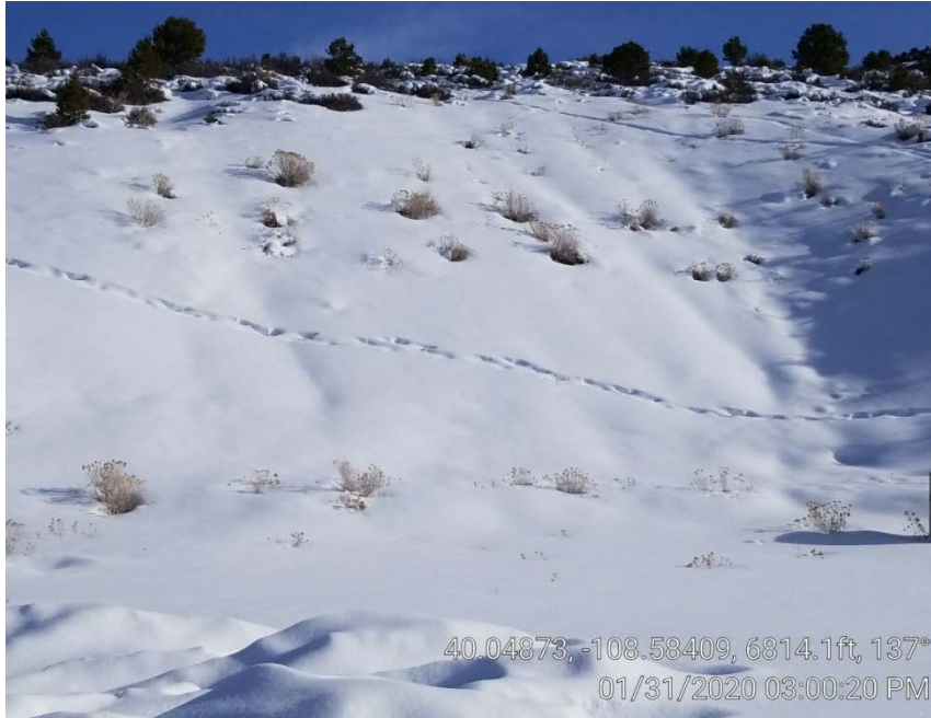
Photo 10. Storm water reeling off hillside on 1-31-2020.