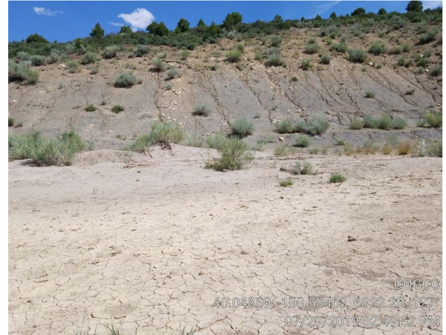
Photo 11. Storm water reeling off hillside on 7-29-2019.