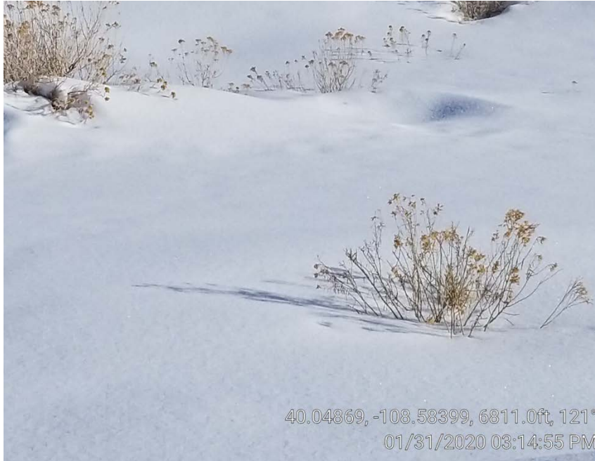
Photo 16. Deadman marker not present on 1-31-2020.