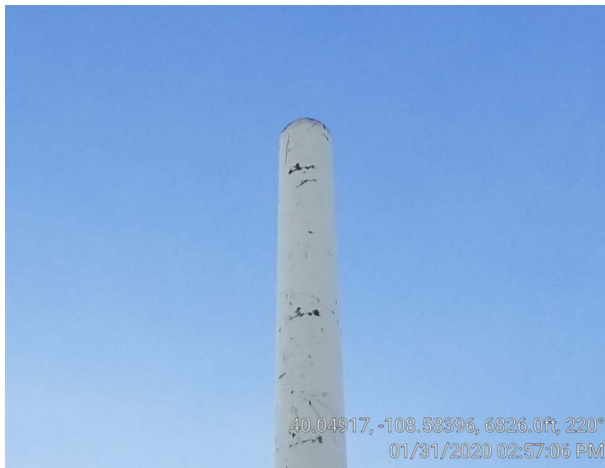
Photo 8. No apparent bird screen on tank vent on 1-31-2020.