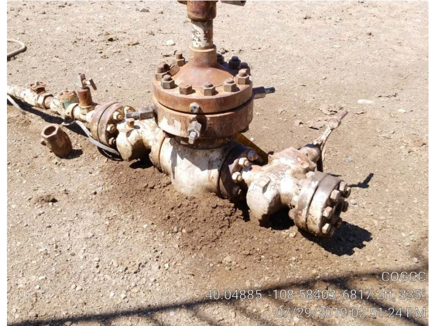
Photo 5. Stain soil at well head on 7-29-2019.