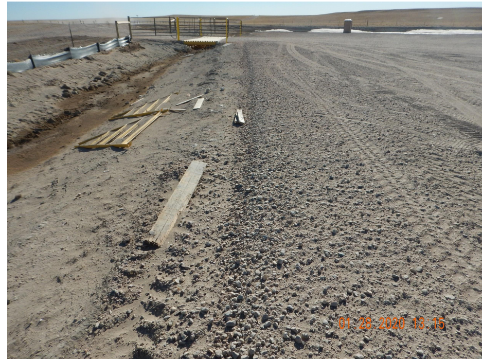
Photo 5. Photo taken from the southeastern location, facing South. Photo illustrates unused equipment and debris being stored at location.

Photo also illustrates the retention area along the eastern location for stormwater management.