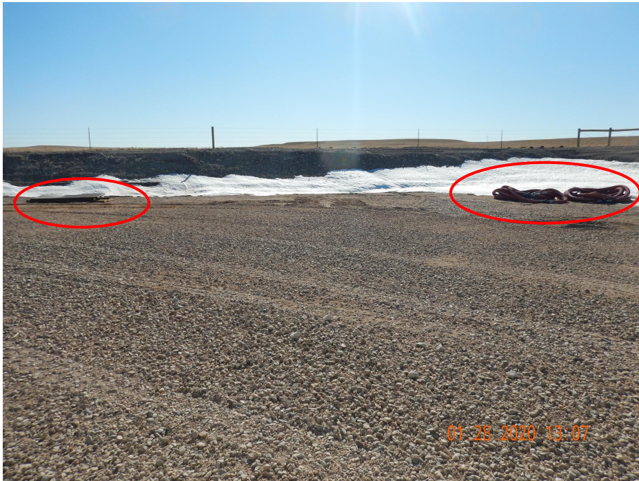
Photo 4. Photo taken from the southwestern location, facing South. Photo illustrates unused equipment being stored at location.