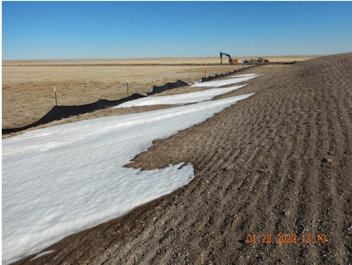
Photo 2. Photo taken from the topsoil stockpile, facing East. Photo illustrates stormwater BMP (silt fence) around the topsoil is not in proper functioning condition.