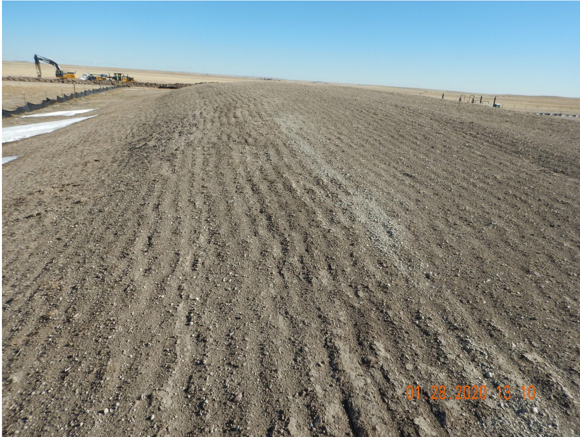
Photo 3. Photo taken from the topsoil stockpile, facing East. Photo illustrates topsoil has not been properly stabilized. Equipment tracking is only a temporary stabilization BMP.