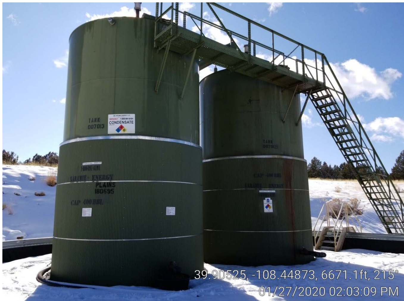
Photo 3. Tanks.

BDU 1-9-299 API: 05-103-11769 Inspection: 679707126