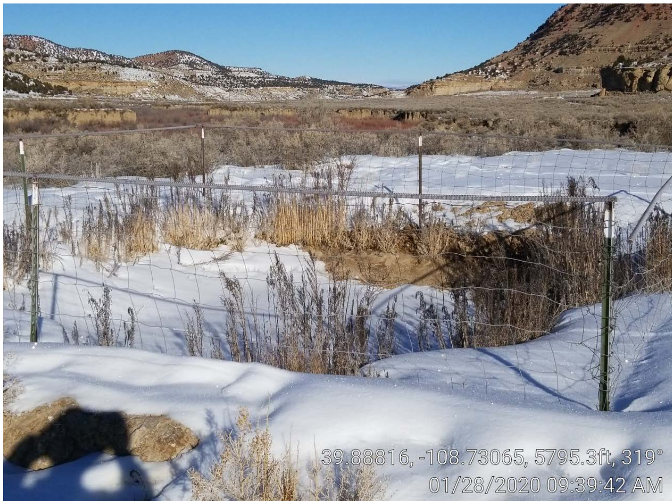
Photo 4. Pit.

Federal 9-2 API: 05-103-08263 Inspection: 679707710