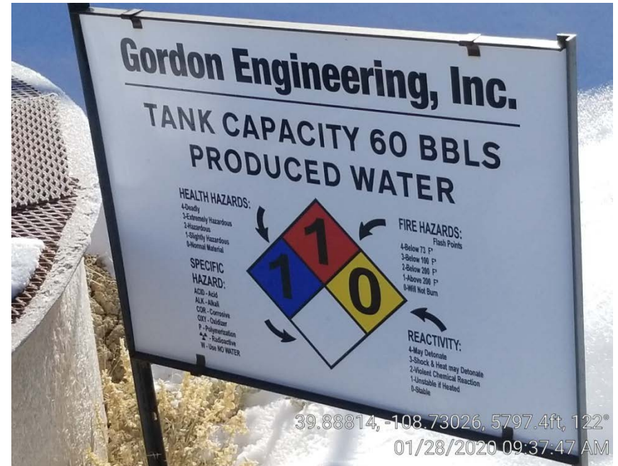
Photo 3. Tank sign.