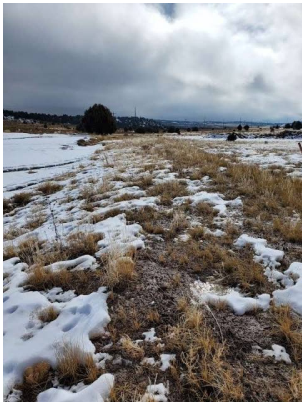
Completed work description Completed work description of corrective action 4 Additional photos

before mowing removed weed debris from reclamation area