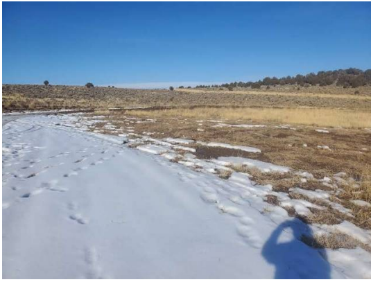
Completed work description of corrective action 3 Photo of fourth corrective action completed