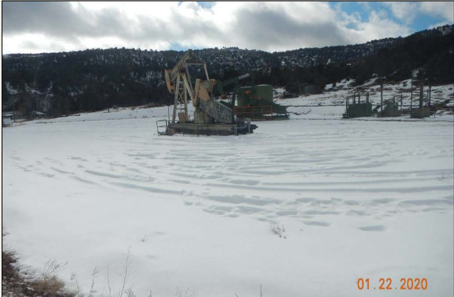
Photo 1. View of the project area from the northeastern corner facing center.