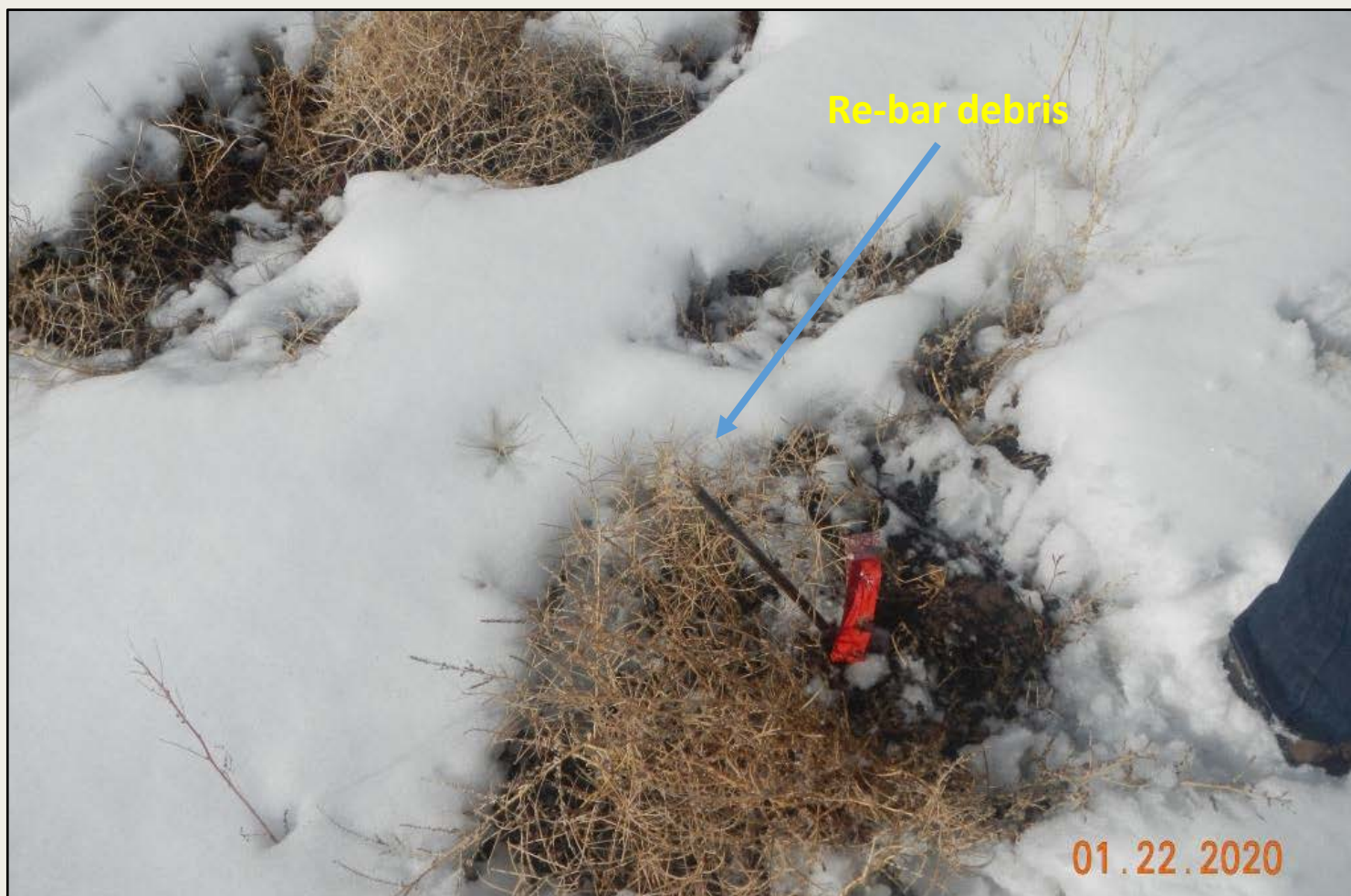
Photo 5. View of metal debris within the southwestern project area.