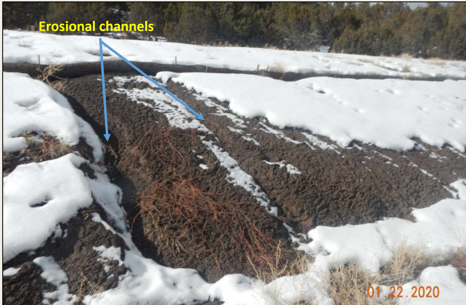
Photo 3. View of erosional channels that remain in the western project area.