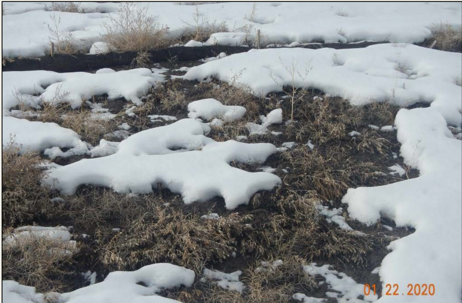
Photo 6. View of Russian knapweed in the western project area.