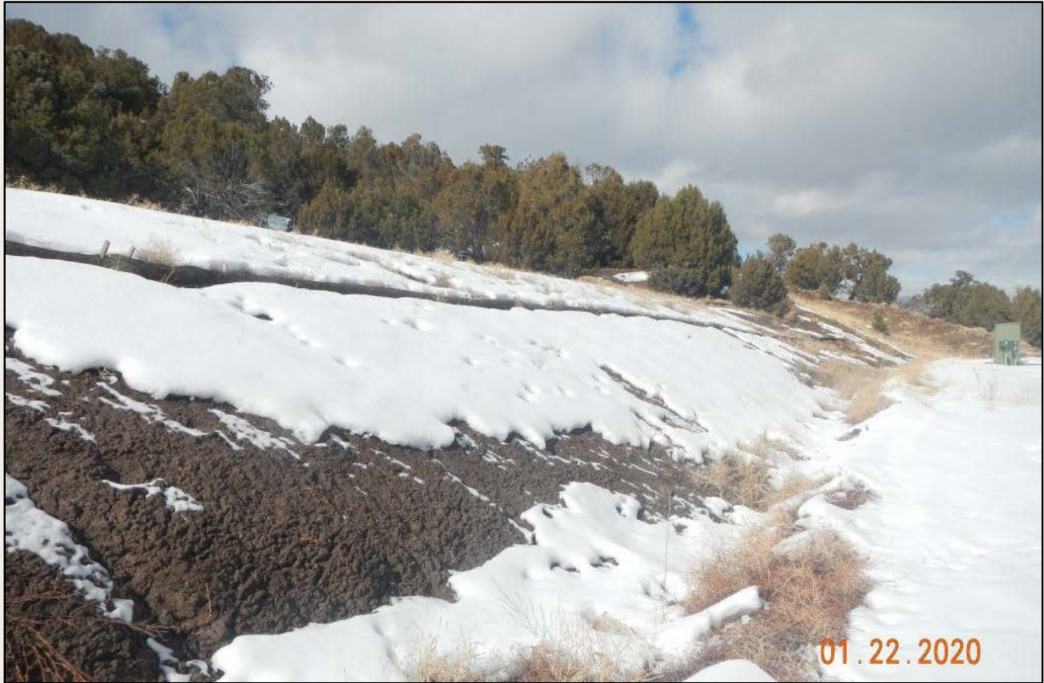
Photo 2. View of the western cut-slope from the western edge facing northward.