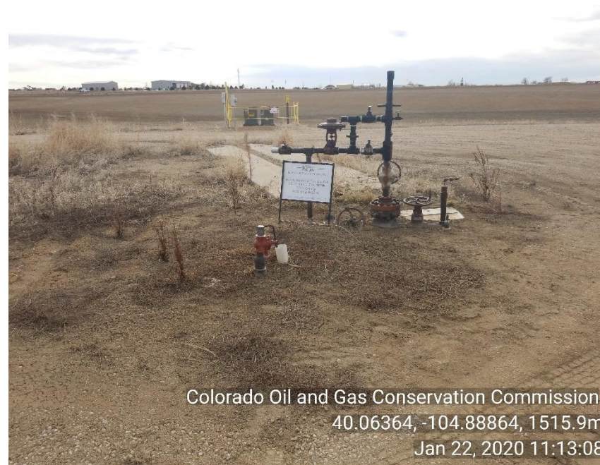
Photo 6 NRC 9-9-15H WH sign. Weeds around well head