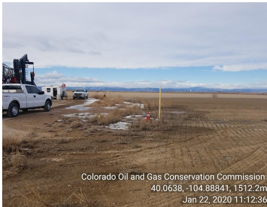
Photo 5 Weeds around Guy line anchor on location