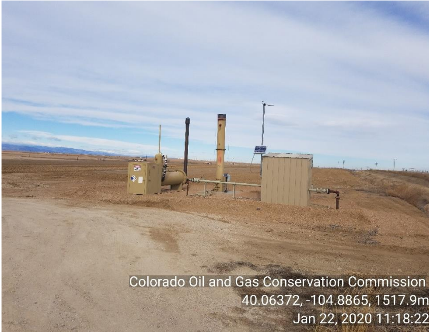
Photo 11 Sep/meter house and ECD