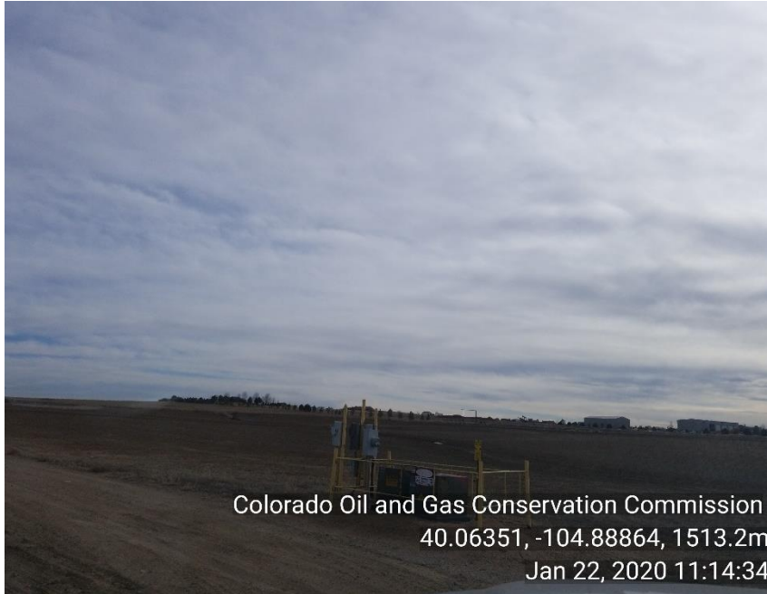
Photo 9 Electric panel