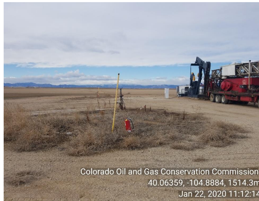
Photo 4 Weeds around Guy line anchor on location