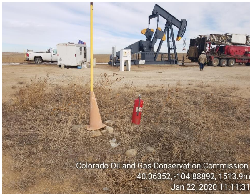
Photo 3 Weeds around Guy line anchor on location