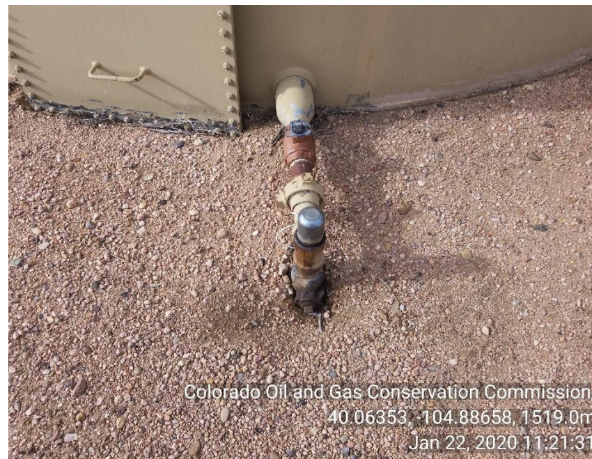
Photo 14 Mechanical issue and stained soil around crude oil tank 2" line