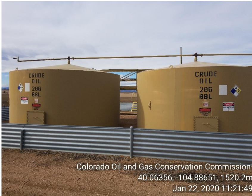
Photo 15 NFPA placards faded need to be replaced.