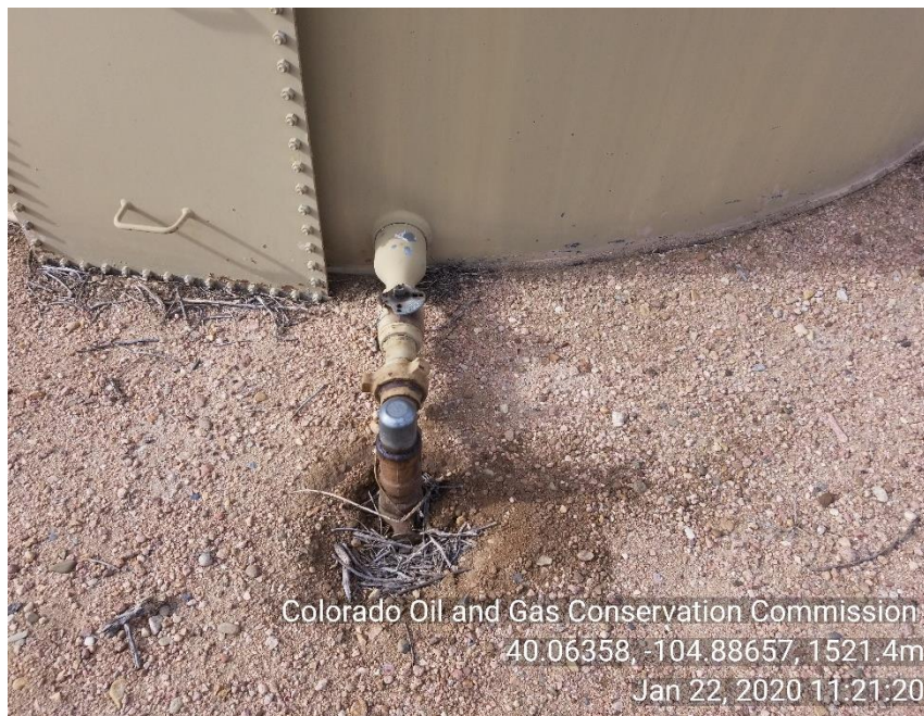
Photo 13 Mechanical issue and stained soil around crude oil tank 2" line