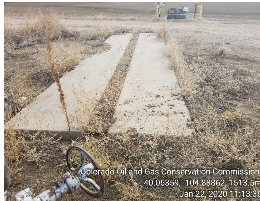
Photo 8 unused equipment Pumping unit cement base. Weeds around Well head