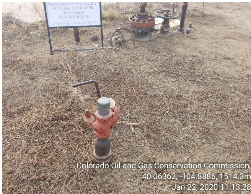
Photo 7 Unmarked unused riser not LOTO