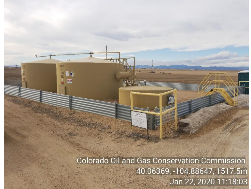
Photo 10 TNK BTRY