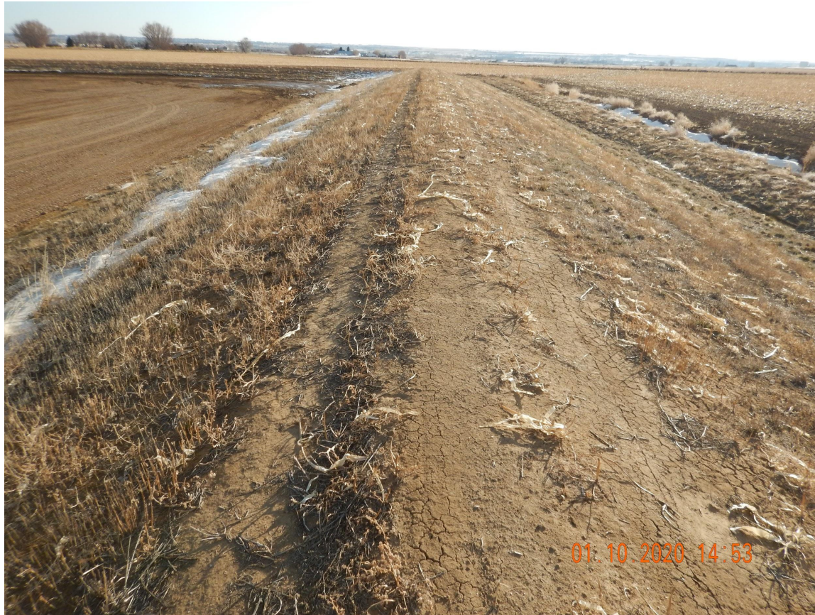
Photo 2. Photo taken from the western topsoil stockpile, facing South. Photo illustrates a topsoil stockpile. Appears the Operator has attempted to seed into the topsoil stockpile. Operator should establish perennial vegetation to ensure compliance with Rule 1002.c.

Note: Operator built this location June 2018. This location is technically out of compliance with Interim Reclamation rules- see Photo 1.