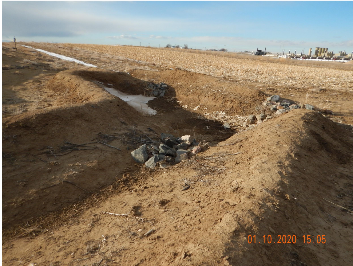
Photo 6. Photo taken from the northeastern perimeter of location, facing Northwest. Photo illustrates the stabilized outlet (sediment trap). Appears to be in proper functioning condition at the time of this inspection.