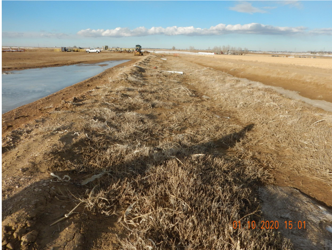
Photo 4. Photo taken from the southeastern perimeter of location, facing North. Photo illustrates the ditch BMP which is directed to a stabilized outlet (sediment trap).