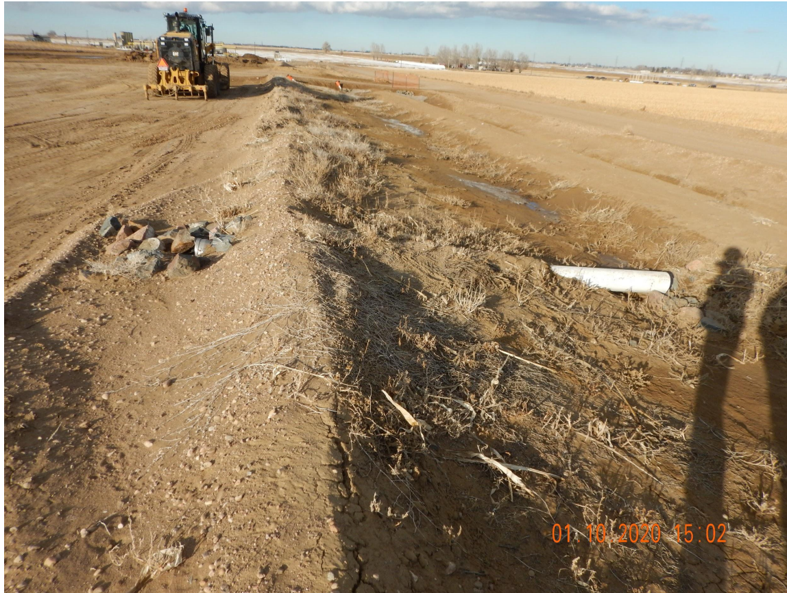
Photo 5. Photo taken from the eastern perimeter of location, facing North. Photo illustrates the ditch BMP which is directed to a stabilized outlet (sediment trap).