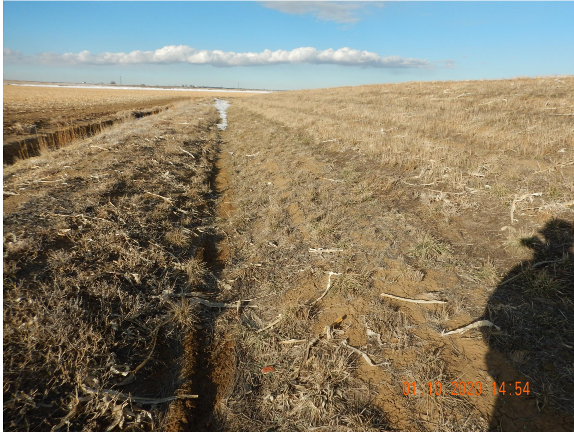
Photo 3. Photo taken from the western perimeter of location, facing North. Photo illustrates the ditch BMP which is directed to a stabilized outlet (sediment trap).