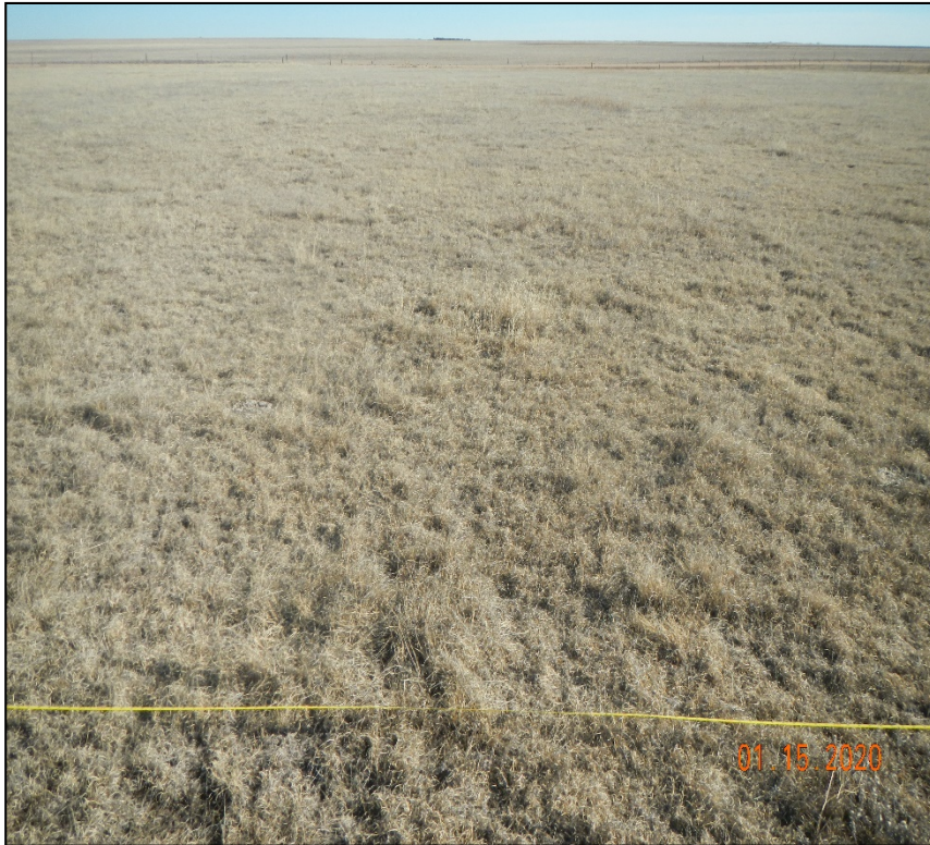
Photo 15. Facing southeast along the transect at the undisturbed reference site.