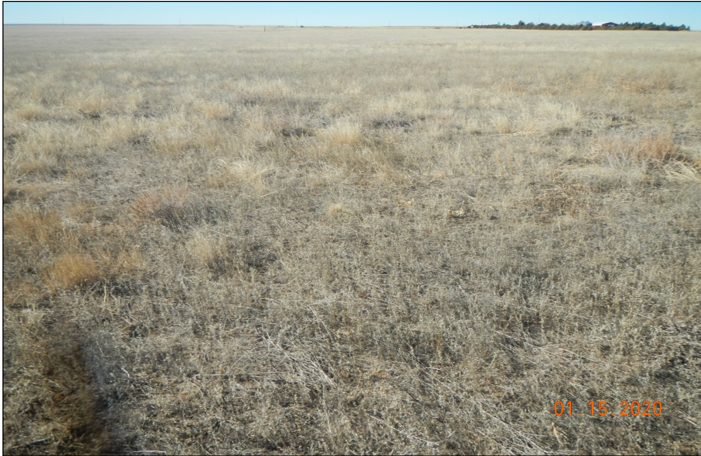
Photo 2. Center of the location facing west.