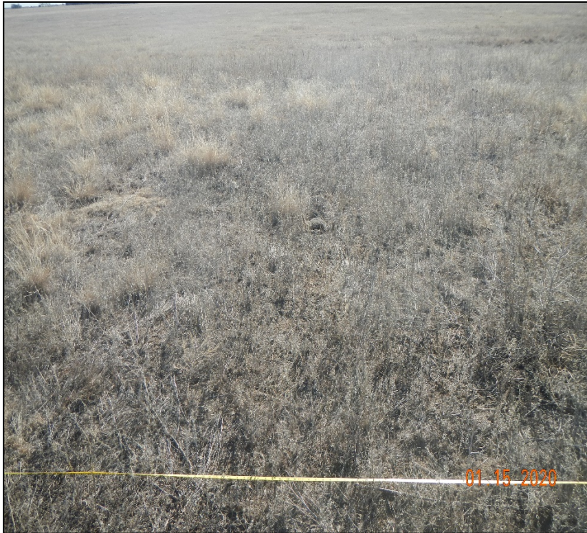
Photo 9. Facing south along the transect at the disturbed location.