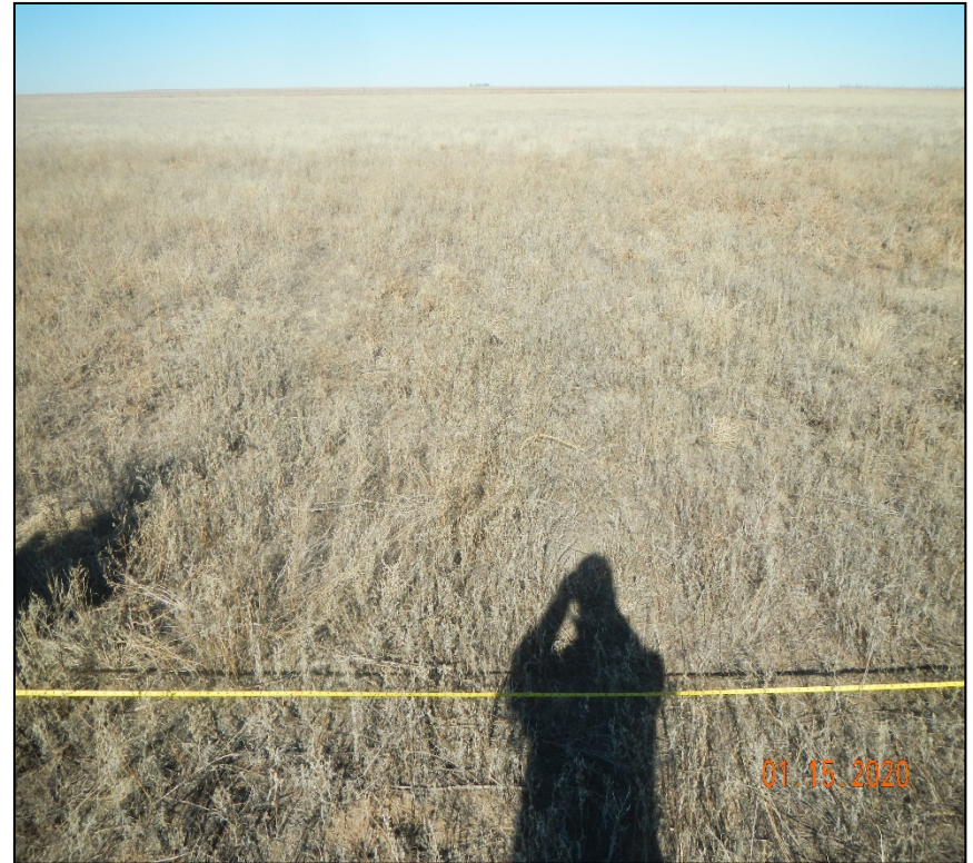
Photo 10. Facing north along the transect at the disturbed location.