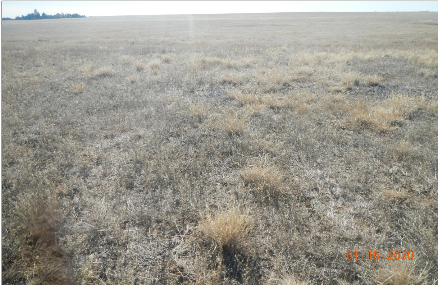
Photo 5. Center of the location facing south.