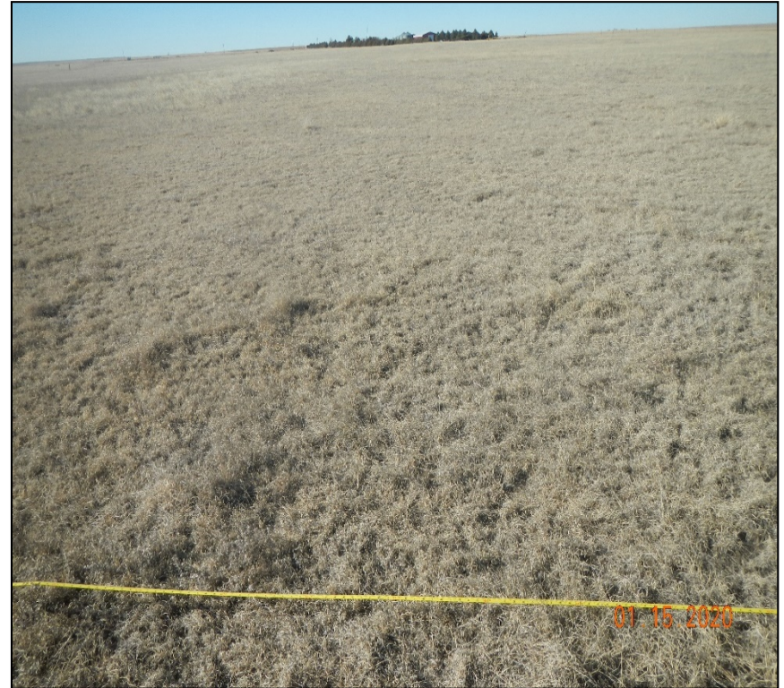
Photo 14. Facing northwest along the transect at the undisturbed reference site.