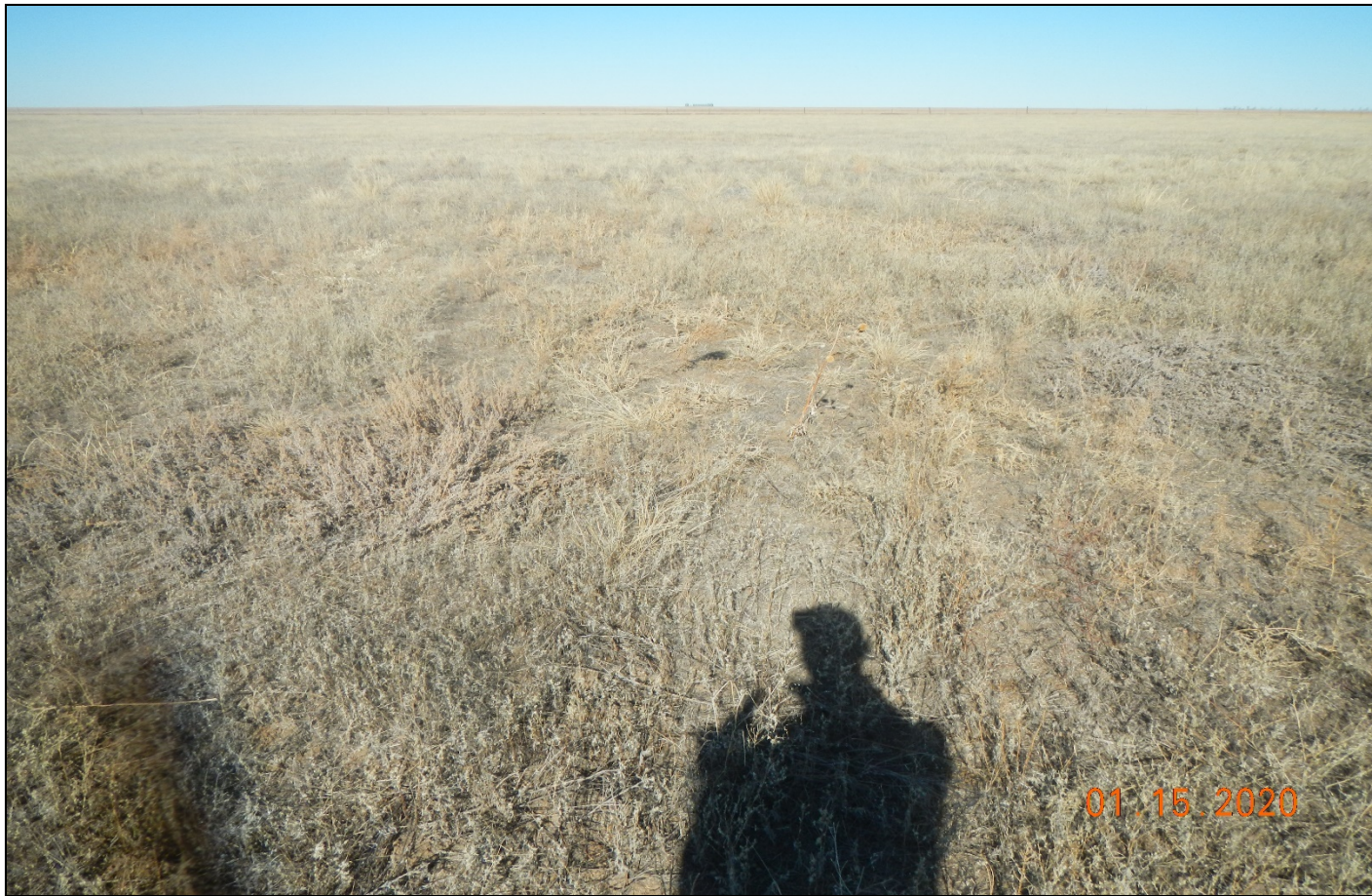
Photo 3. Center of the location facing north.