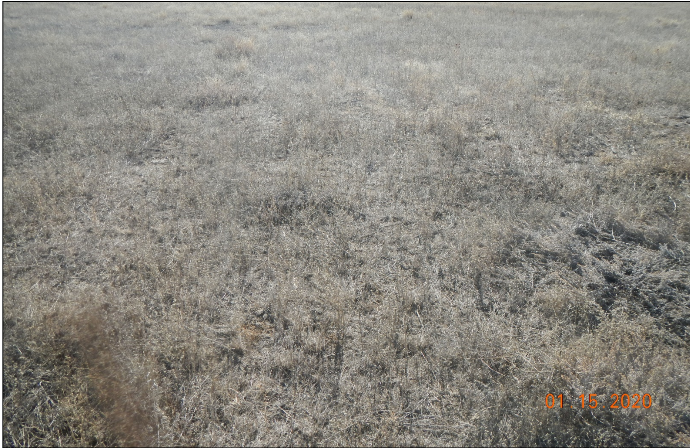
Photo 6. View of groundcover shows predominately undesirable weeds at the location.