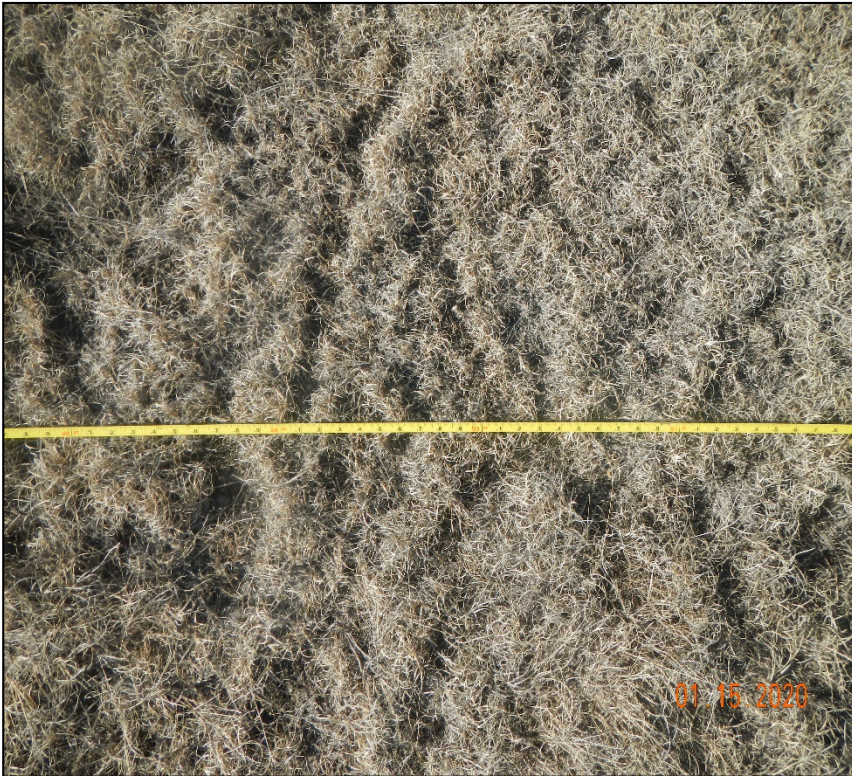
Photo 13. Ground cover at midpoint along the transect at the undisturbed reference site.