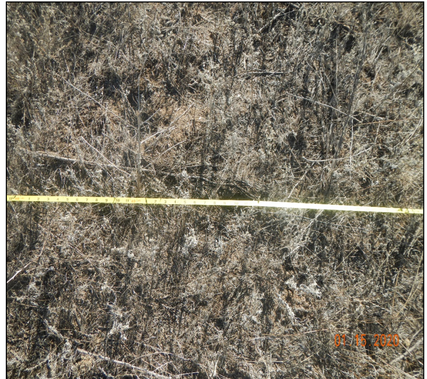
Photo 8. Ground cover at midpoint along the transect at the disturbed location.