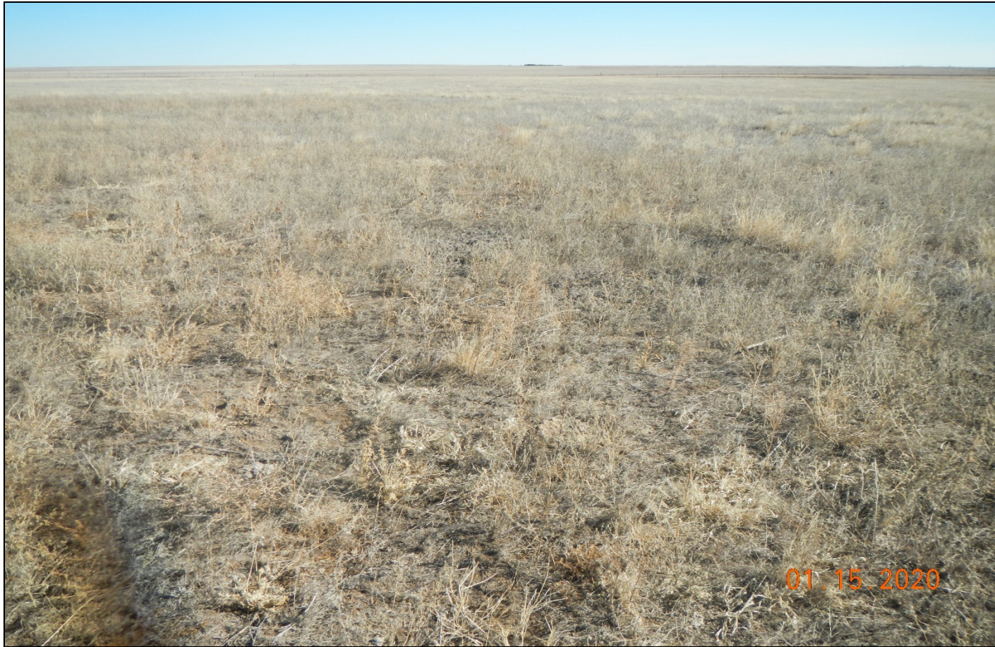
Photo 4. Center of the location facing east.