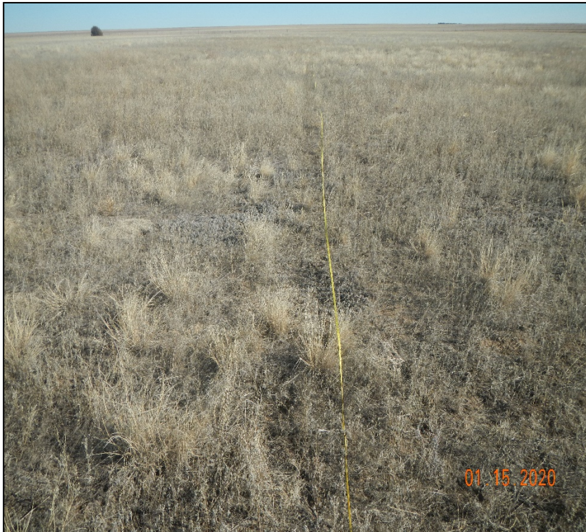
Photo 11. Facing east at the end of the transect at the disturbed location.