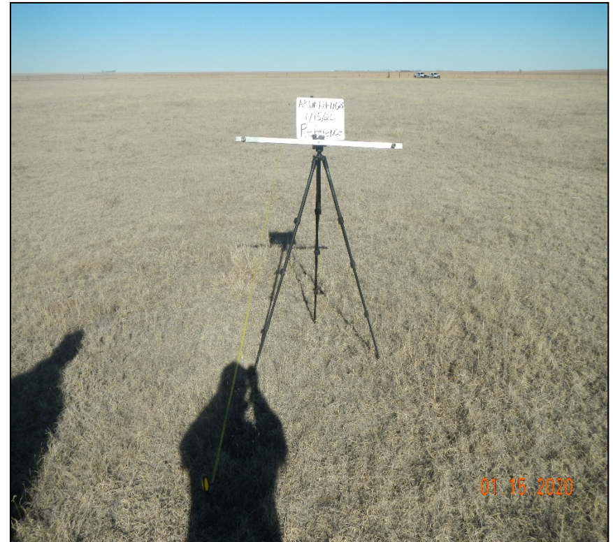
Photo 12. Facing northeast at the beginning of the transect at the undisturbed reference site.