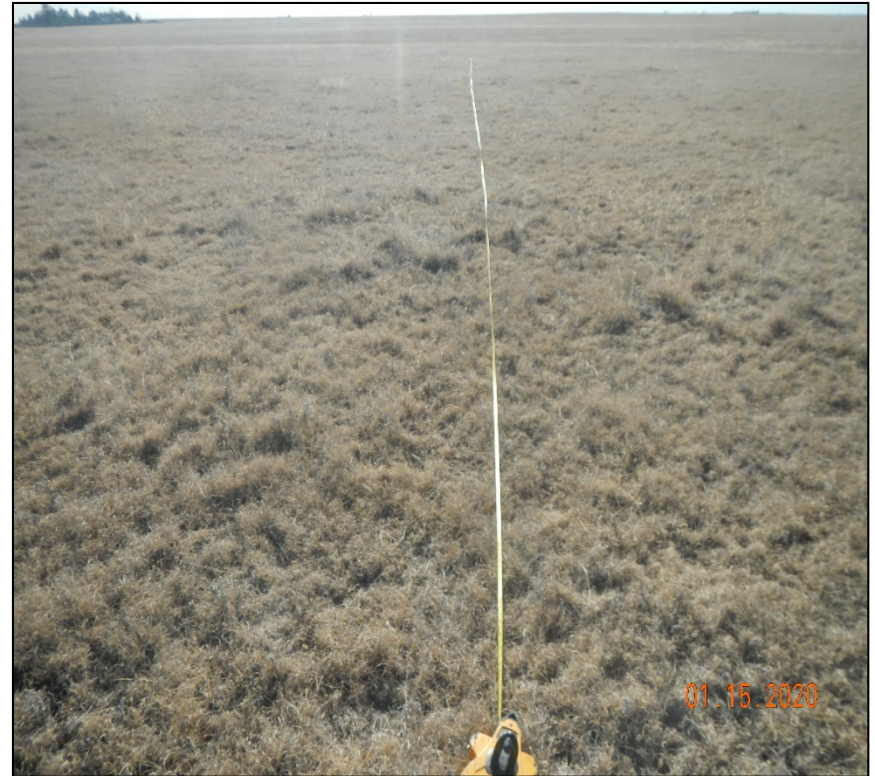
Photo 16. Facing southwest at the end of the transect at the undisturbed reference site.