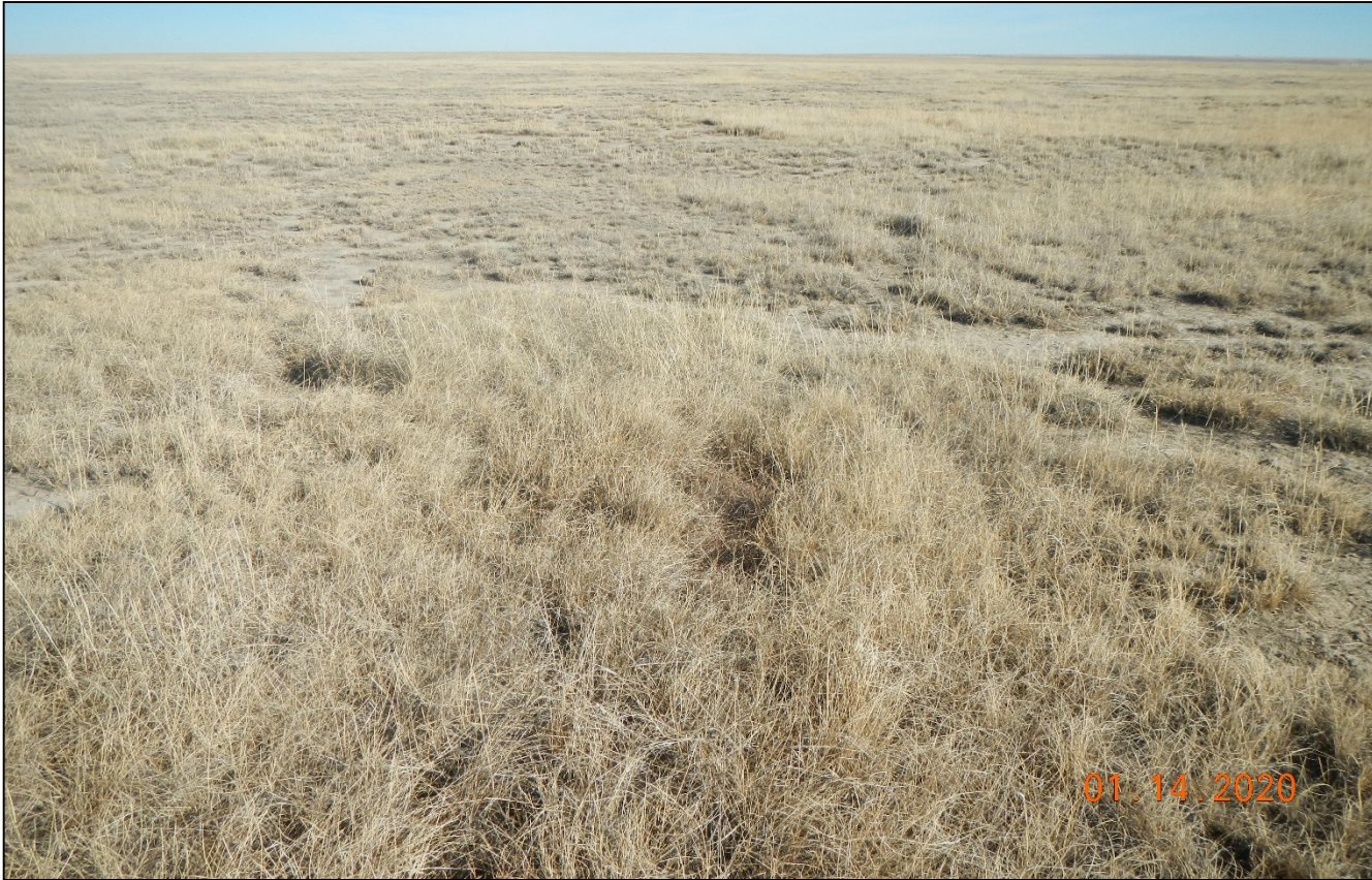
Photo 6. Facing east toward the undisturbed pasture.