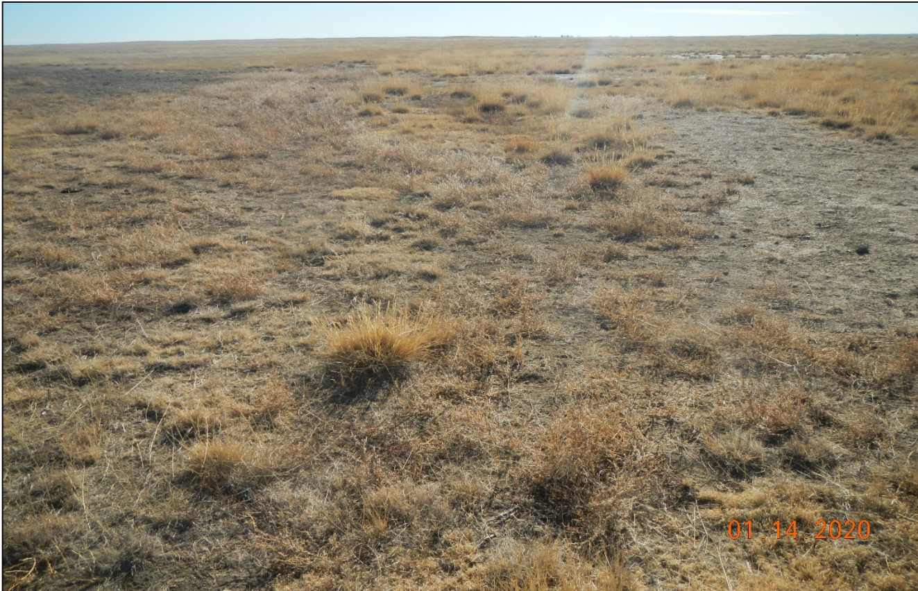
Photo 2. Center of the location facing south.