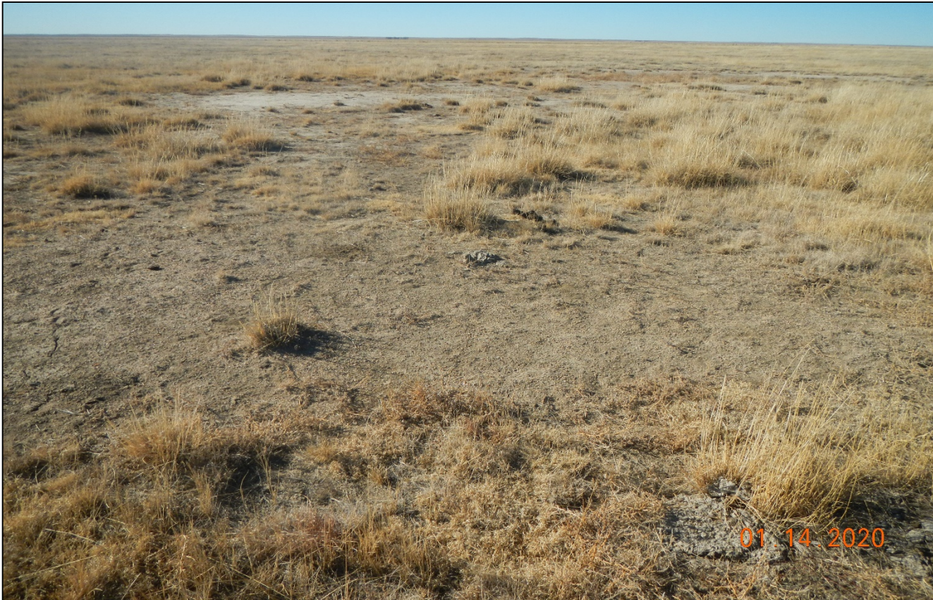
Photo 3. Center of the location facing west.