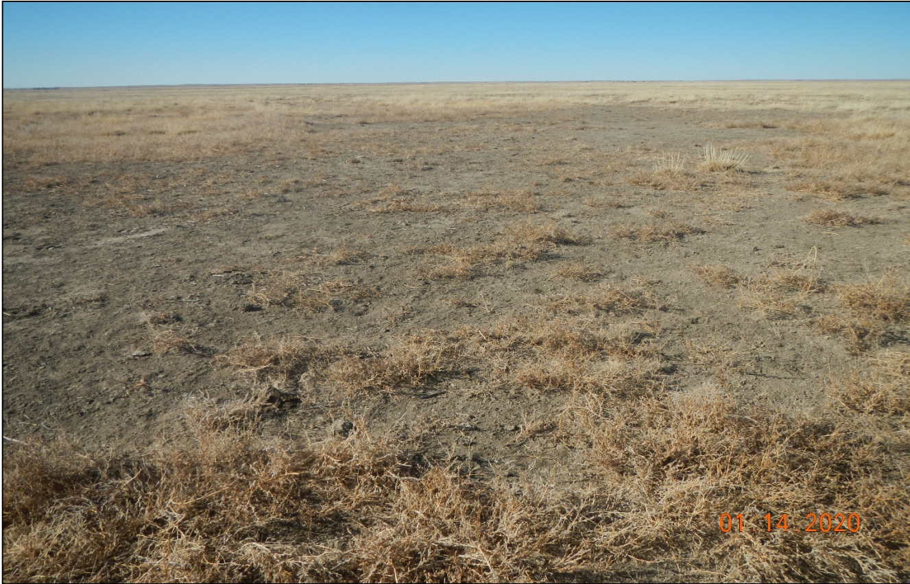
Photo 5. Facing north toward the eastern side of the location. This area is bare of vegetation. Approximately 200 ft. x 75 ft. area.