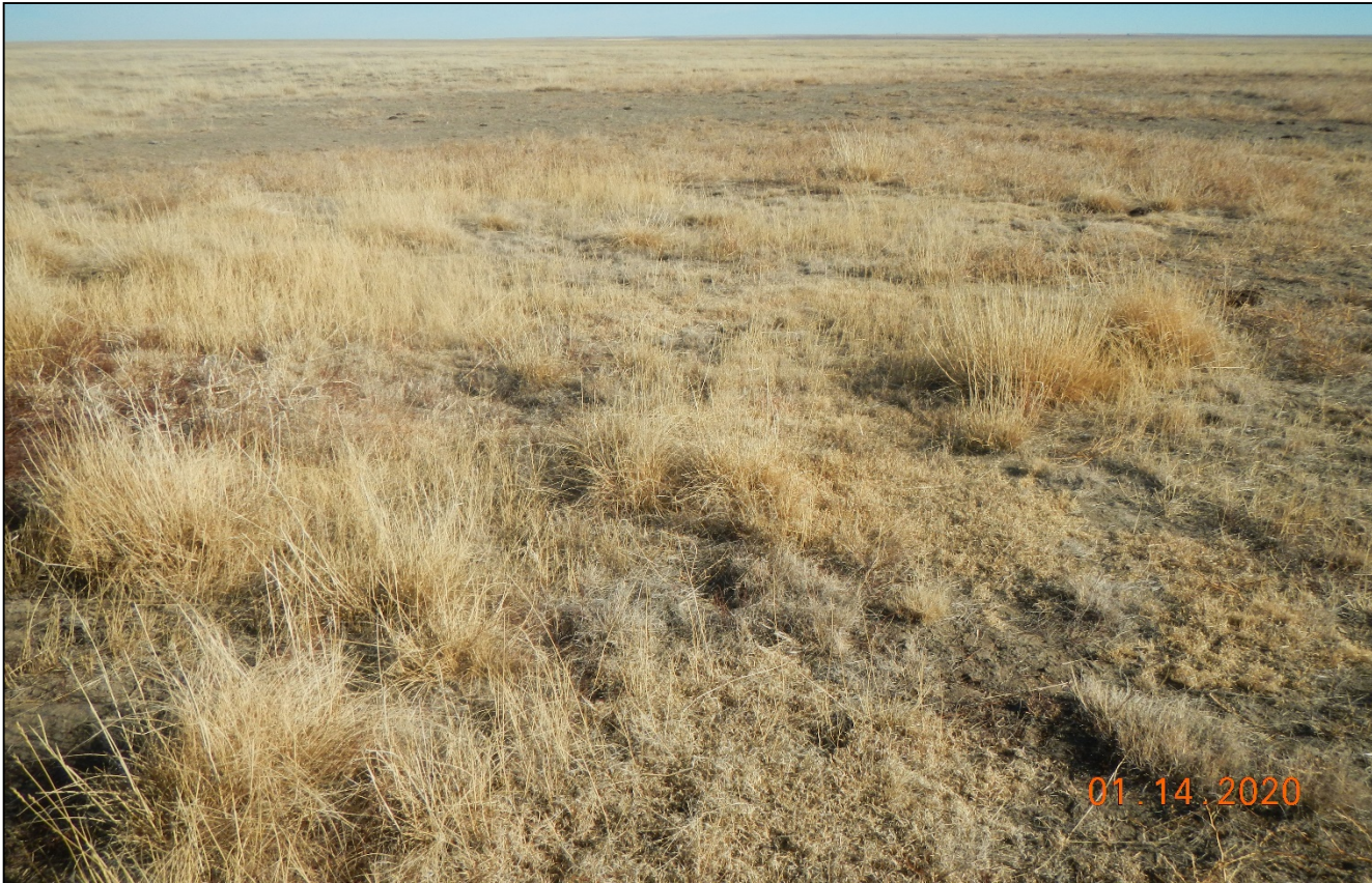
Photo 4. Center of the location facing east.