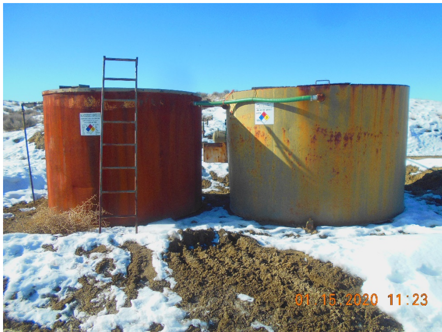
Produced Water tanks