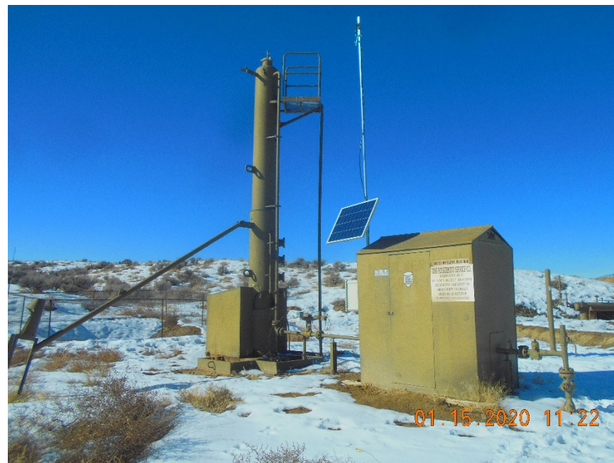
Meter housing with sign and Dehydrator