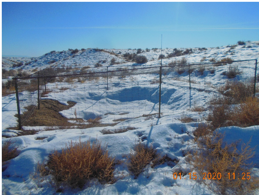
Blowdown pit with fence