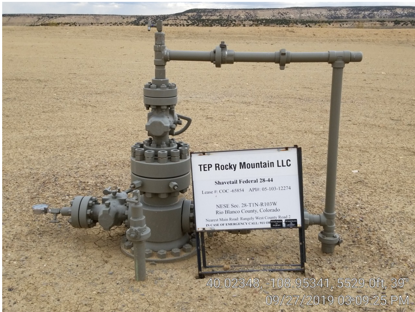
Photo 5. Well head on 9-27-2019.