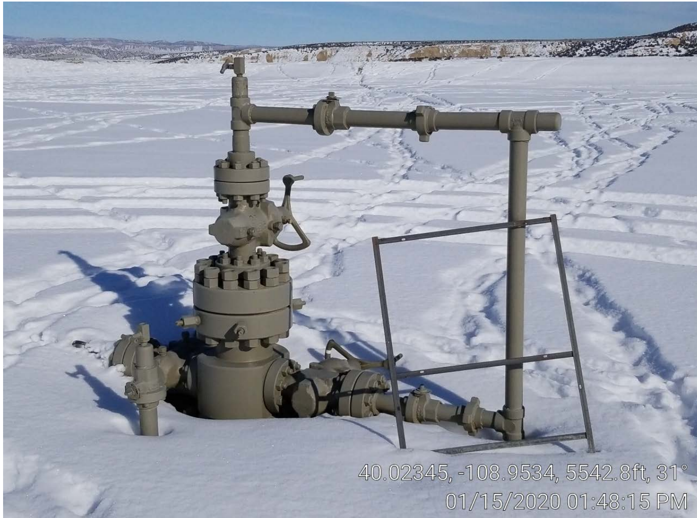
Photo 4. Well head.