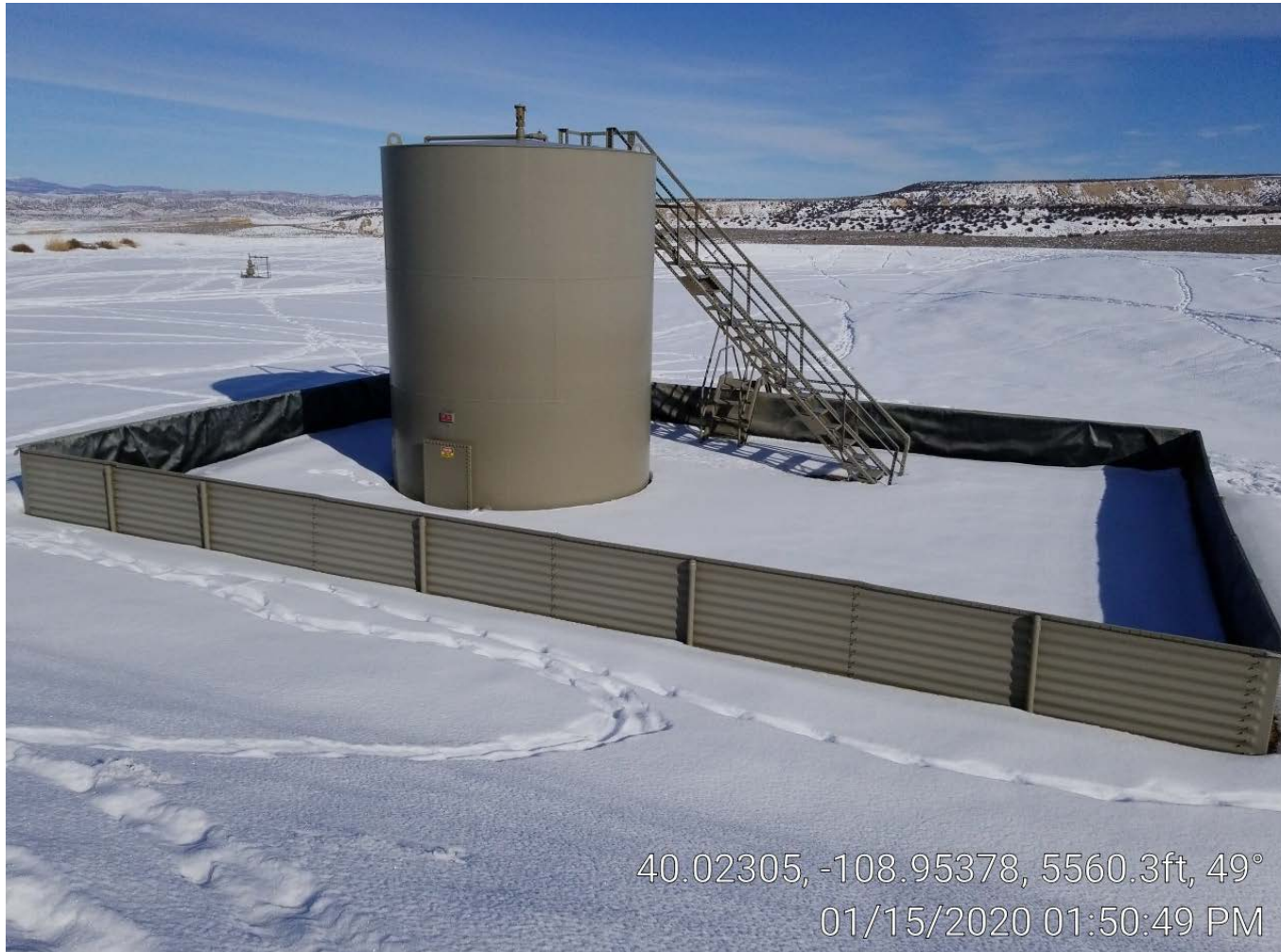
Photo 3. Tank battery.