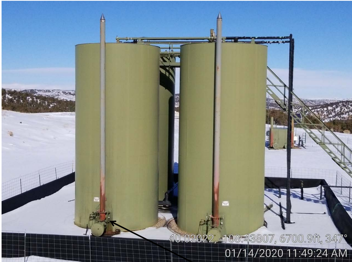
Photo 4. Tank battery.

BDU 24-30-198 pad API: 05-103-11852, 11853 Inspection: 6797069706970