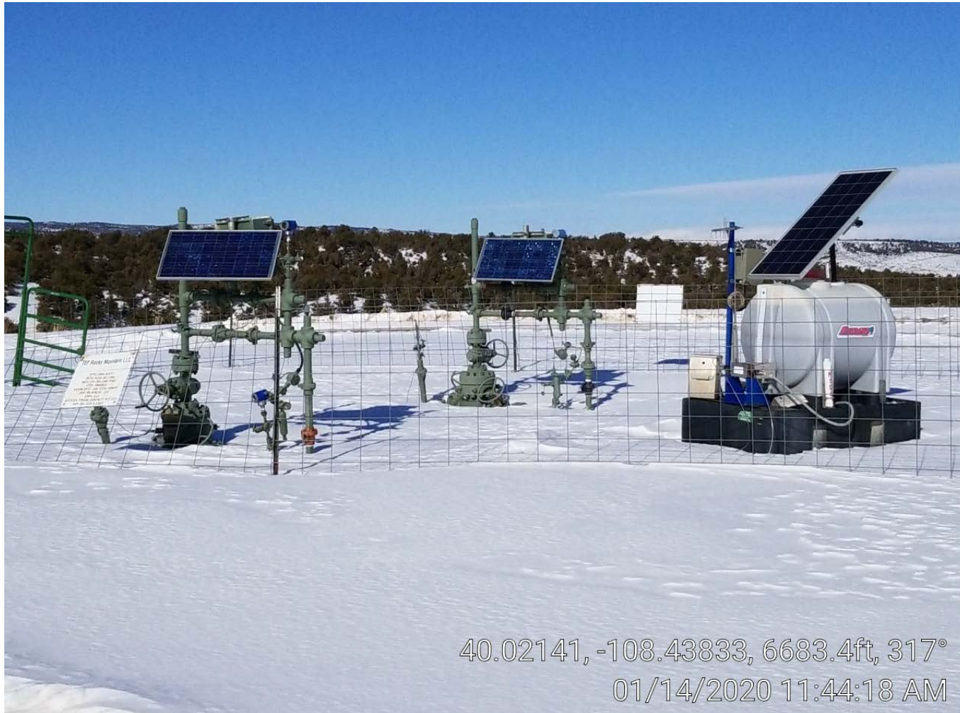
Photo 2. Well heads.

BDU 24-30-198 pad API: 05-103-11852, 11853 Inspection: 6797069706970