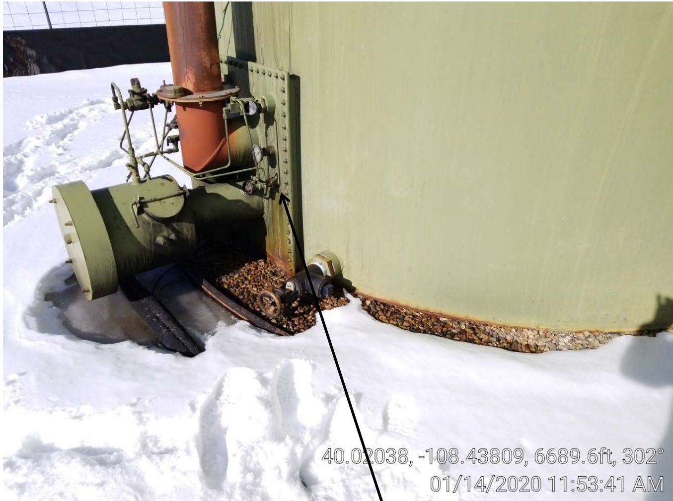
Photo 5. Back of produced water tank.

BDU 24-30-198 pad API: 05-103-11852, 11853 Inspection: 6797069706970